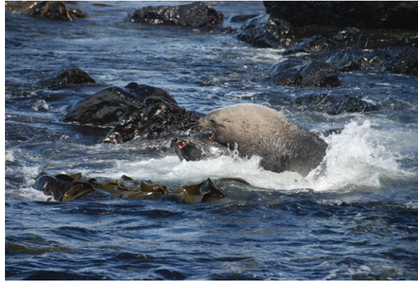
Figure 1. Territorial fight between two Antarctic fur seal bulls to gain access to females during the mating season, Kerguelen Islands.

leading to individual specializations [1]. While individual variation in resource use has been widely documented [1], less is understood about the consequences of such specialization. In environments where food is limited, foraging efficiency determines the quantity and quality of energy that can be allocated to growth, reproduction and survival. Furthermore, when targeting different resources, individuals might be exposed to different levels of threat such as predation [2] or pathogen exposure [3]. Hence, different feeding strategies could result in different fitness payoffs [4,5].