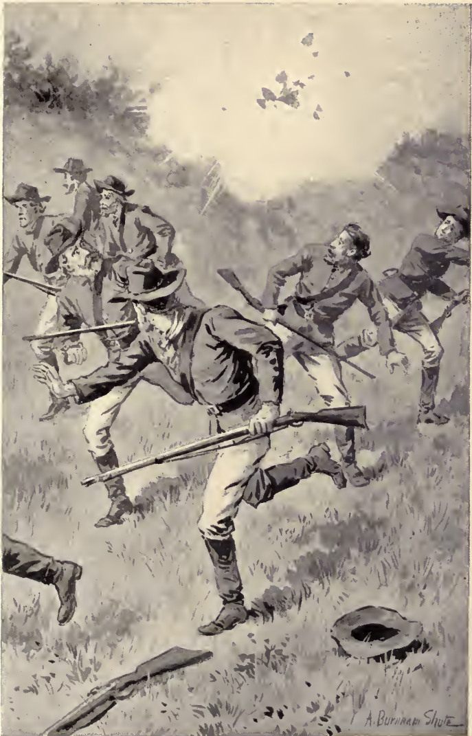
"THE SHARPSHOOTERS RUSHED DOWN THE DECLIVITY."