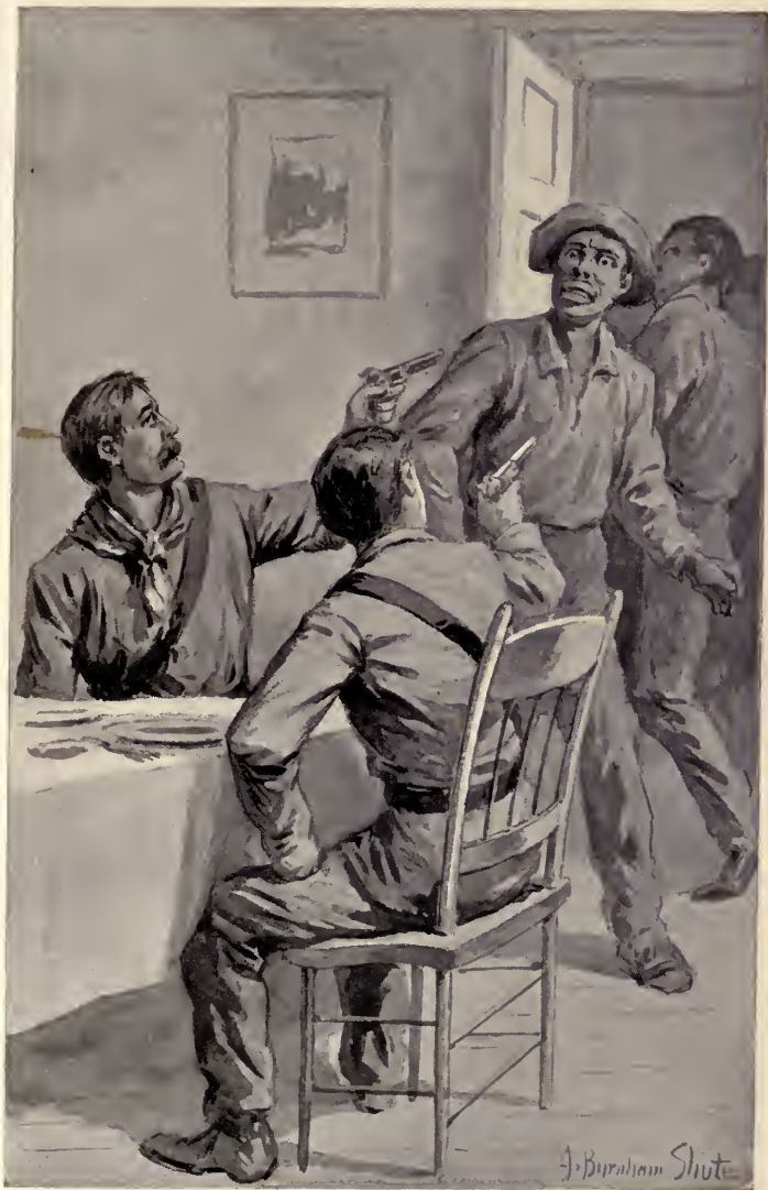
"THE UNWELCOME VISITORS POINTED THEIR WEAPONS."