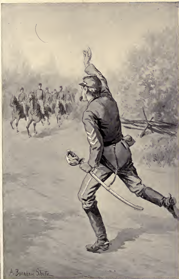
" HE SOON DISCOVERED HIS LIEUTENANT RIDING AT THE HEAD