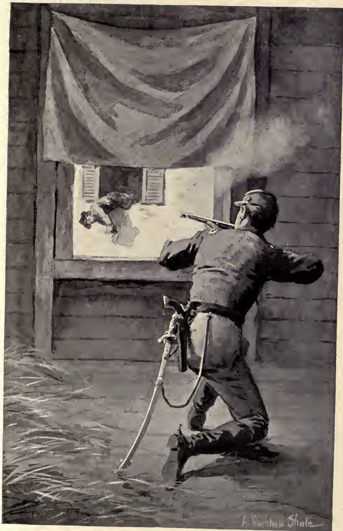
"THE BALL STRUCK HIM IN THE HEAD."