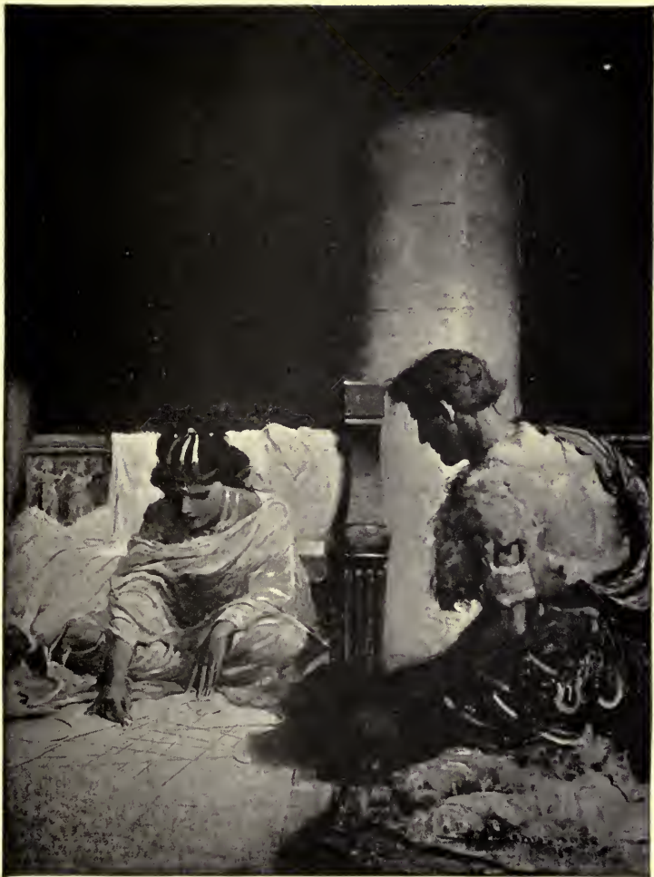
SHE DREW UPON THE MARBLE FLOOR THE FIRST MAP OF THE BARSOOMIAN TERRITORY I HAD EVER SEEN. Page 179