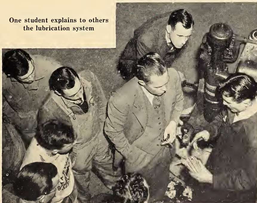
One student explains to others the lubrication system

In past years, a farmer who loved his team of horses worked them hard but took good care of them and enjoyed his outdoor jobs with these willing workers. The young farm boys of today are growing up in a world where farm tractors take the place of horses and where they in turn will learn to take good care of machinery that plays a vital part in food production today.