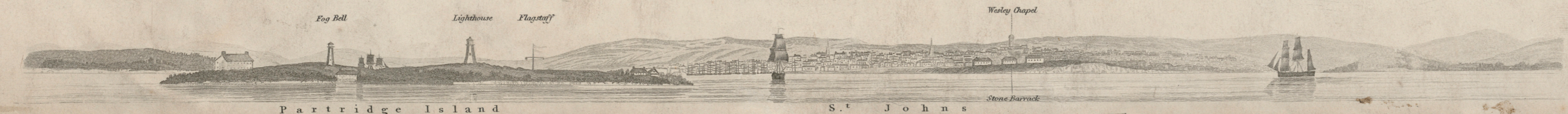
Partridge Island Light, S. John's, New Brunswick