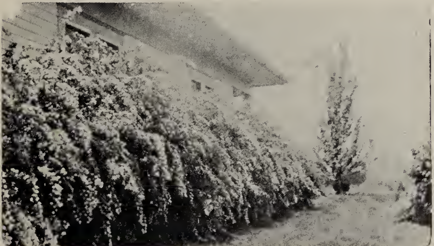
Spirea Van Houtti