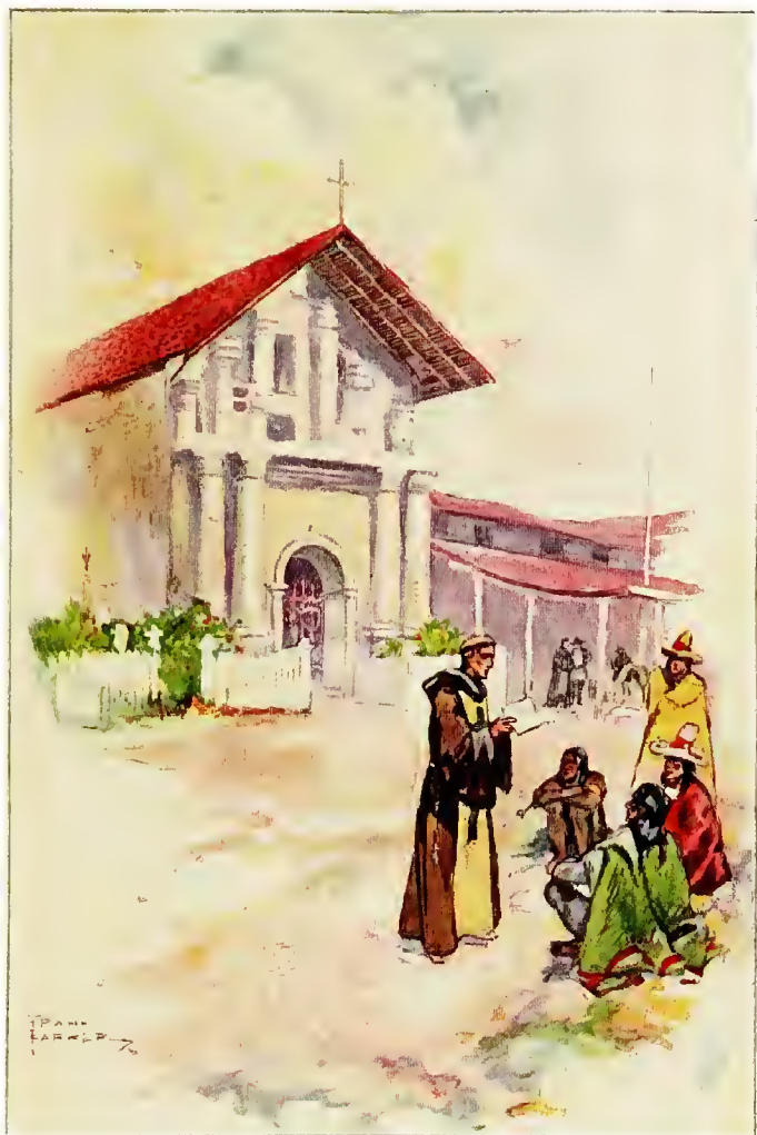
The white red-tiled church *** built of adobe, with no effort at grandeur but with a certain novel simplicity of outline. Page 72.