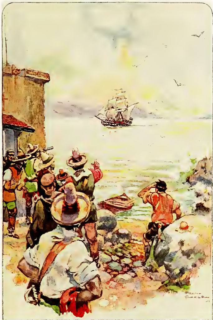
What he had taken for a pile of fallen rocks was a fort and a group of excited men at its gates. Page 9.