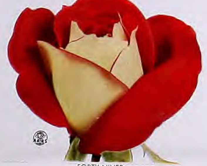
FORTY-NINER PLANT PAT. 792 $2.25 each; 3 for $6.00

HEART'S DESIRE PLANT PAT. 501 $1.75 each; 3 for $4.65