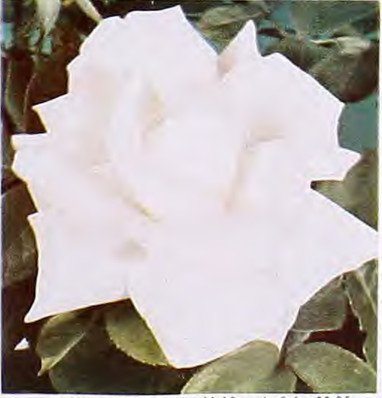
FRAU KARL DRUSCHKI-$1.10 each; 3 for $2.85