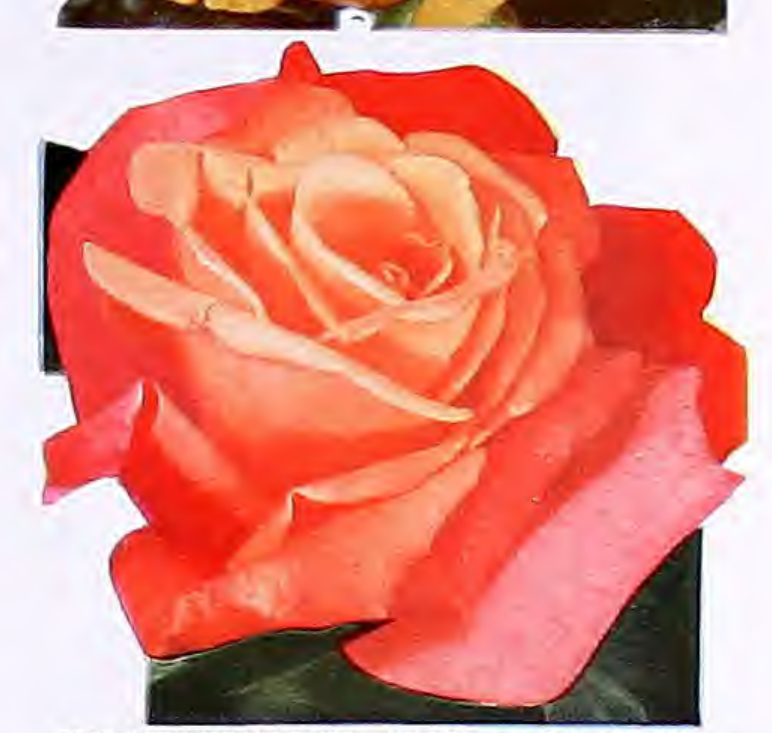
PRES. HERBERT HOOVER-$1.10 each; 3 for $2.85