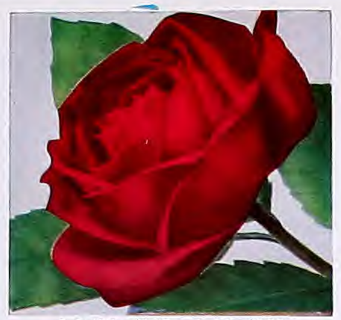
E. G. HILL-$1.10 each; 3 for $2.85

Snowflake. Pure white; profuse and continuous bloom. Very vigorous. William R. Smith. Best of all Teas for cutting! Large double flowers of softly diffused blush pink on long stiff stems.