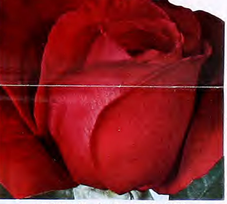
AMI QUINARD-$1.10 each; 3 for $2.85

TEXAS CENTENNIAL $1.35 each; 3 for $3.50