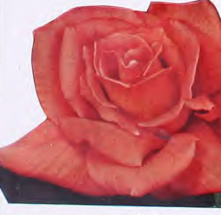
MOJAVE PLANT PAT, 1176 $2.75 each; 3 for $7.20

High Noon. CHT. Plant Pat. 704. A vigorous, upright pillar. Brilliant lemon-A yellow, double, loosely cupped blooms with spicy fragrance. Leathery, glos-sy foliage. $2.50 each; 3 for $6.60.