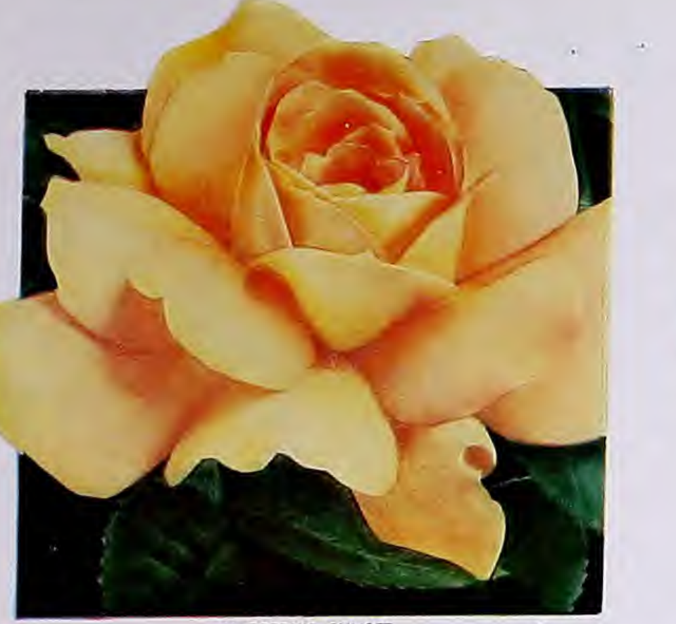
McGREDY'S SUNSET PLANT PAT. 317 $1.75 each; 3 for $4.65