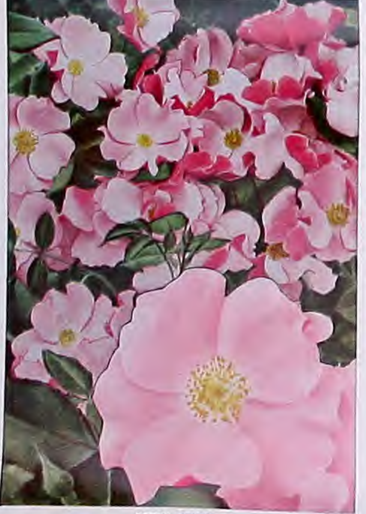
BETTY PRIOR PLANT PAT. 340 $1.75 each; 3 for $4.65