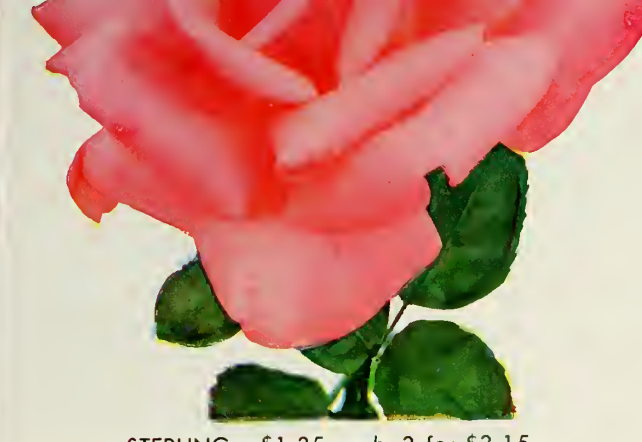
STERLING-$1.25 each; 3 for $3.15