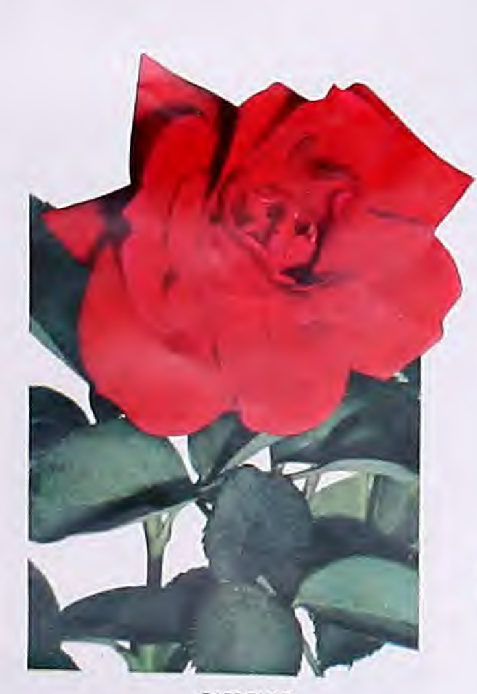
CARROUSEL PLANT PAT. 1066 $2.00 each; 3 for $5.25