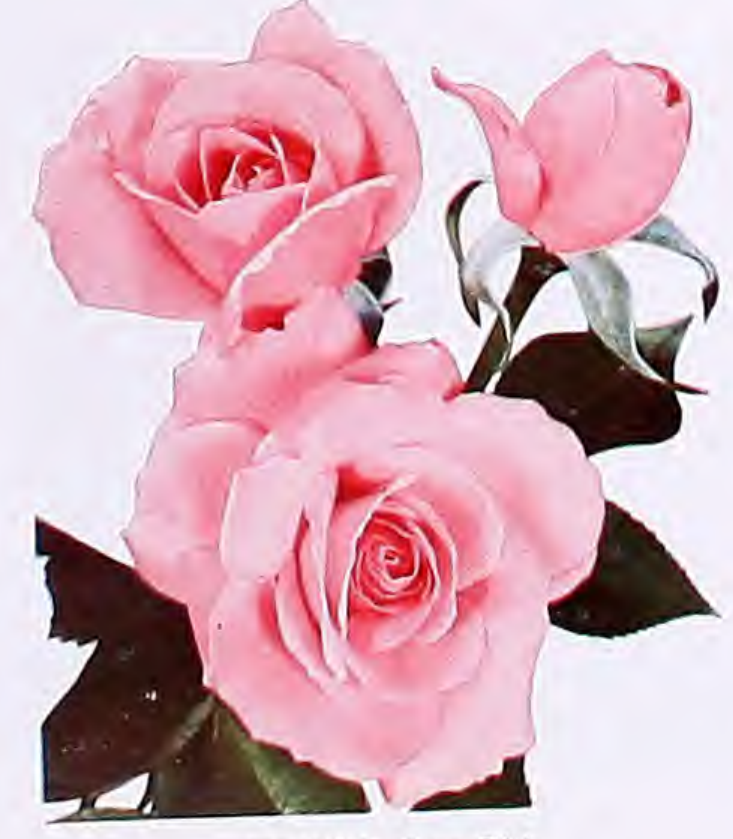
ROSENELFE (Rose Elfe) $1.25 each; 3 for $3.15