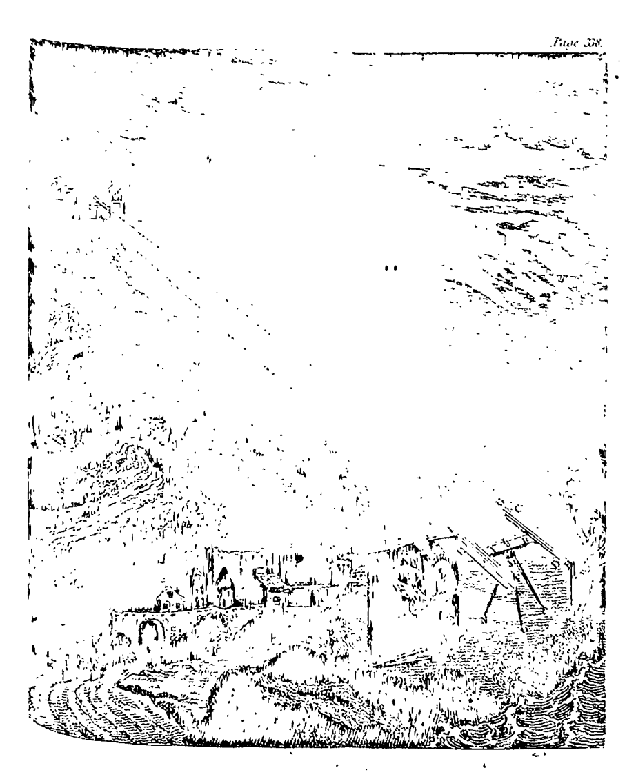
SIGNALS BY THE.