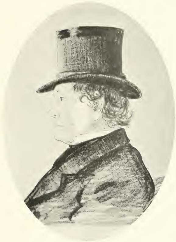
WILLIAM McÉLROY Of Albany, 1796—1887