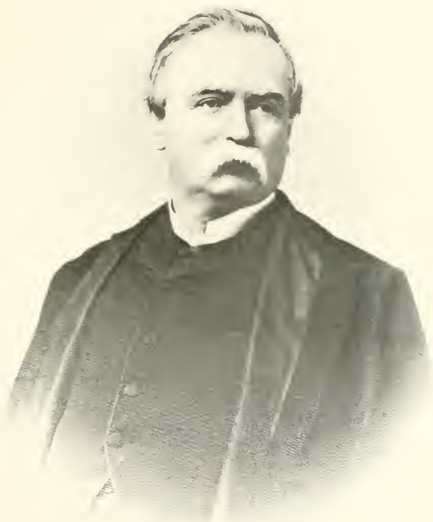
HON. J. PROCTOR KNOTT