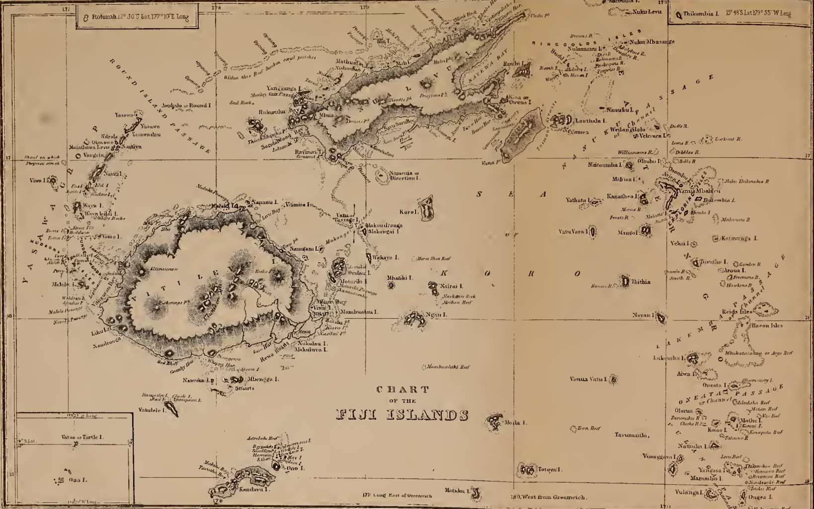
CHART OF THE FIJI ISLANDS

Thikombia I. 15° 48' S Lat 179° 55' W Long