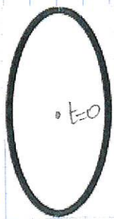
Fig 5b : observateur extérieur