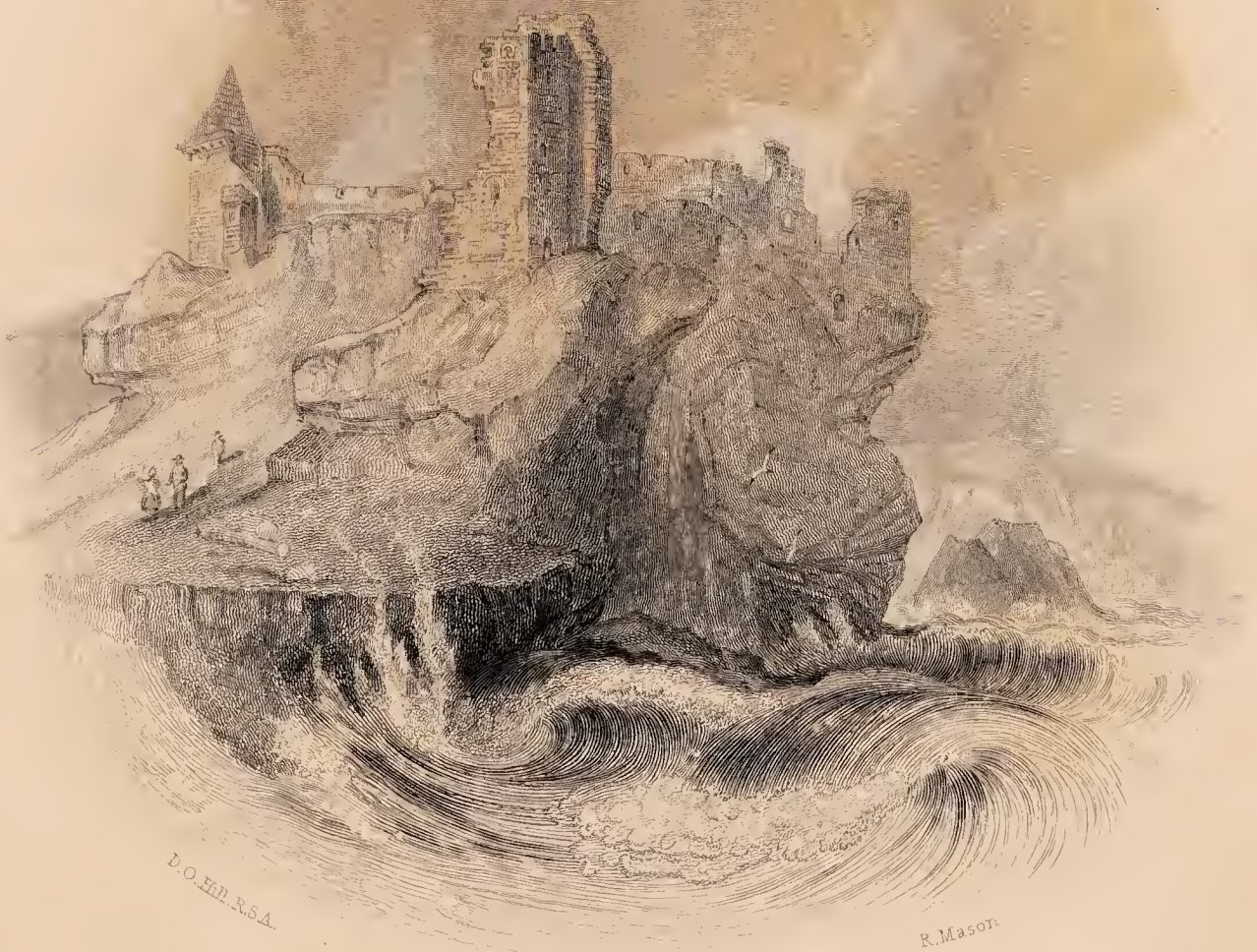
Cardinal Beaton's Castle.