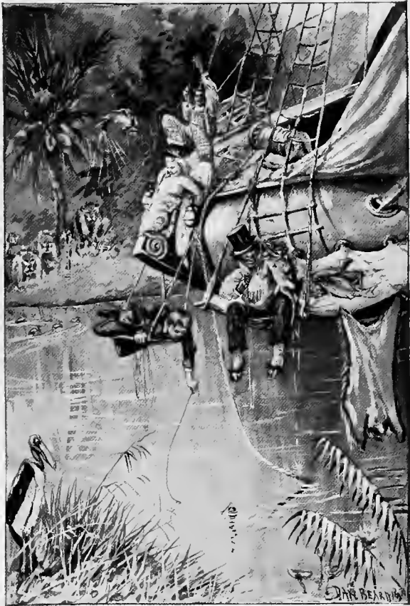
“WE CATCHED FISH”