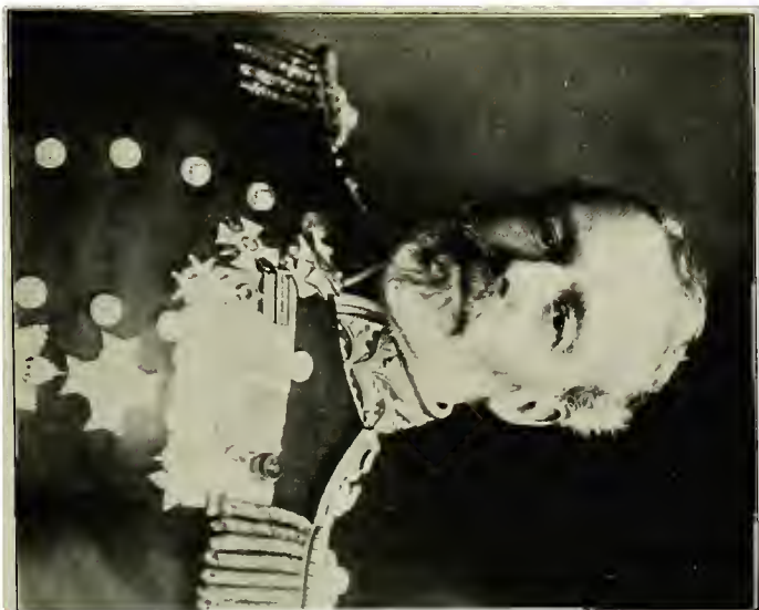
ADMIRAL SIR CHRISTOPHER CRADOCK