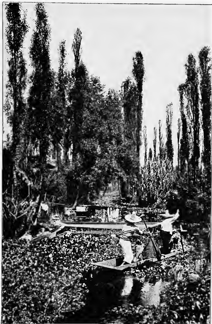
THE FLOATING GARDENS OF XOCHIMILCO