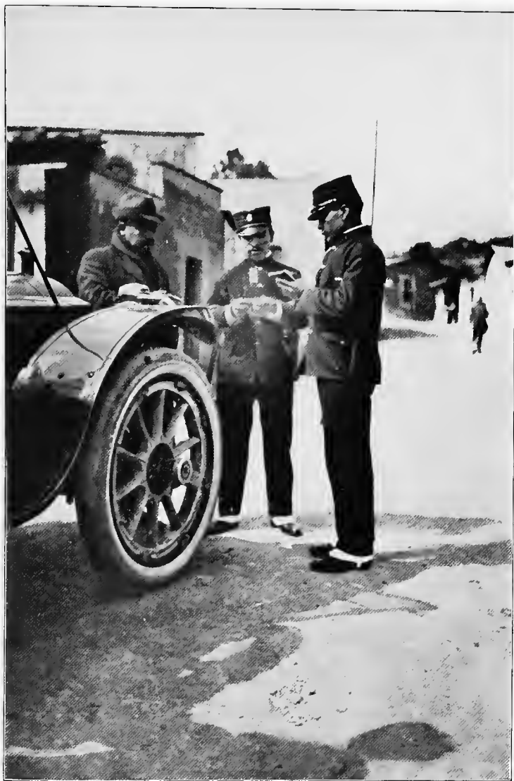
THE GUARD THAT STOPPED US