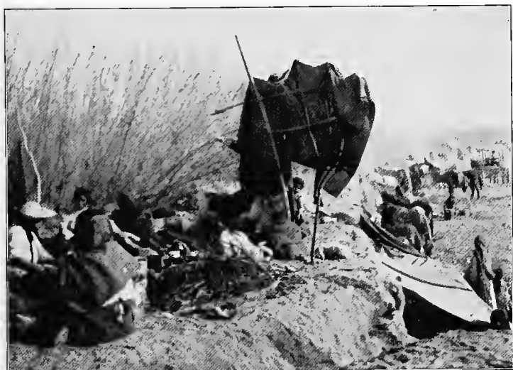
HUERTA'S SOLDIERS WATCHING THE REBEL ADVANCE