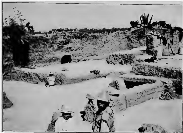
THE "DIGGINGS" (AZCAPOTZALCO)