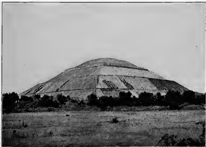
THE PYRAMID OF SAN JUAN TEOTIHUACAN