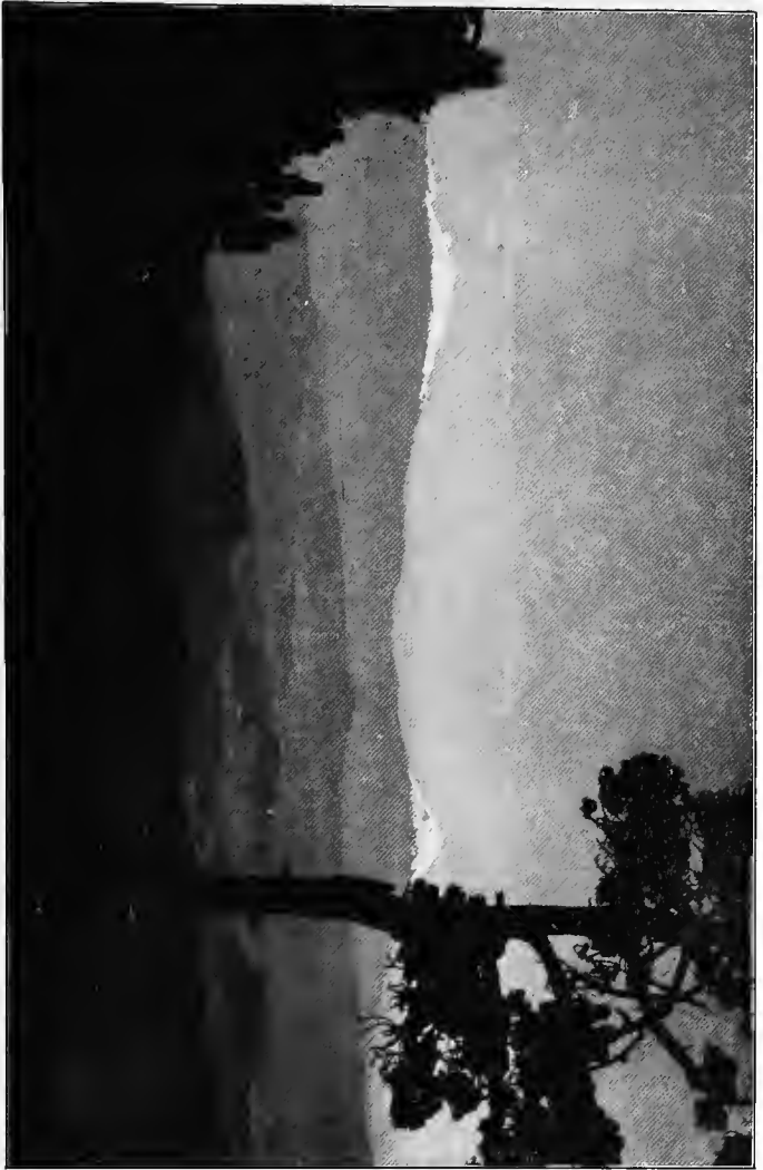
A VIEW OF POPOCATEPETL AND IZACCIHUATL