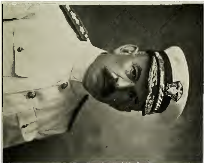
ADMIRAL F. F. FLETCHER