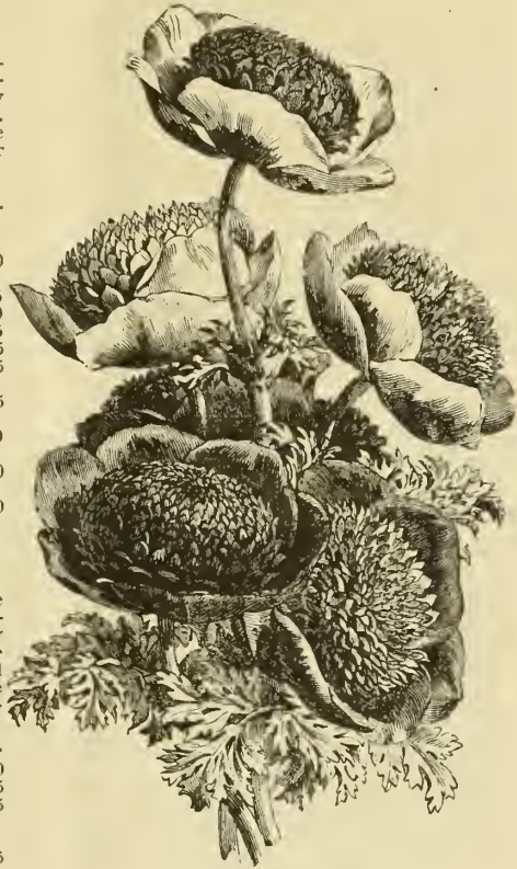
DOUBLE FRENCH ANEMONE.