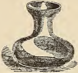
TYE'S STYLE HYACINTH GLASS.