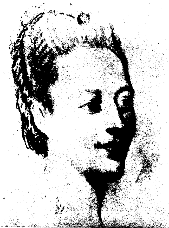
Belle de Zuylen (Zélide) about 1766, from a drawing by Maurice Quentin de La Tour, in the Louvre.