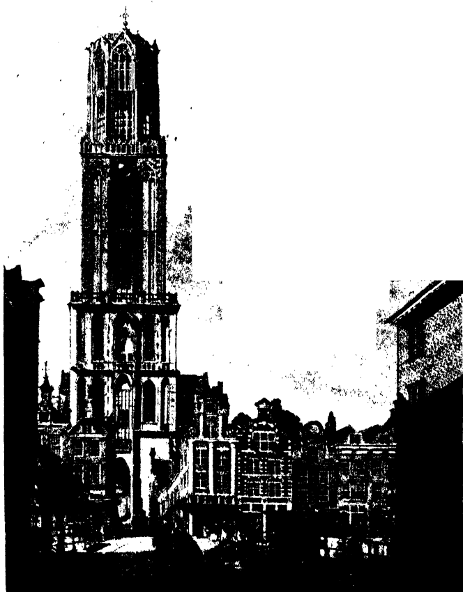
The Tower of the Cathedral and part of the Cathedral Square, Utrecht, as seen from the west, from a wash drawing in ink by J. de Beyer 1746. Boswell's rooms, which cannot be seen from the artist's vantage point, were at the west end of the Square and facing the Tower.