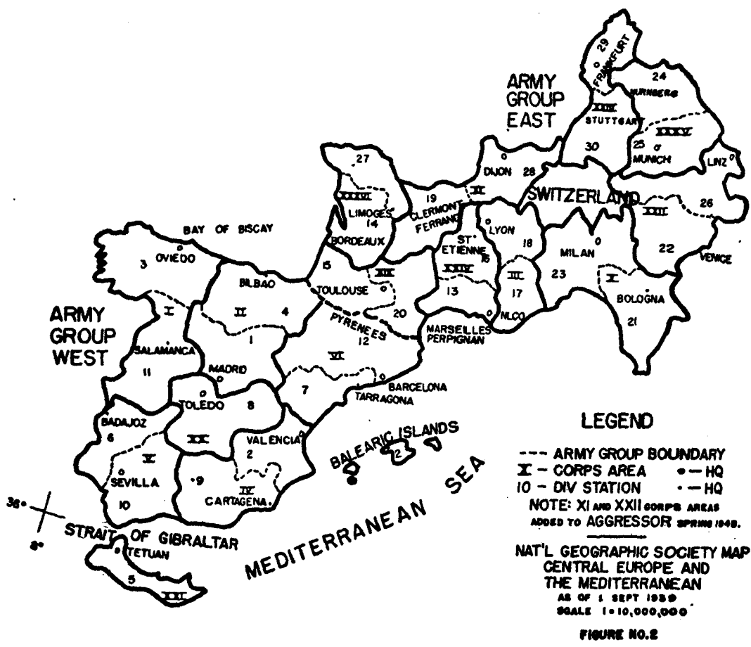
Figure 2. Aggressor territorial organization 1947-49.