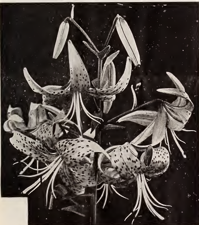
LILIUM TIGRINUM—The Old Fashioned Tiger Lily