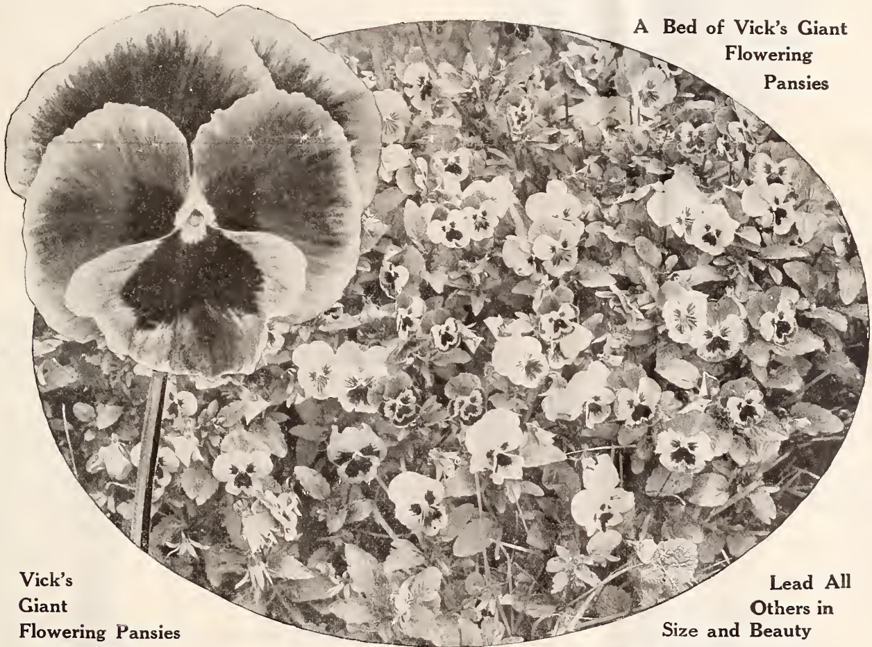
Vick's Giant Flowering Pansies

We have discarded the old style, small flowered, so called Standard Pansies and under the heading of Giant Flowering Pansies we list the better known named varieties of the popular "Giant" strain. Seed should be sown in mid-summer where it can be shaded and watered and the plants given the protection of leaves or straw over winter where they are not planted in cold frames.