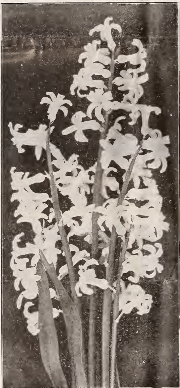
EARLY ROMAN HYACINTHS

Chinese Lilies are so high priced that there will be an enormous demand for Paper Whites.