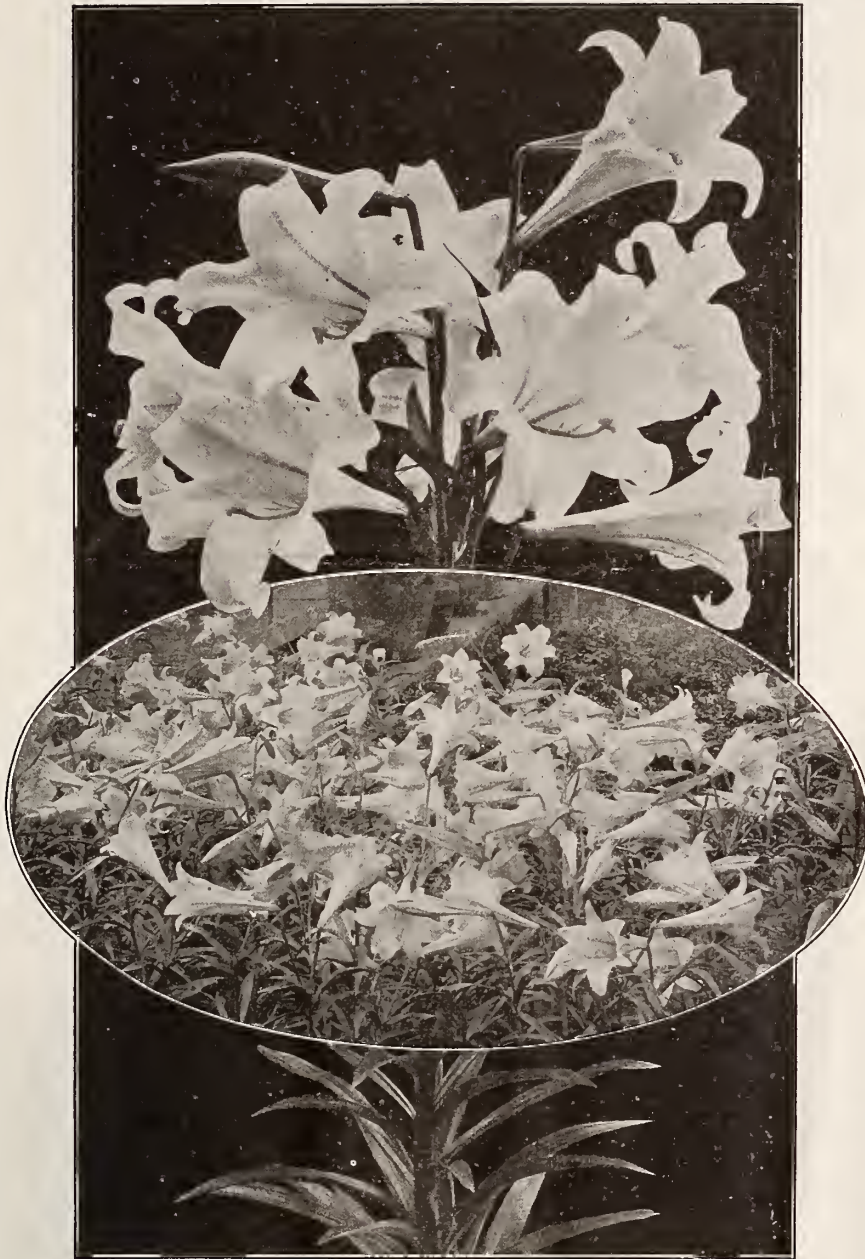
LILIUM HARRISII ( True Bermuda Easter Lily )

slender stems. Unsurpassed in stateliness and beauty. Large size bulbs, per dozen, $8.00. Extra large bulbs, per dozen, $1.50 ; per hundred, $10.00. Mammoth bulbs, per dozen, $1.75 ; per hundred $12.00.