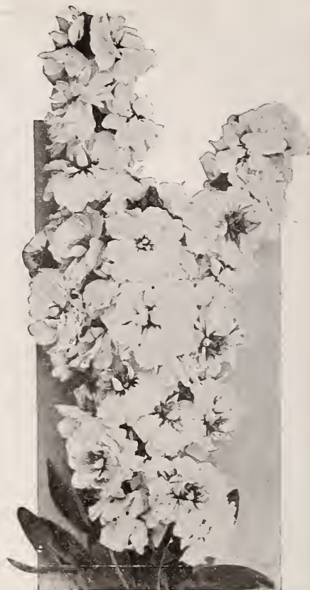
STOCKS, CUT and COME AGAIN

Stocks grow very rapidly, throw out numerous side branches, all of which bear very double fragrant flowers valuable for cutting. They grow so rapidly, bloom so profusely and continuously and require relatively so little attention that they are a real money making crop. Our offering of Stocks shown on this page includes all the very best and most popular varieties.