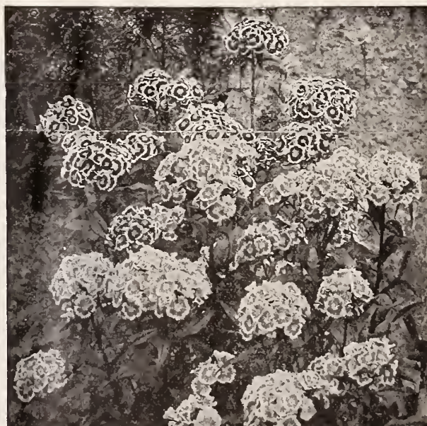
SWEET WILLIAM, HOLBORN GLORY

In our Nursery at Barnards, N. Y., there is no more beautiful sight during the months of June and July than our fields of Sweet William growing for seed. The center is a riot of colors in mixtures flanked on each side by blocks of solid colors of either the beautiful Holborn Glory, Dunnett's Dark Crimson, Double White or Pink Beauty.