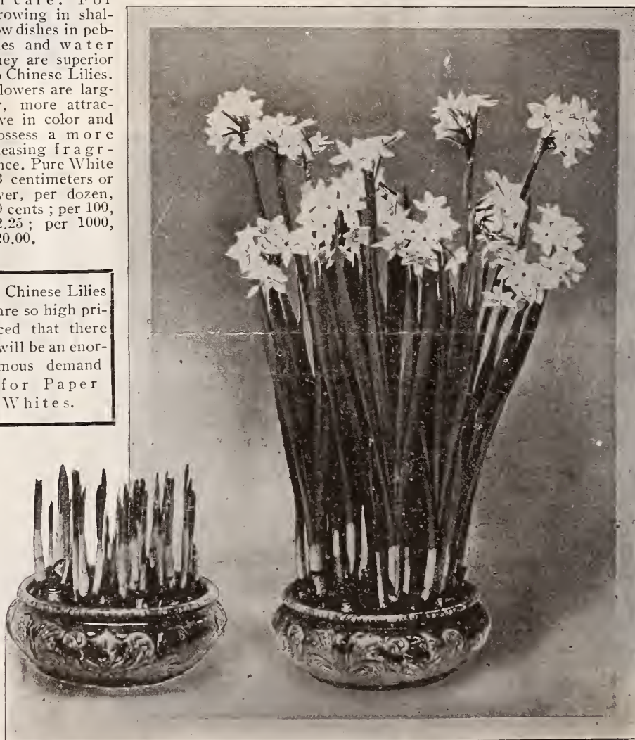
NARCISSUS, PAPER WHITE GRANDIFLORA

Per dozen 30 cents; per 100, $1.75; per 1000, $15.00.