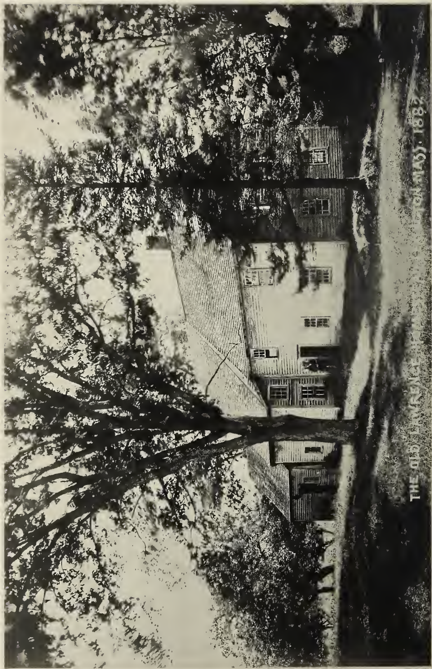
THE OLD HOUSE, NEW BRUNSWICK, N. J., 1882