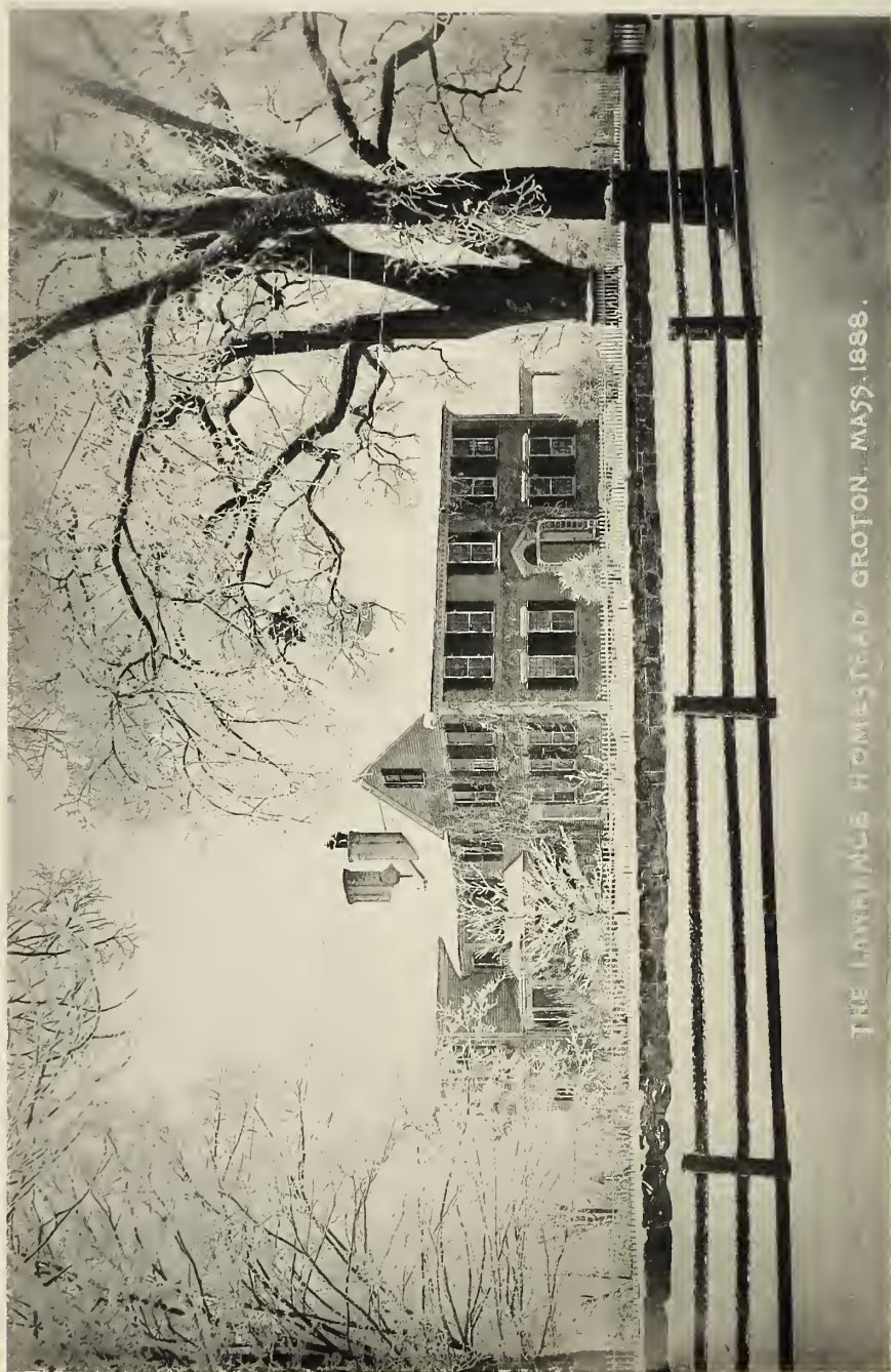
THE LAWRENCE HOMESTEAD GROTON, MASS. 1888.

SHOWING THE OLDER PART OF THE HOUSE, BUILT ABOUT THE YEAR 1796.