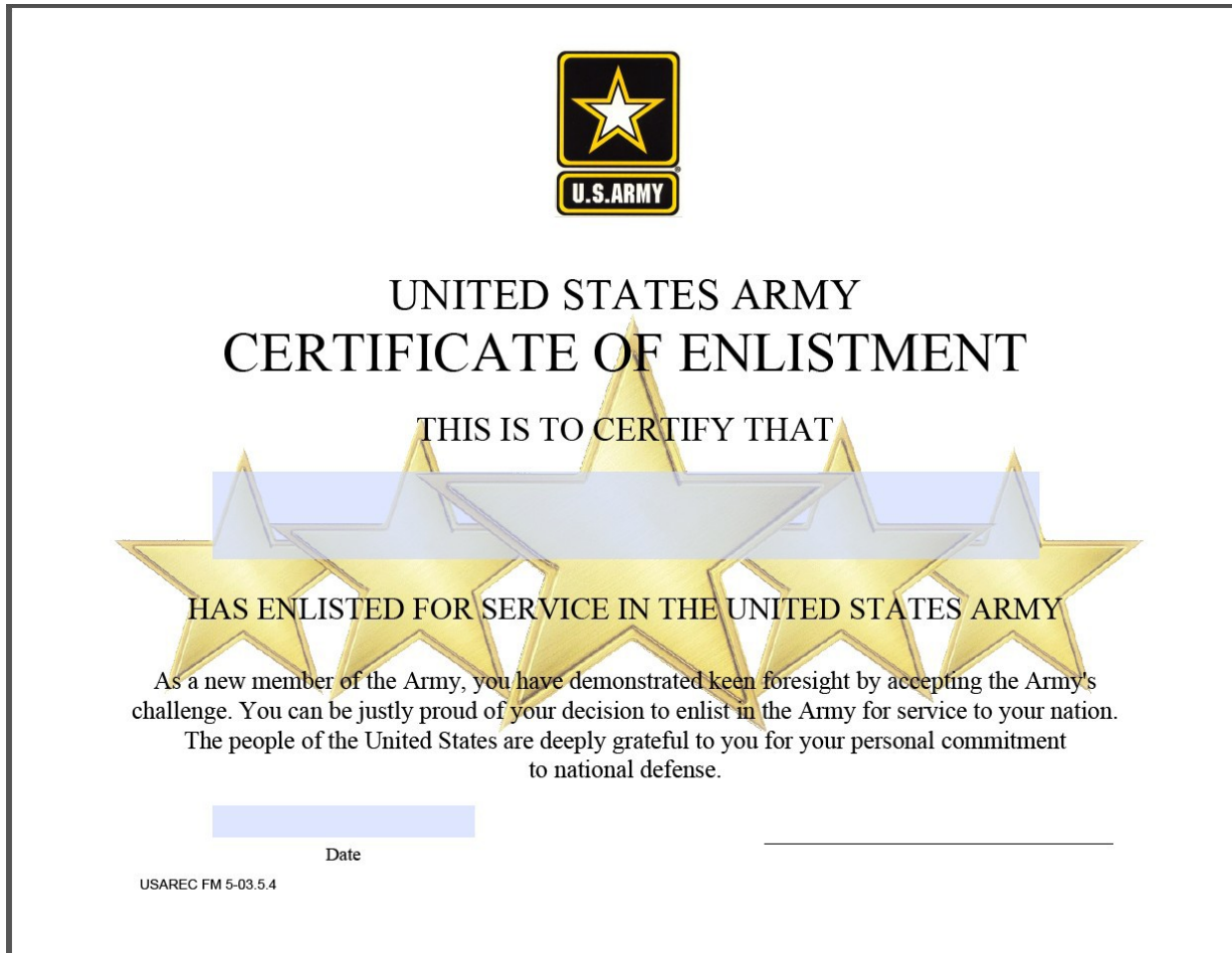
C- 5. Example UF 5-03.5.4- Certificate of Enlistment

C-2. Keep in mind when presenting these certificates that these are the first certificates of the Future Soldier’s career. Present them in a way the Future Soldier and family members will remember and want to display for years. This means that the certificates should be printed in color on marbled or colored cardstock paper. If the station does not have these capabilities, utilize the company or battalion to develop a system to generate certificates worthy of presentation. The UF 589 (old Certificate of Enlistment) may be used until inventory is exhausted by submitting a DA Form 17 to the USAREC G-6 Publications Branch at: usarmy.knox.usarec.mbx.hq-g6-publications@mail.mil .