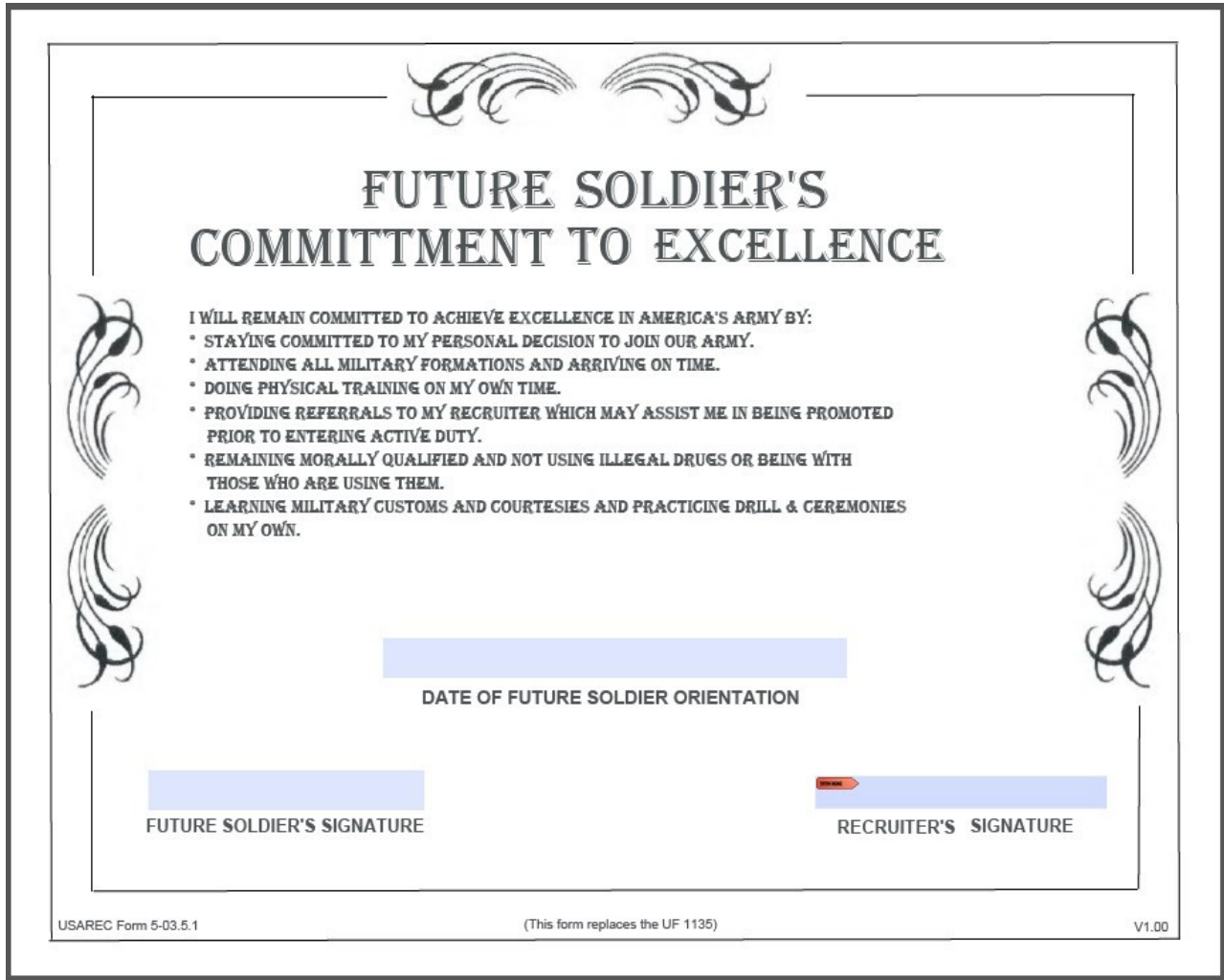
C- 1. Example UF 5-03.5.1-Future Soldier Commitment to Excellence Certificate