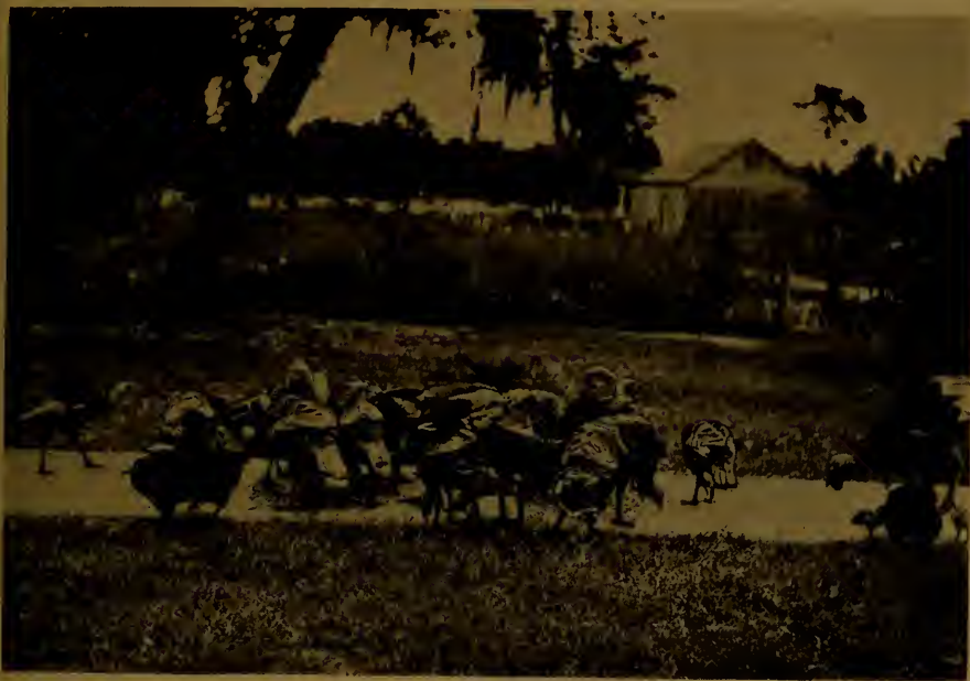
Flock of Turkeys near Indian River City, Brevard County

wheat and scratch-corn. Regardless of the fact that Christmas and Thanksgiving in Florida are snowless, the turkey is the main feature of the dinner menu, and it never fails to command a fancy price. Inasmuch as young turkeys particularly are delicate, Florida's mild winters minimize the risk in raising them to a great extent.