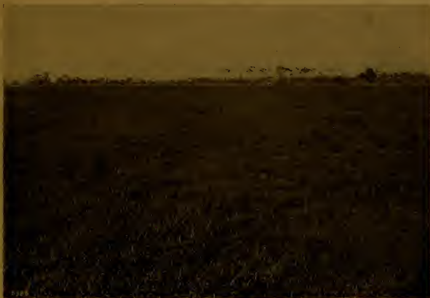
Rhodes Grass Pasture at Fellsmere, St. Lucie County