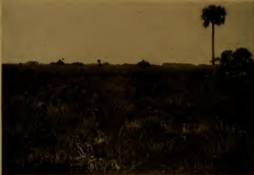
Prairie Land in the Neighborhood of Okeechobee