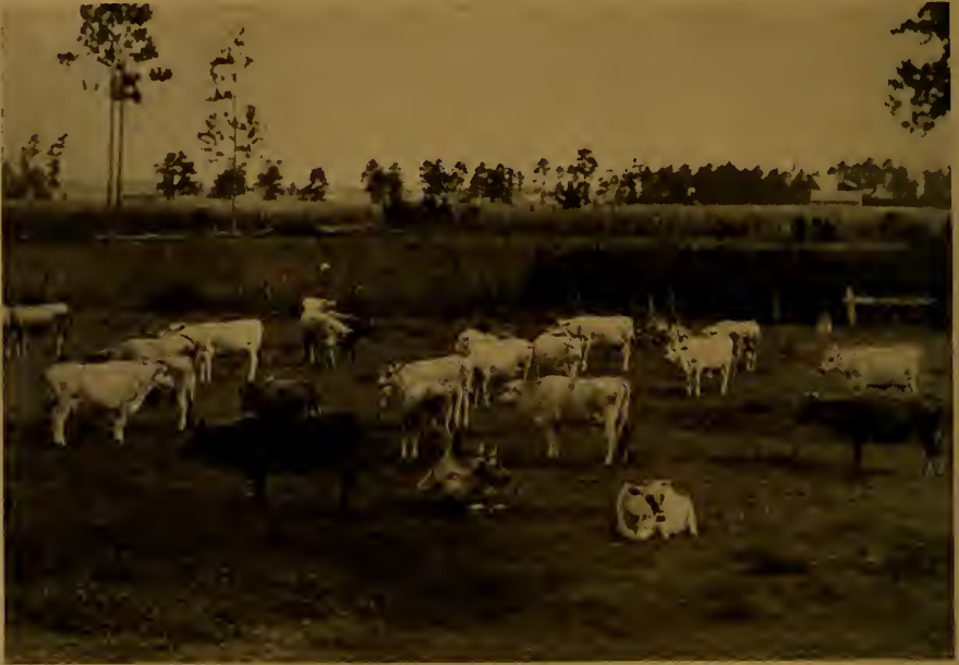
Part of Dairy Herd of Jerseys on Florida Vegetable Company's Dairy Farm near Hastings, St. Johns County