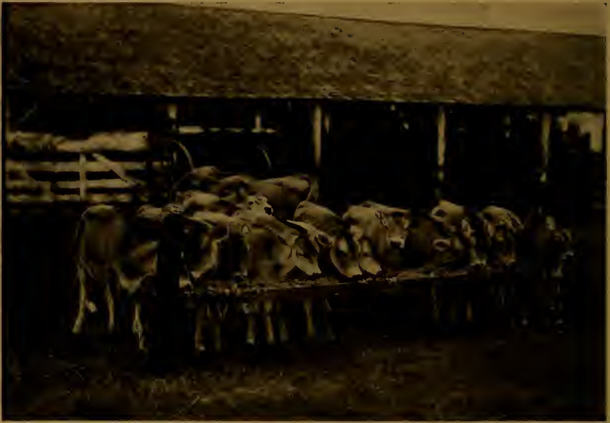
Jersey Calves at Florida Vegetable Company's Dairy Farm, near Hastings, St. Johns County