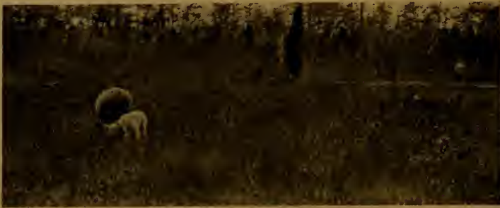
Ewe and Lamb on Pine Land near Tallahassee, Leon County

Compared with hogs, the sheep has an advantage in the wider variety of materials it consumes. Being a ruminant it makes its gain with a minimum of grain and expensive concentrates. Cowpeas, rape, soy beans, vetches, and any number of pasture grasses that thrive in Florida furnish the best of feed for sheep. Not long ago