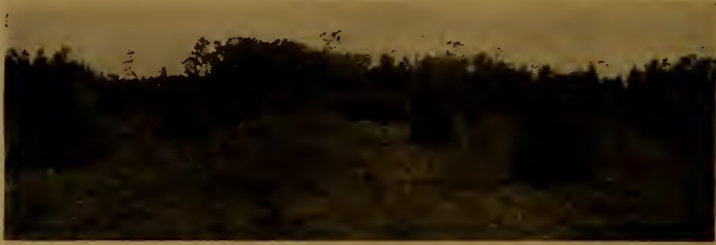
Cowpea Hay in Leon County

“I have tried the pure-bred hog business with the Berkshire, Poland Chinas, Yorkshires and Duroc-Jerseys, and had to admit from ex-