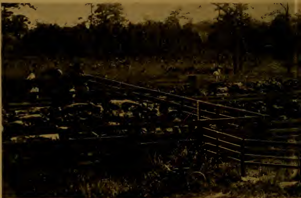
PENS OF NATIVE FLORIDA