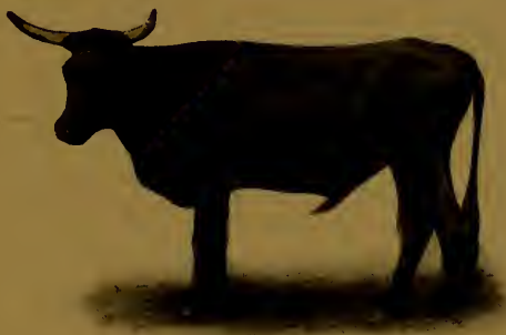
The Native Scrub--The Basis of Successful Livestock Farming in Florida

ALONG THE LINES OF THE FLORIDA EAST COAST RAILWAY