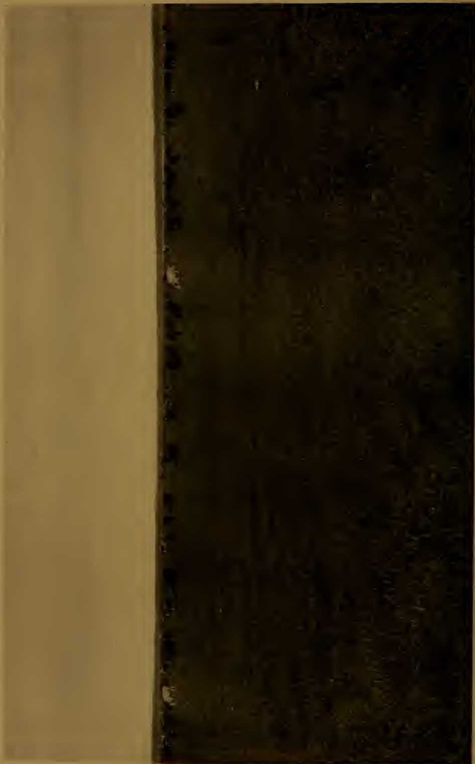
Native Cattle on the Range Northeast of Chuluota, Seminole County