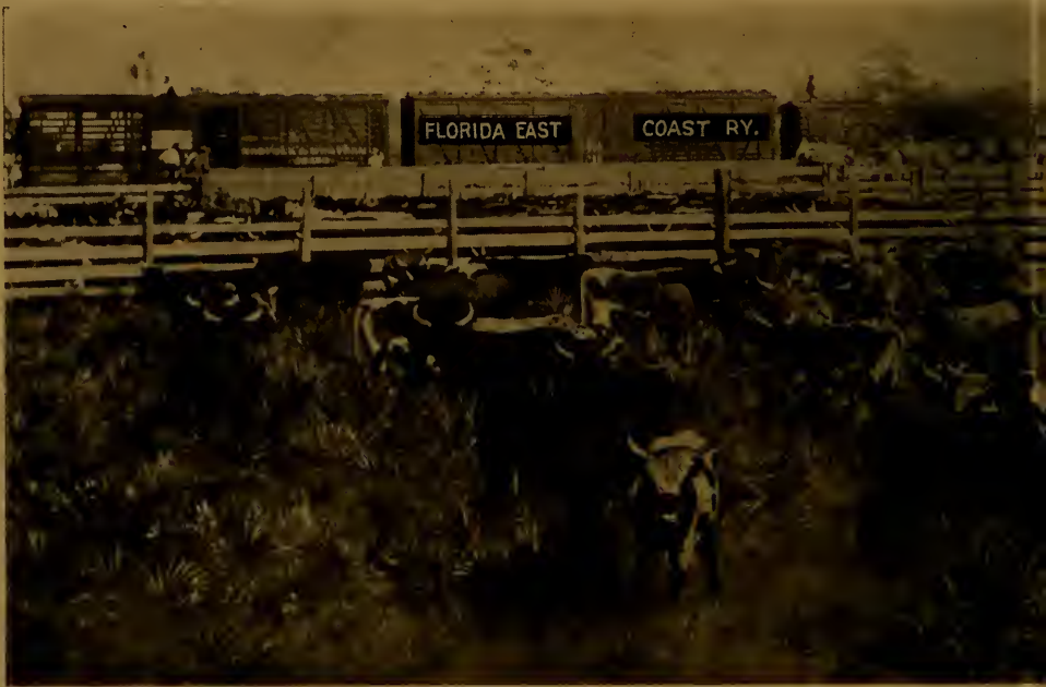
A TRAINLOAD OF SOUTH FLORIDA