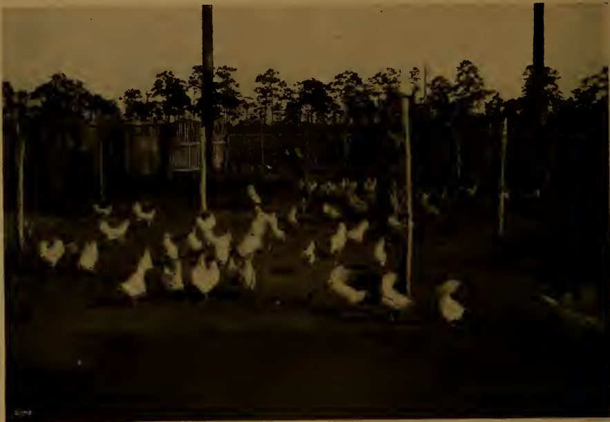
White Leghorns at Fellsmere, St. Lucie County

along, in all of which we have the advantage of our Northern brethren. But we still have another advantage and that is the ability to raise chicks at a time when all the rest of the world sleeps, so to speak.