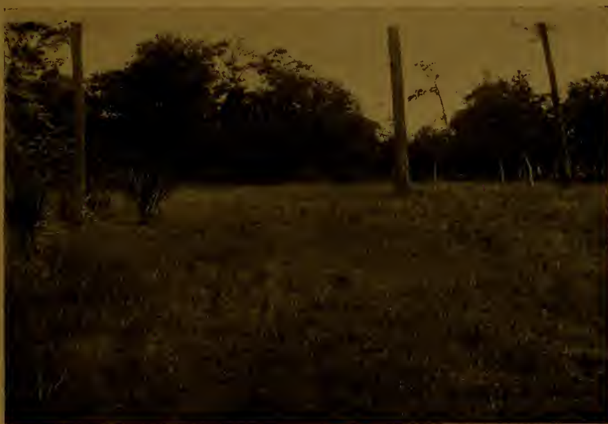
Bermuda Grass at Melbourne, Brevard County

I have now been breeding and fattening cattle in Florida for ten years. I started with the native cow and used Shorthorn bulls. Now I have cattle that would not disgrace the blue grass pastures of Kentucky.