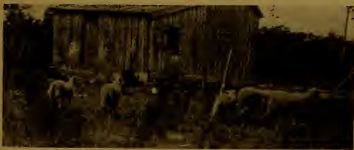
Leon County Ewes and Lambs

points in Florida in this business. One feature which appeals to me in the early lamb business in Florida is that the forage crops most suitable for early lamb raising are at their best in the fall and winter when the ewes and lambs need them most. After the lambs are taken from the ewes, the ewes could be turned loose on the range."