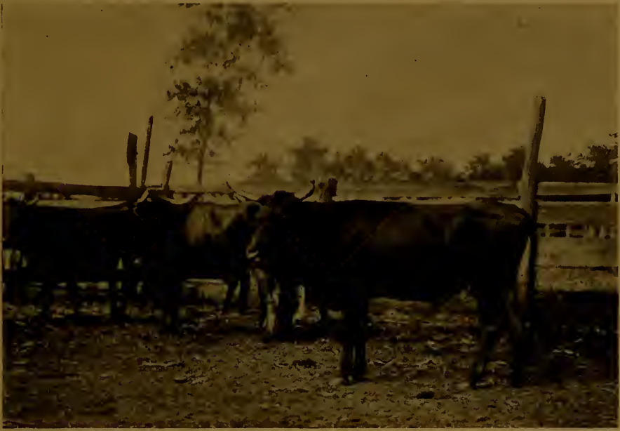
Bunch of Native Three-Year-Old Steers on Hastings Cold Storage Company's Farm, St. Johns County