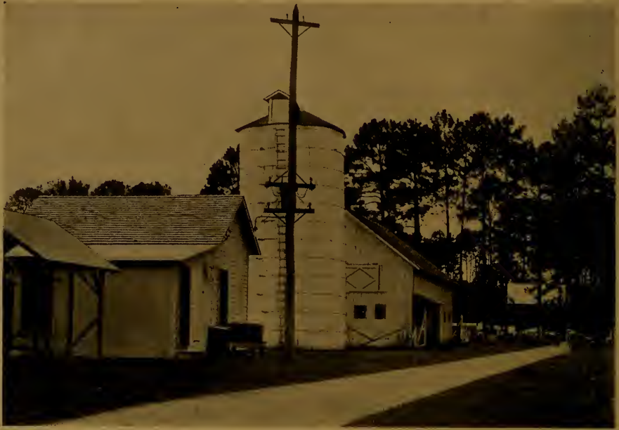
Dairy Plant of Florida Vegetable Company at Hastings, St. Johns County