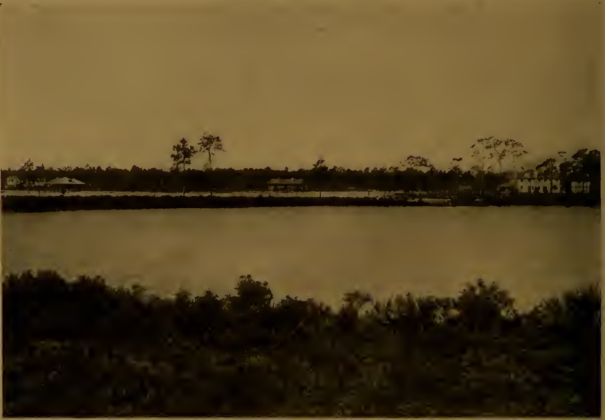
Spring Lake in Chuluota Showing Lake Katherine Beyond, Also Resident Agent's Bungalow, Florida East Coast Railway Station and New Hotel