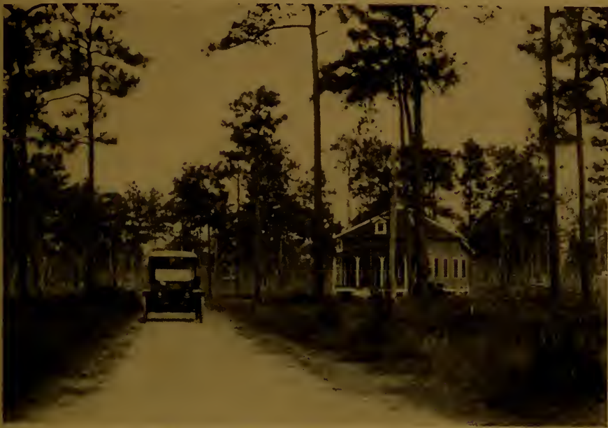
A Hardsurfaced Road Leading Into Chuluota. Railroad Agent's Cottage at the Right