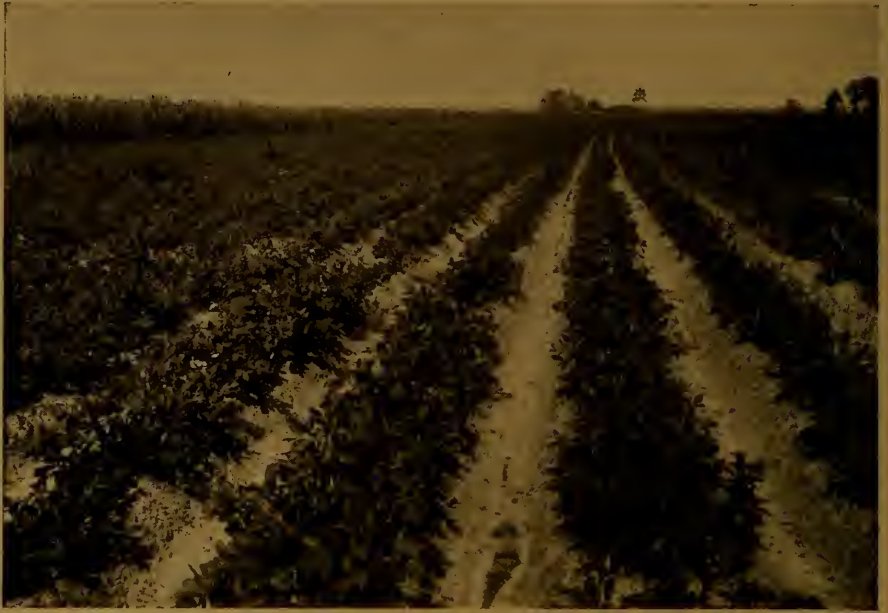
Peanuts With Corn Adjoining Near Hastings, St. Johns County

and cowpeas are cut for silage in August there is ample time for some other crop on the same land ahead of the next January planting of potatoes. At the present time, September, 1914, there are between four and five thousand acres of corn in the Hastings district alone that it is said will yield from forty to fifty bushels per acre—the second crop of the year and grown without fertilizer. The stand of this corn is fine. The ears are of good size and are well filled with large uniform kernels. What is being done in St. Johns county is duplicated in many other counties in the state, especially in the northern half. Putnam, Leon, Seminole, Alachua and Marion counties grow quantities of excellent corn as do also many other counties in Florida.