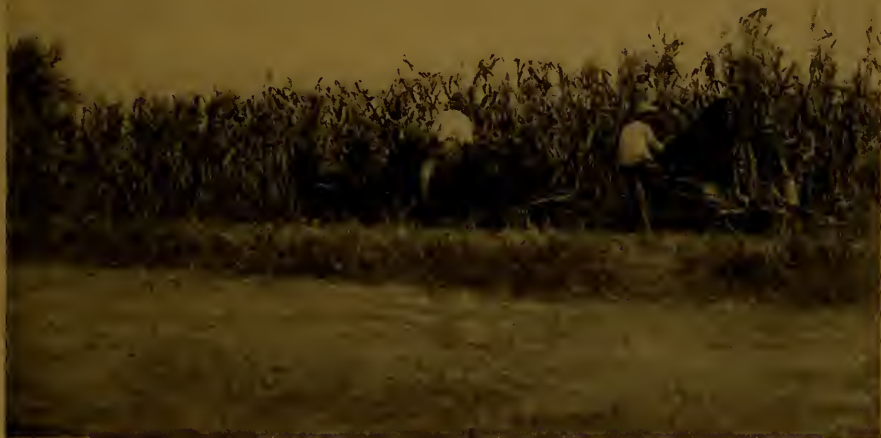
Cutting Corn for Silo on Hastings Cold Storage Company's Farm, St. Johns County

Since that period some portions of the range have been bought by cattle owners and fenced for their own use. In nearly all these cases some attention is now being paid to the introduction of good blood. This feature of the business, however, is practically in its infancy, but wherever tried by the introduction of thoroughbred bulls the shipped cattle have been a decided success. The principal strains introduced are the Hereford and the Aberdeen Angus, or as familiarly called the Black Polled Angus. The latter seem to be the favorite by the majority of those who have tried them and watched the outcome of the experiments. The most noted example of the Black Polled Angus is the herd now owned by the Carson Cattle Company, of Camp Hammock, on Lake Kissimmee. They introduced a carload of this breed of bulls and heifers last fall.