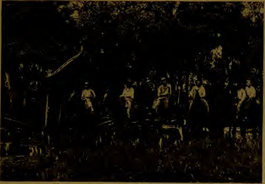
"Cowpunchers" on Tosohatchee Ranch, Seminole County

years. These lands are very fertile, notwithstanding man has interfered to his own injury and by annual fires has burnt up the vegetable matter and prevented the accumulation of humus with its precious content of nitrogen, the expensive ingredient of all fertilizer. Fortunately, fire could not destroy the potash and phosphoric acid, and on the level sandy soil it has not been washed away.