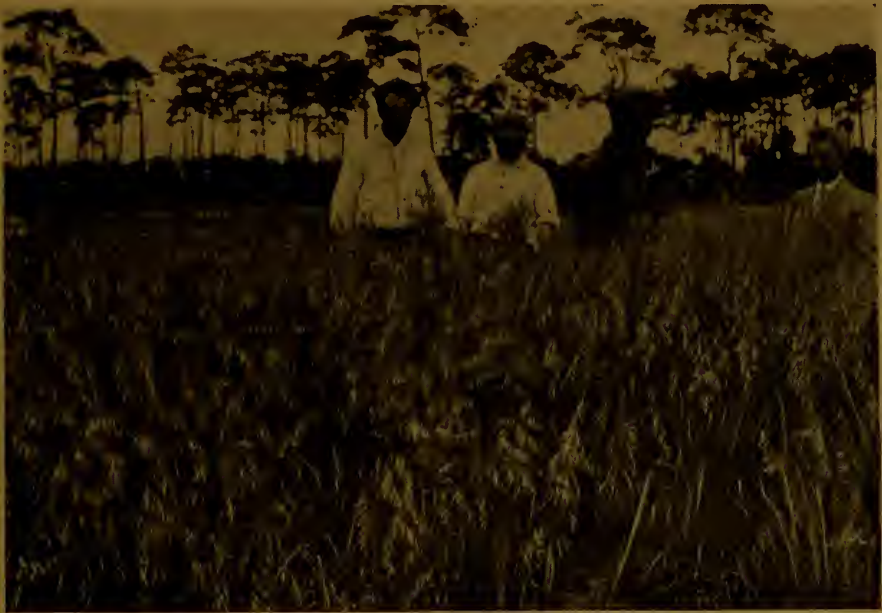
Oats at Vero, St. Lucie County

than from Texas, and I am sure we can grow the animal at as little cost as the Texan can.