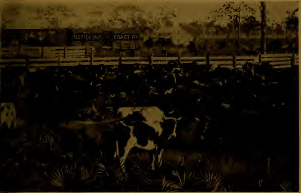
CATTLE FOR KANSAS CITY PACKERS