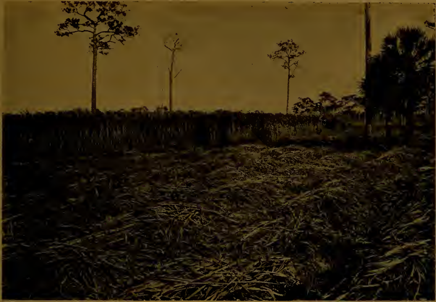
Japanese Cane at Fellsmere, St. Lucie County

I have owned as many as eight thousand to ten thousand head of sheep at a time, and have never found it necessary to dip for scab or to treat for foot rot.