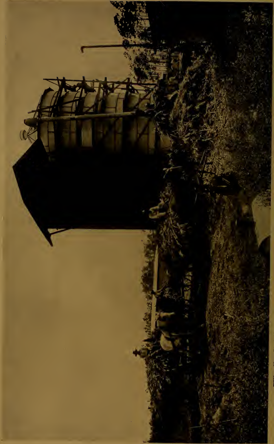
Filling New Steel Silo with Corn Ensilage on Hastings Cold Storage Company's Farm near Hastings, St. Johns County [Scaffolding around the silo was being used by workmen completing its construction]