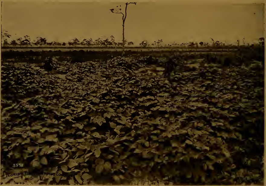
Velvet Beans near Ft. Pierce, St. Lucie County

Sorghum is a good forage crop, but will not produce as heavy a yield per acre as will Japanese cane. It may be planted any time from early in March until August first. The early planting will produce two crops during the year. When planted as late as July, only one crop can be grown. There are quite a number of varieties of sorghum, all of which do well here. The best yielders are Goose-neck, Sumac, and Orange. The Early Amber is good, but the only advantage it has over any of the other varieties is that it matures two or three weeks earlier. Plant in rows three and one-half or four feet apart. One bushel of seed will plant five or six acres.