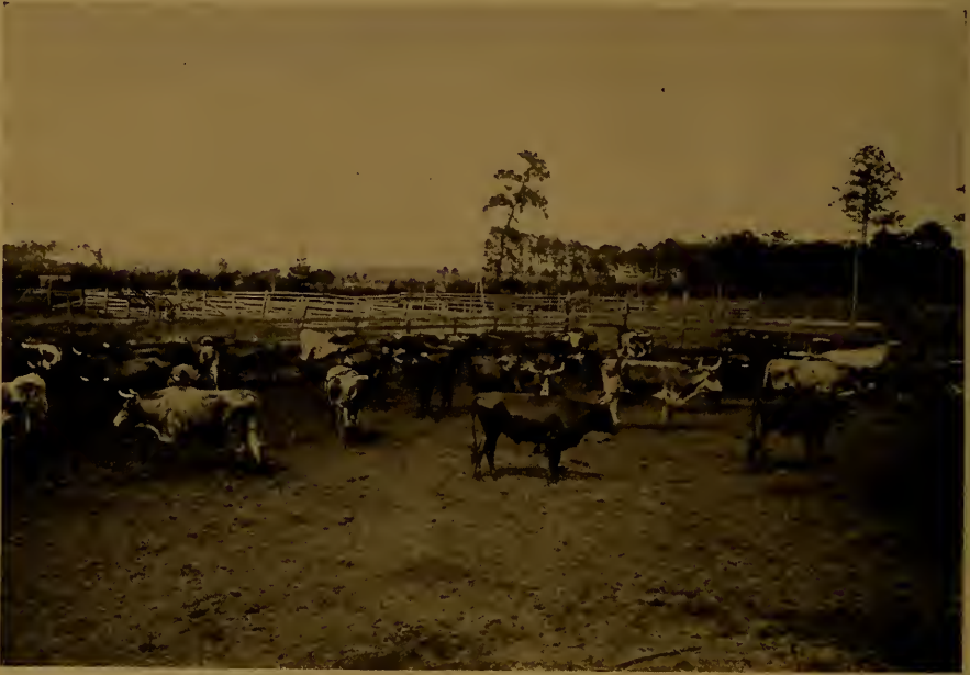
Native Steers in Feeding Pens of Hastings Cold Storage Company, St. Johns County

If the vast area of idle lands in the South, including Florida, were put to these purposes, there would be no necessity for the big meat packers to go to Argentina to produce or purchase their meat supplies for the American people or for export. There is land enough idle in the South, including Florida, to produce livestock to supply not only the people of the United States but all of the export trade that America can control, and in all of this Florida should have a large and important part. In fact, no other Southern state could excel Florida in this respect under intelligent and persistent direction.