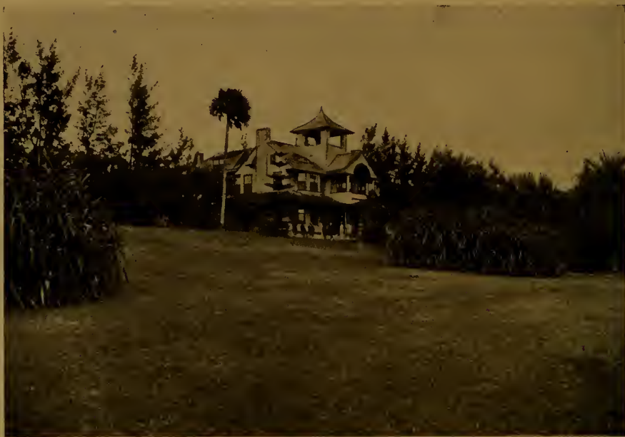
Bermuda Grass Lawn at T. A. Snyder's Home at Hobe Sound, Palm Beach County