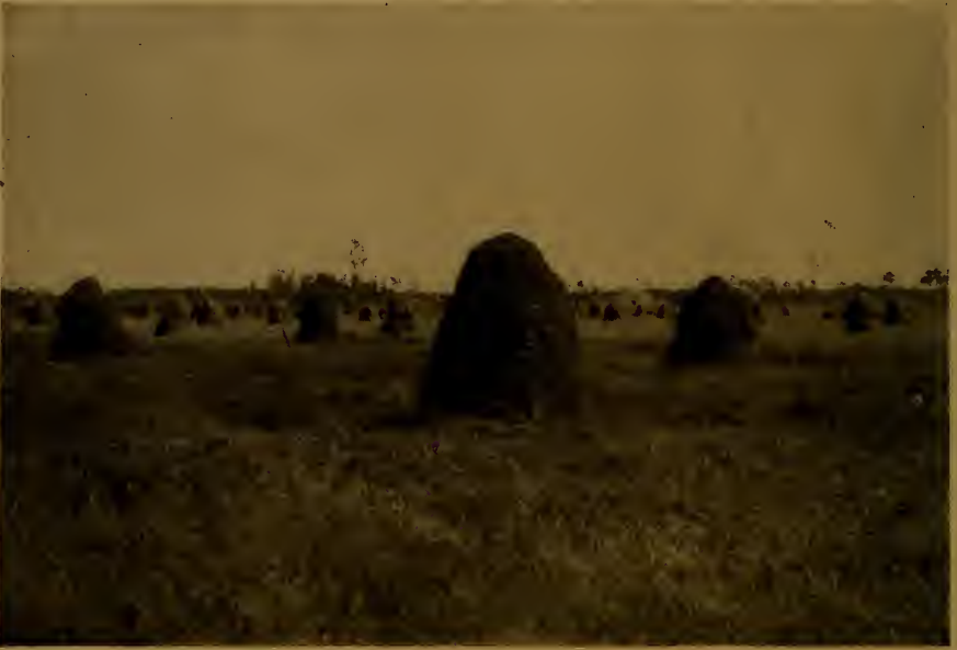
A Good Yield of Crab Grass in St. Johns County