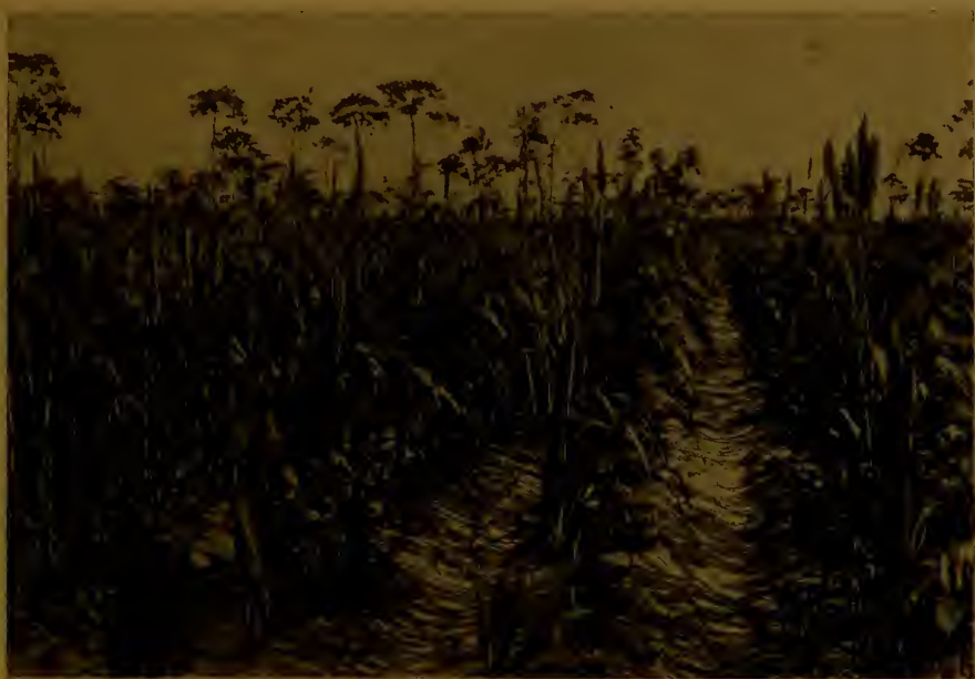
Field of Pearl Millet near Fellsmere, St. Lucie County

otherwise get to bring the bulls out in the spring in strong, vigorous condition, and we should cut out the weak cows and calves and give them a little silage which will make a remarkable difference in their growth.