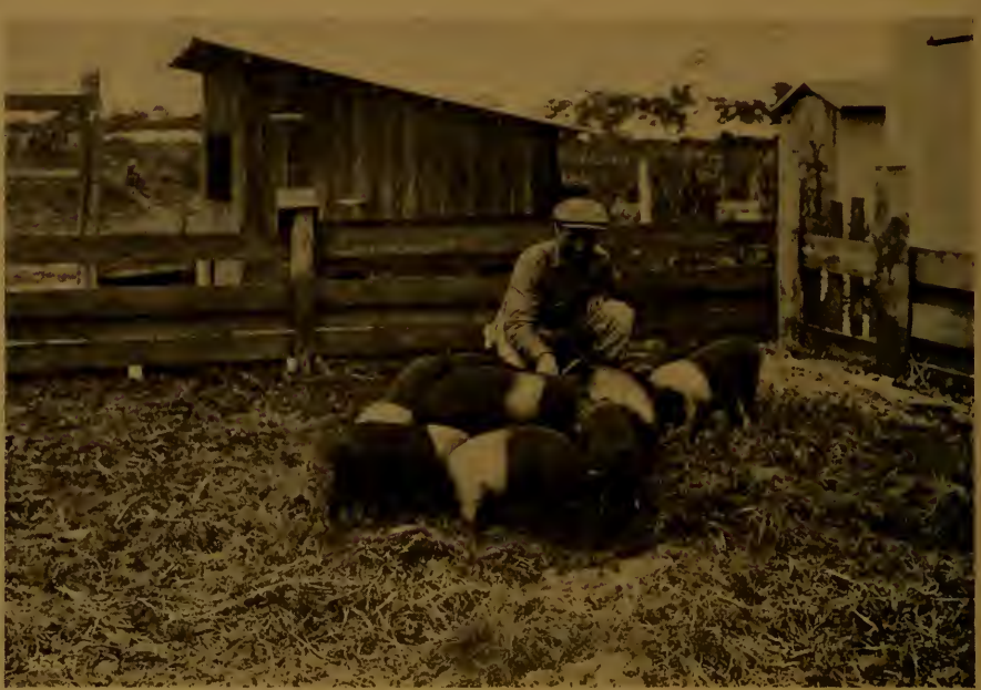
Hampshire Pigs at Vero, St. Lucie County

dance of lime. At the experiment stations in various parts of the country it has been shown that whenever the amount of peanuts in the rations for hogs was increased there has been a noticeable daily gain in the weight of the animals. To feed peanuts without the vines and roots is too expensive to be practicable, a common practice being to turn the hogs into the peanut fields after harvesting and let them get whatever is left. It is not considered good practice to limit feeding for market to peanuts alone, as animals so fed do not yield a desirable quality of meat or lard and it is therefore essential that some grain and other feeds should be included.