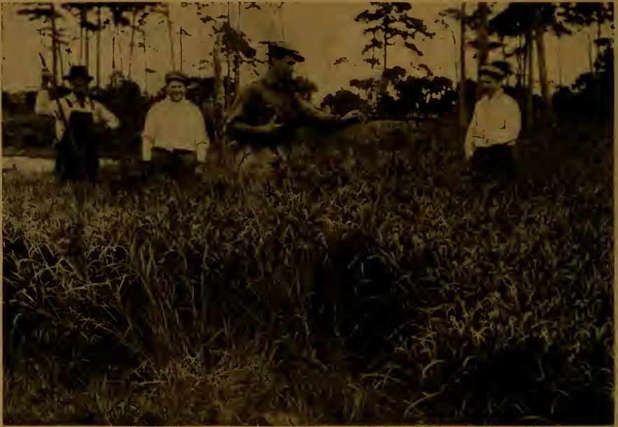
Rhodes Grass Hay near Vero, St. Lucie County

"Of course this was a special test, the ground being well prepared with a liberal application of cow manure, but it is a good example of what this grass will do when forced and properly handled. Ordinarily this grass will produce, according to soil and climate, from five to six tons of hay to the acre, the number of cuttings per annum depending on the condition of the soil.