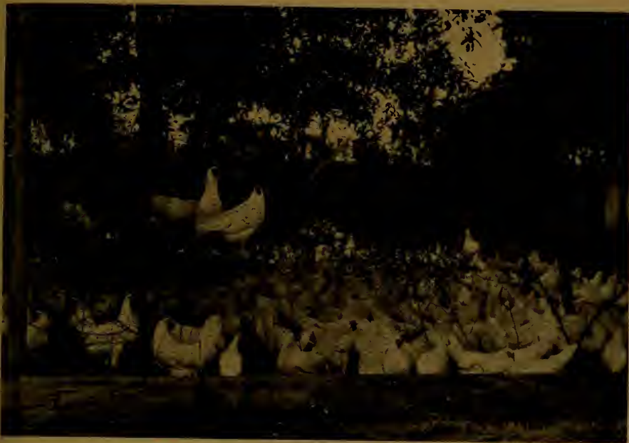
One Thousand White Leghorn Pullets at Crescent Beach Poultry Farm, near St. Augustine, St. Johns County