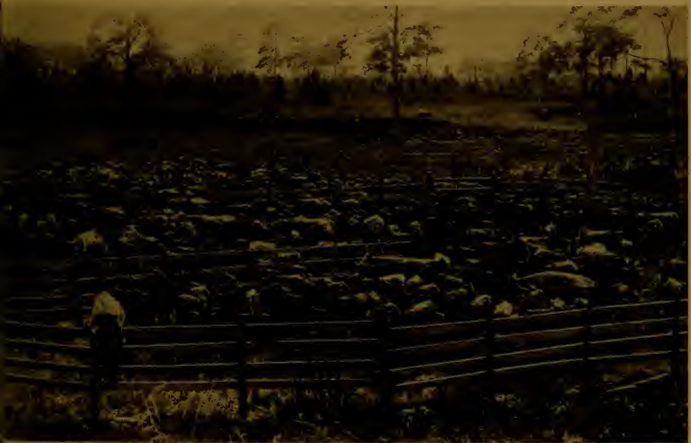
CATTLE FOR NORTHERN MARKETS