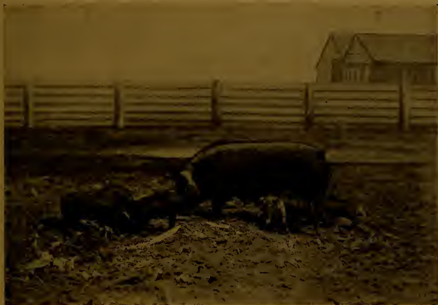
Duroc-Jersey Sow and Pigs near Hastings, St. Johns County