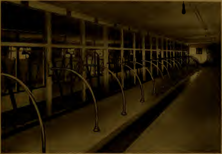
Interior Dairy Barn of Florida Vegetable Company near Hastings, St. Johns County

dance in Japanese cane, sweet potatoes, cassava and others. There are any number of other feed crops and pasture grasses in addition to corn silage that can be produced in quantities in nearly all parts of the state.