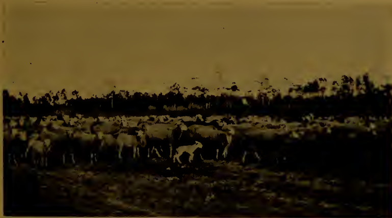
Flock of Sheep in Volusia County

IT is not necessary to look up statistics to be convinced of the fact that the consumption of mutton per capita, in the United States, is steadily increasing every year and it is also true that the demand for wool will increase more rapidly from year to year than it is produced. It follows, therefore, that the business of sheep raising under proper management should be profitable wherever it is adapted to climate and feed crops and is afforded an accessible market. Florida possesses these requirements. In fact, she has sufficient resources to produce hundreds of thousands of dollars' worth of mutton and wool profitably. This is the opinion of experienced sheep raisers, who are meeting with good success in the business in this state at the present time, as well as some of the foremost authorities on the subject outside of Florida.