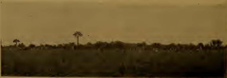
An Ideal Range in Central Florida