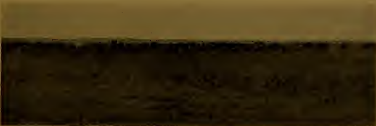
On the Range in Seminole County