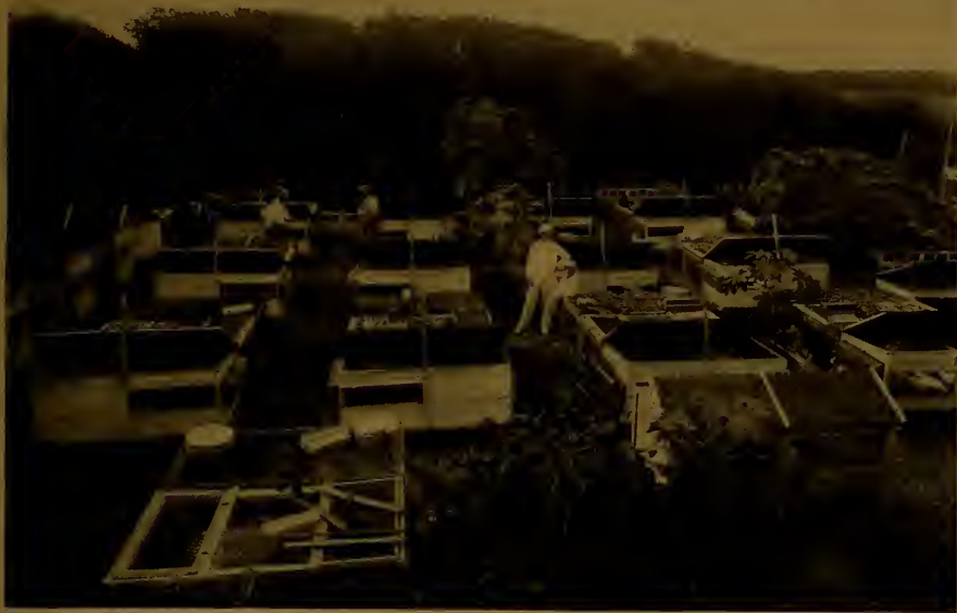
Breeding Pens at Crescent Beach Poultry Farm, St. Johns County

the strongest vitality possible in the germ, which in turn produces strong, healthy chicks that grow off into fine robust specimens; thus insuring the health of the breeders. This green food should be one-half of a chick's diet and can be supplied in the form of collards, cabbage, lettuce, celery tops, rape, rutabaga, etc., and can be grown at a very minimum of expense. Green food not only furnishes nourishment but bulk also, which is essential to a chick and helps to keep down the grain bill; hence the cost of production in the feeding end of the game is no more, or even less than the cost of feeding chicks where the grain grows.