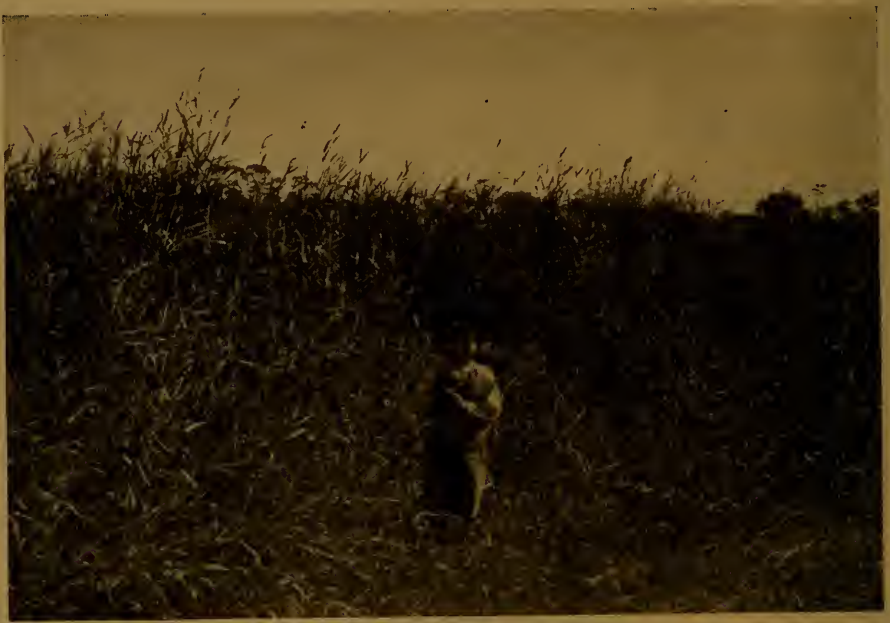
Para Grass at Vero, St. Lucie County