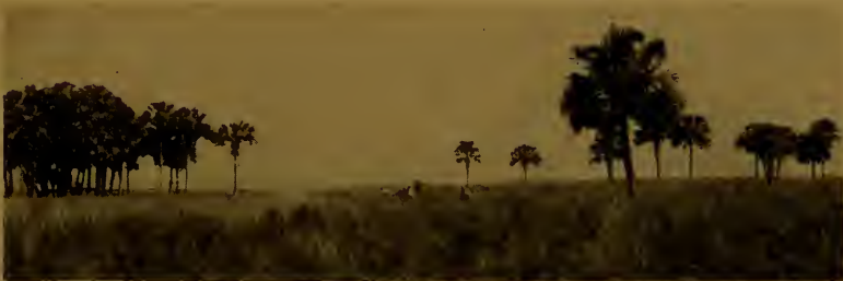
Native Florida Grass

To give the reader the present status of this branch of farming, we give on the following pages the number of animals on hand in each county traversed by the Florida East Coast Railway, on