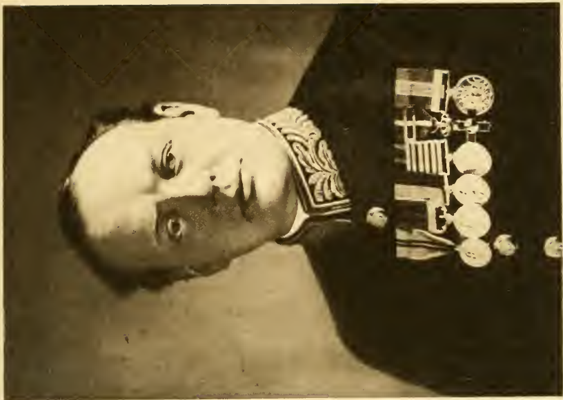
THE RT. HON. H.H. ASQUITH.