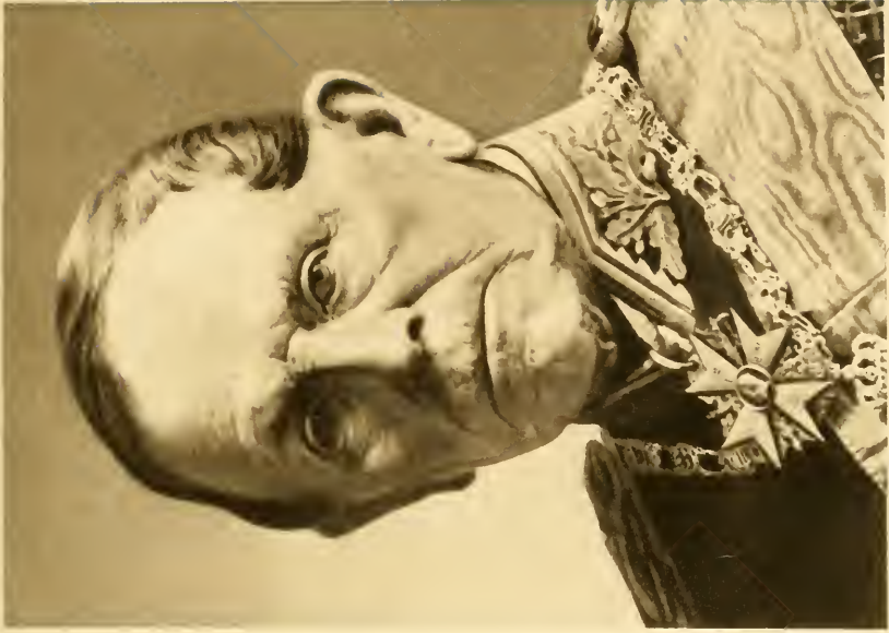
COUNT VON MOLTKE.