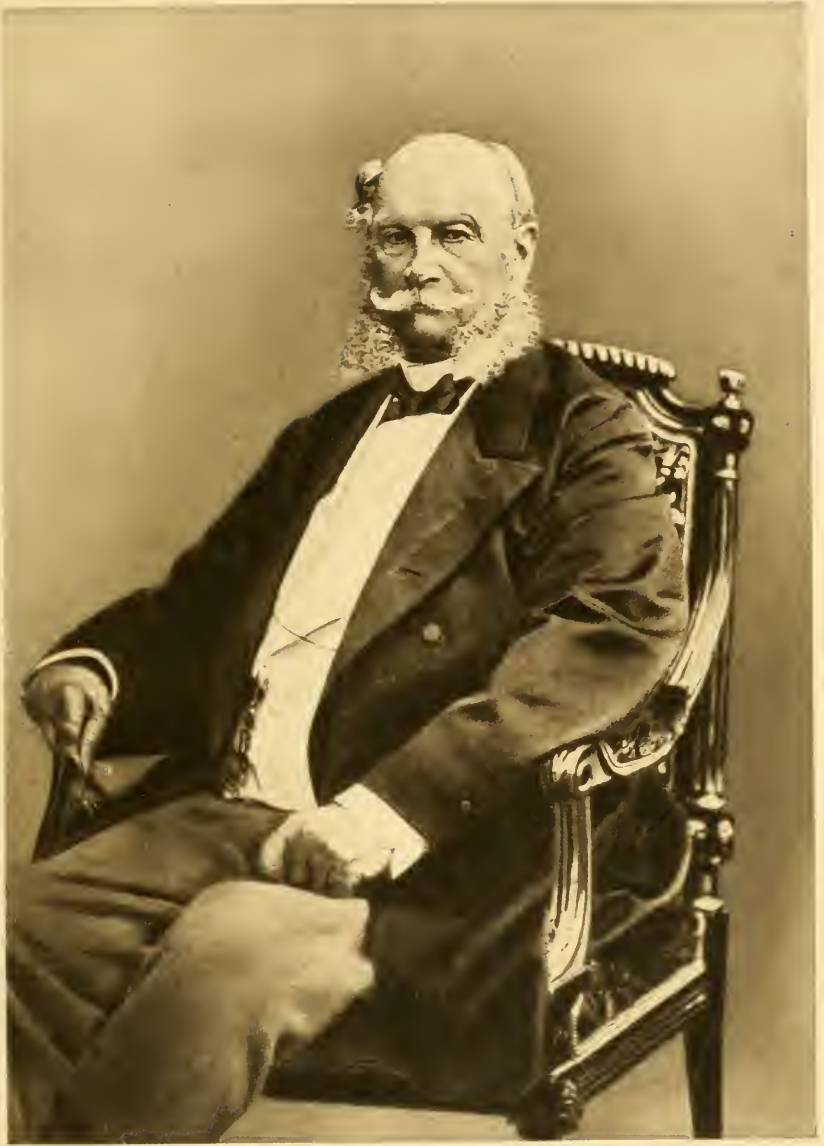
EMPEROR WILLIAM I OF PRUSSIA