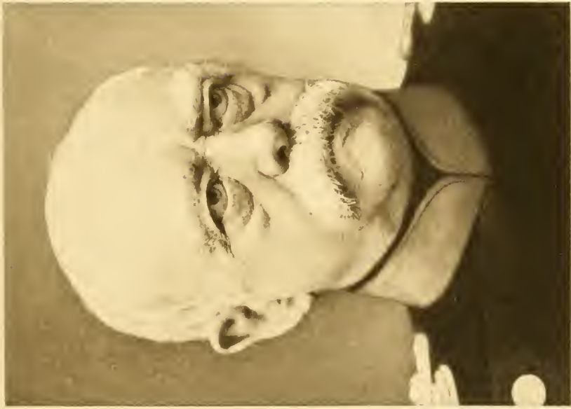
PRINCE VON BISMARCK.