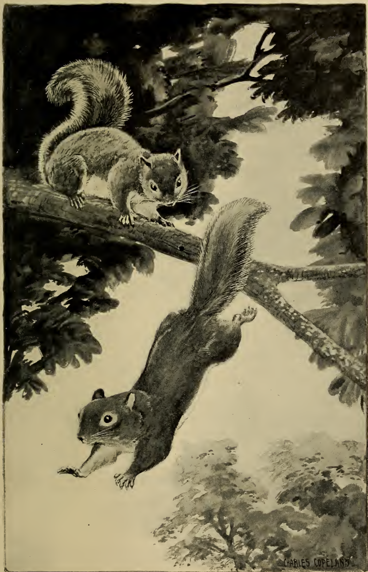
FRISK AND FROLIC.