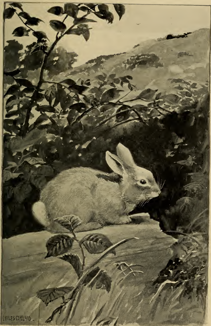
HE WOULD SIT FOR AN HOUR AT A TIME ON AN OLD LOG.