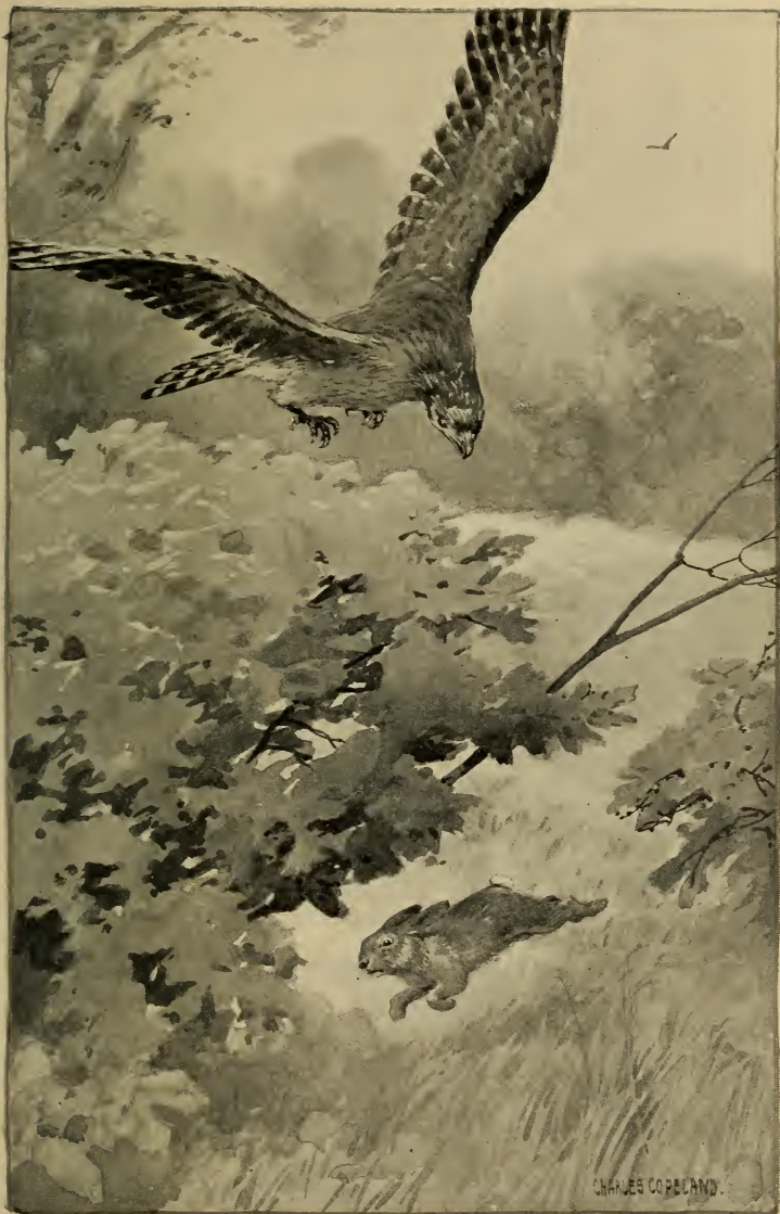
BOB SPRANG FROM POINT TO POINT.