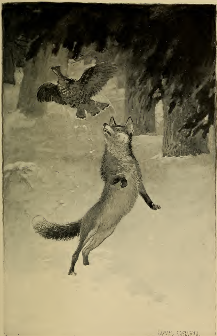
THE PARTRIDGE BROKE AWAY AND WHIRRED OVER THE TREE-TOPS.