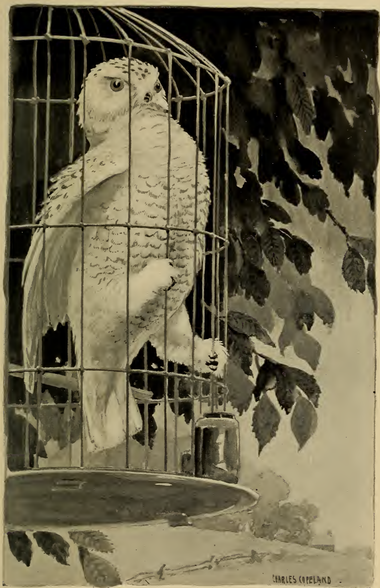
HE CLUTCHED THE BARS FIERCELY WITH HIS CLAWS.