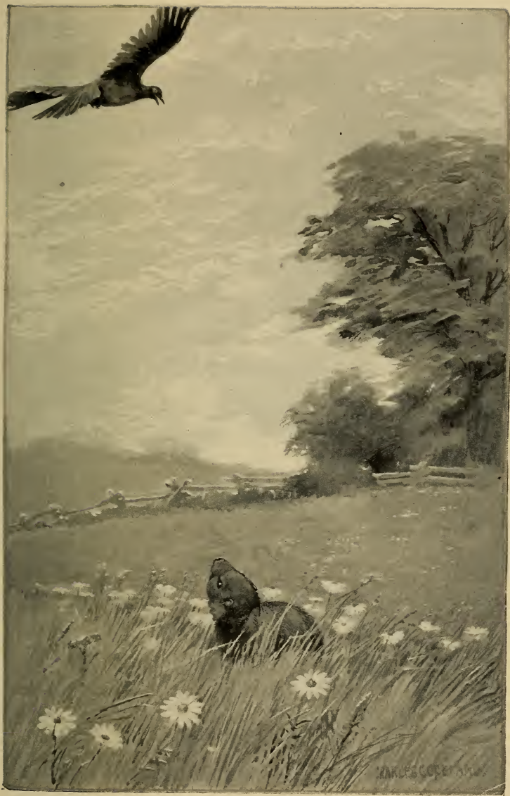
"CAW, CAW," CRIED NIMROD.