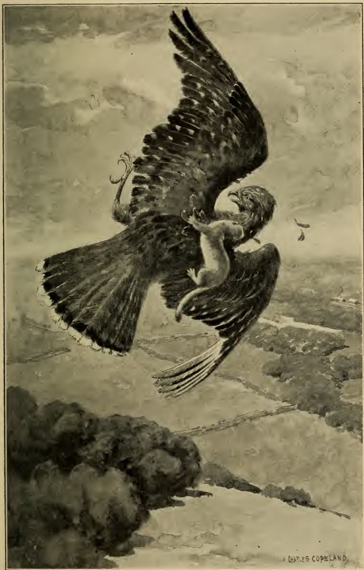
WITH A WILD SCREAM THE HAWK ROSE SWIFTLY IN THE AIR.