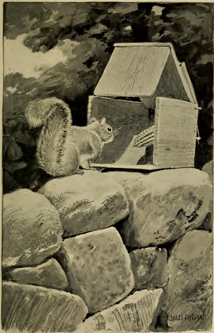
WHAT A CUTE LITTLE HOUSE IT WAS.