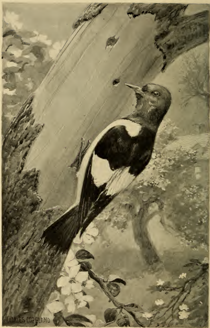
THE POUNDING CAME FROM AN OLD APPLE-TREE.