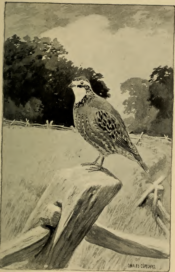
THE QUAIL IS A MERRY FELLOW.