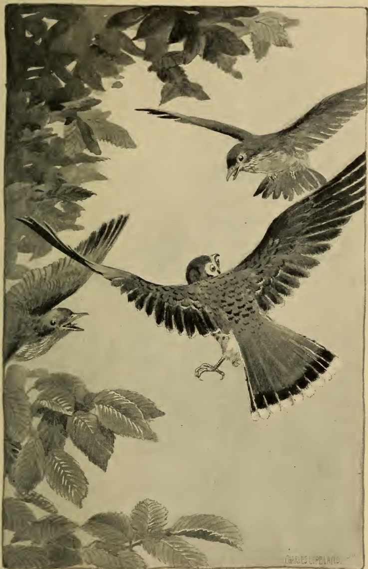
COCK-ROBIN AND BROWNIE FOUGHT BRAVELY.