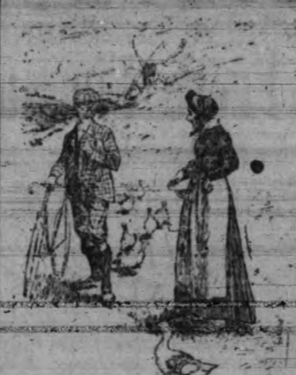
"Arry—Good morning, Mother Goose!" "Arry—Good morning, my son!" Punch.

AMERICANS AND CHINESE. The Geary exclusion law, which absolutely prohibits the entrance of Chinese into the United States, expires by limitation in May next.