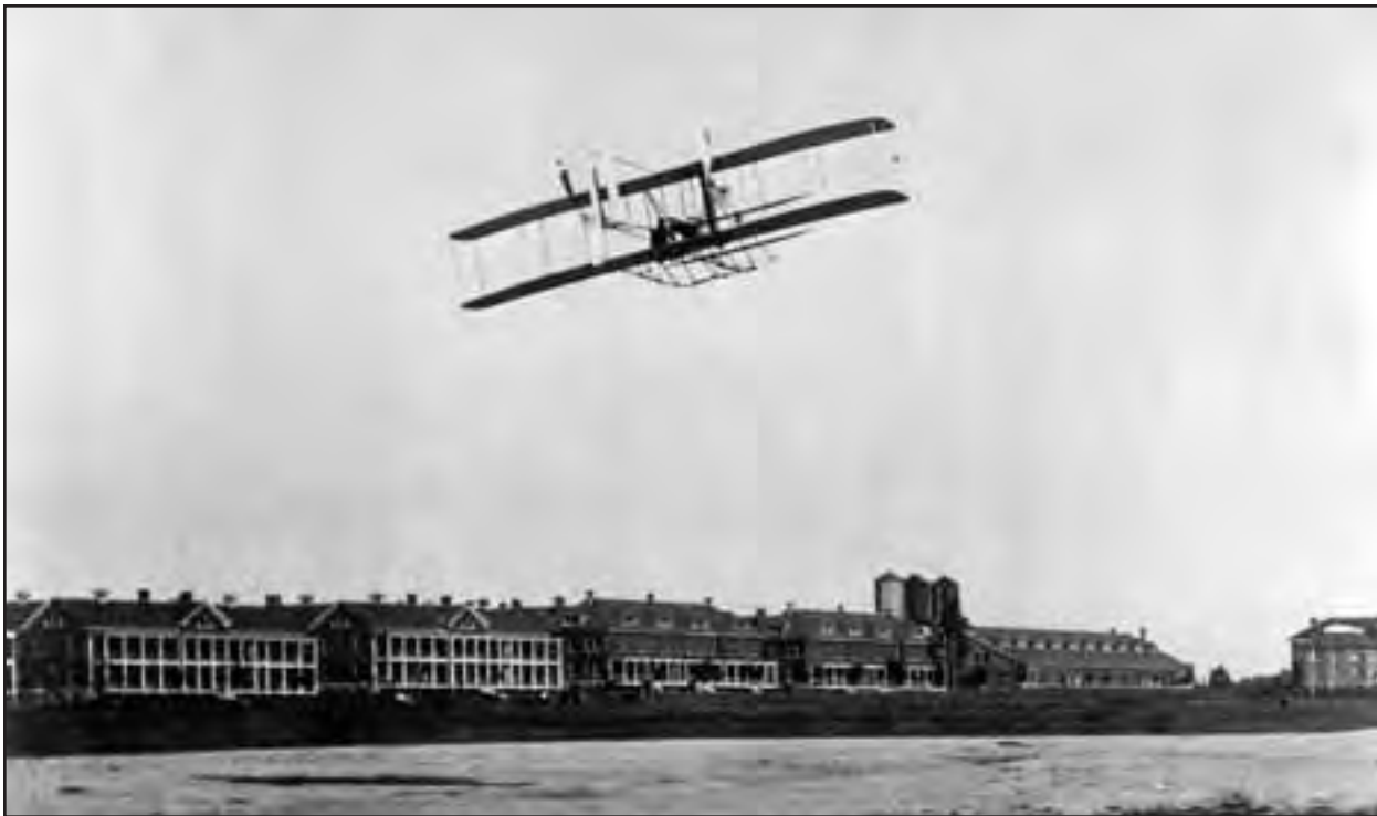
The Wrights at Fort Myer, Virginia, on 3 September 1908.

Tom D. Crouch Senior Curator, Aeronautics National Air and Space Museum Smithsonian Institution June 6, 2002