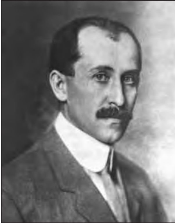
Orville Wright (August 19, 1871 January 30, 1948).