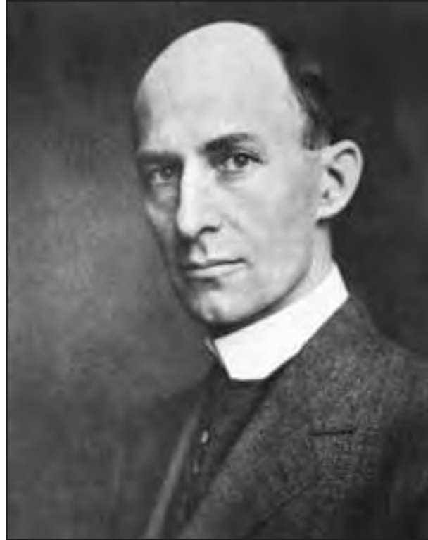
Wilbur Wright (April 16, 1867 May 30, 1912).