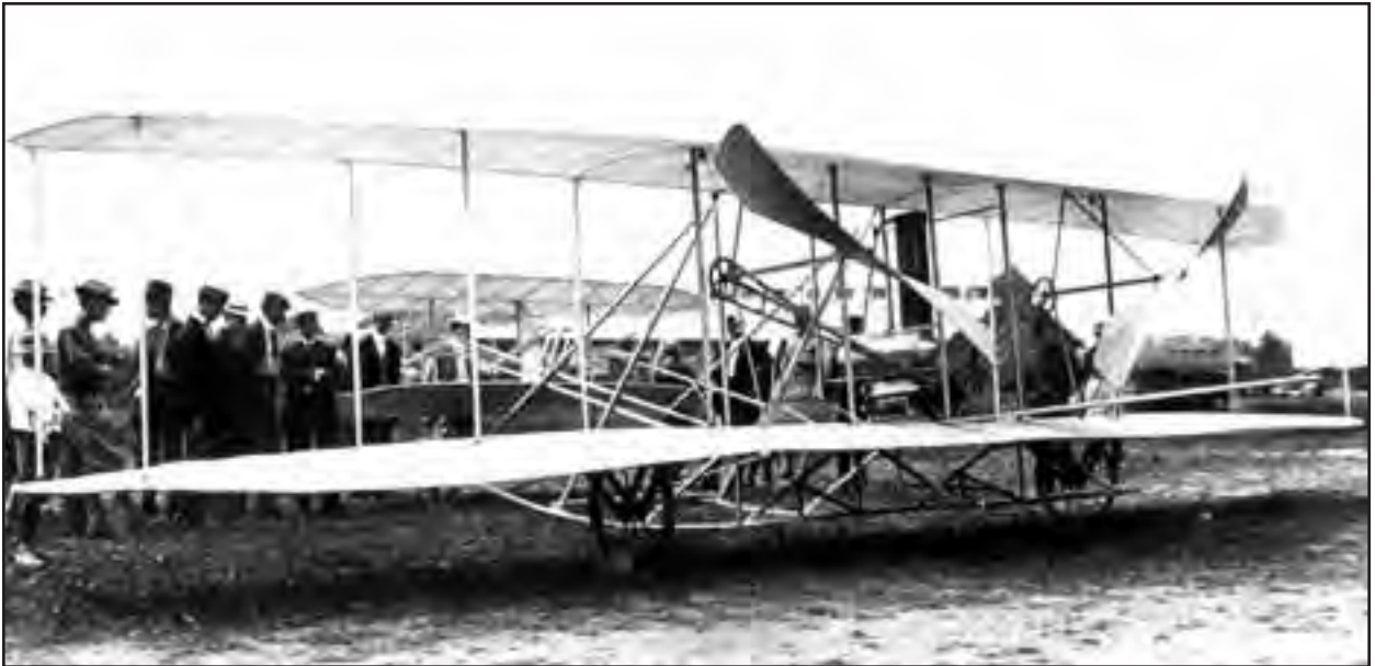
A Wright aeroplane at Fort Myer on 3 September 1908.

Included also in 1932 edition with title, Famous Flyers and Their Famous Flights.