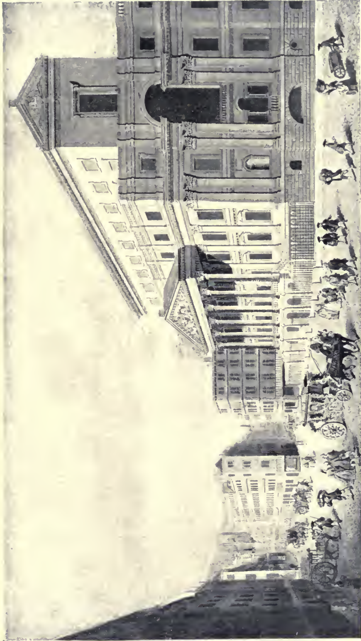
THE MANSION HOUSE OF WHICH THE FOUNDATION-STONE WAS LAID BY MICAJAH PERRY.