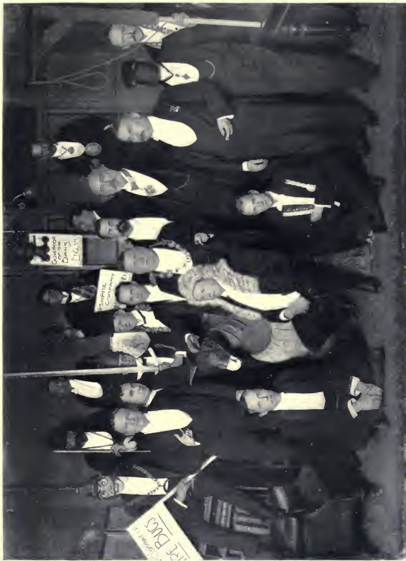
A FLEET STREET REVEL AT THE PRESS CLUB WITH VISCOUNT BURNHAM AND SIR W. H. DUNN ON SATURDAY, FEBRUARY 9, 1907.