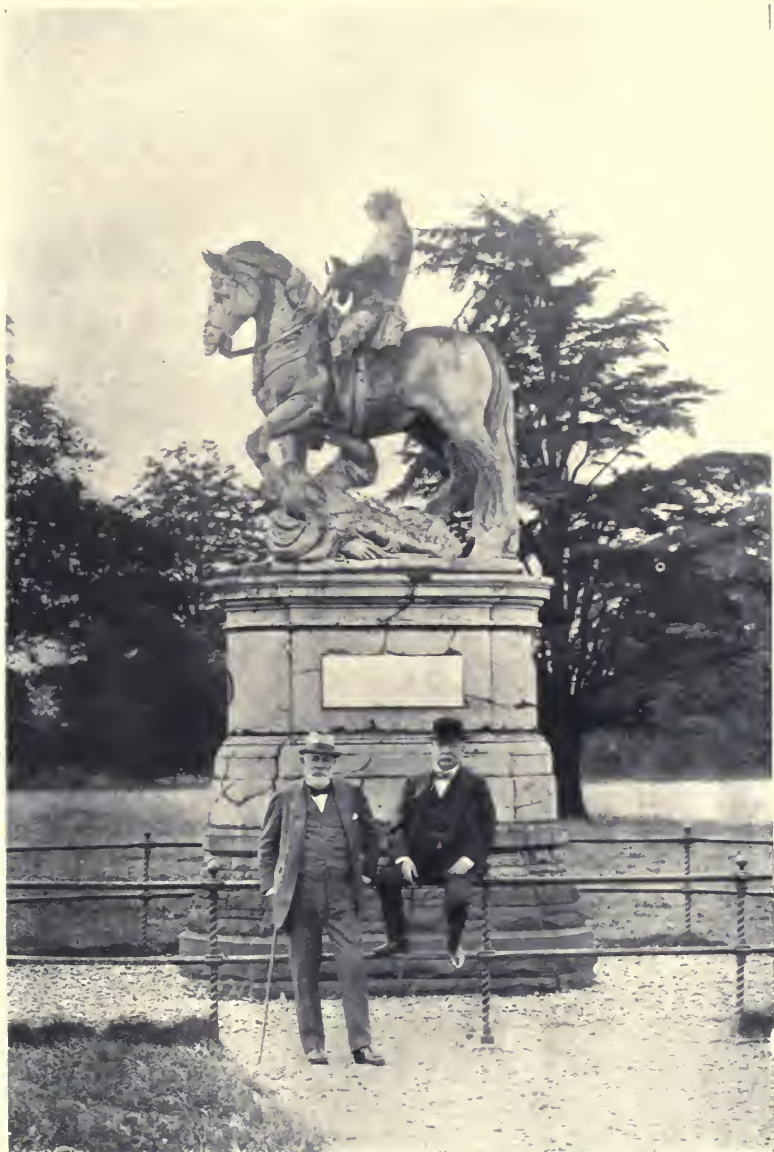
THE STATUE AT NEWBY HALL, RIPON.

This statue stood on the site of the Mansion House in 1737.