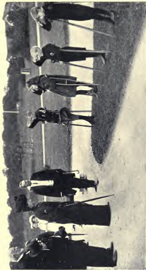
VISIT OF QUEEN ALEXANDRA TO ALTON IN JULY, 1912.