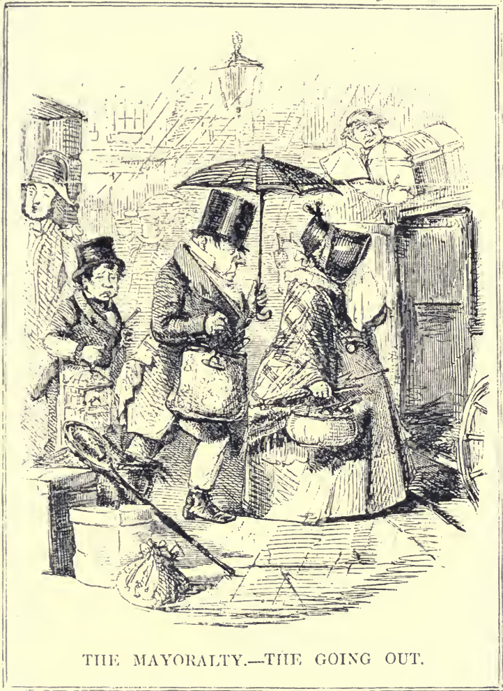
THE MAYORALTY.—THE GOING OUT.

“OH, WHAT A FALL WAS THERE, MY COUNTRYMEN.”