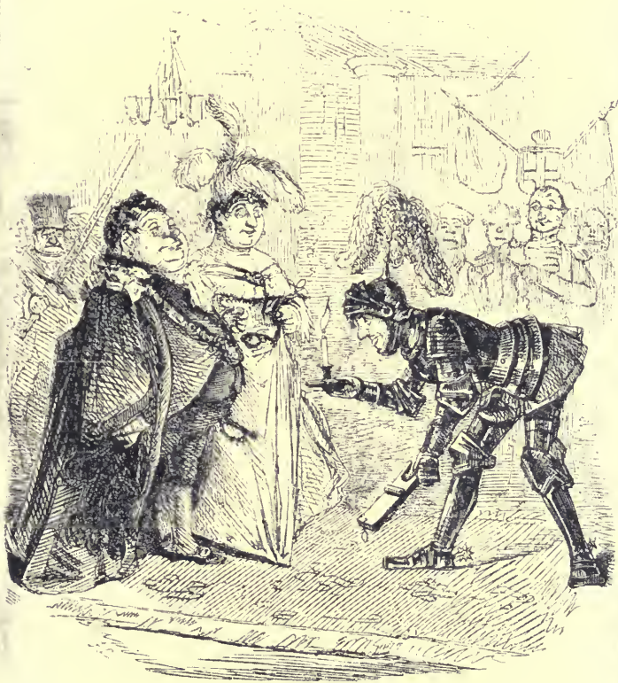
THE MAYORALTY.—THE COMING IN.