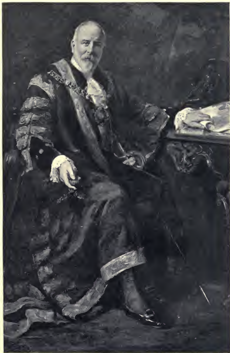
THE LORD MAYOR, 1906-7.