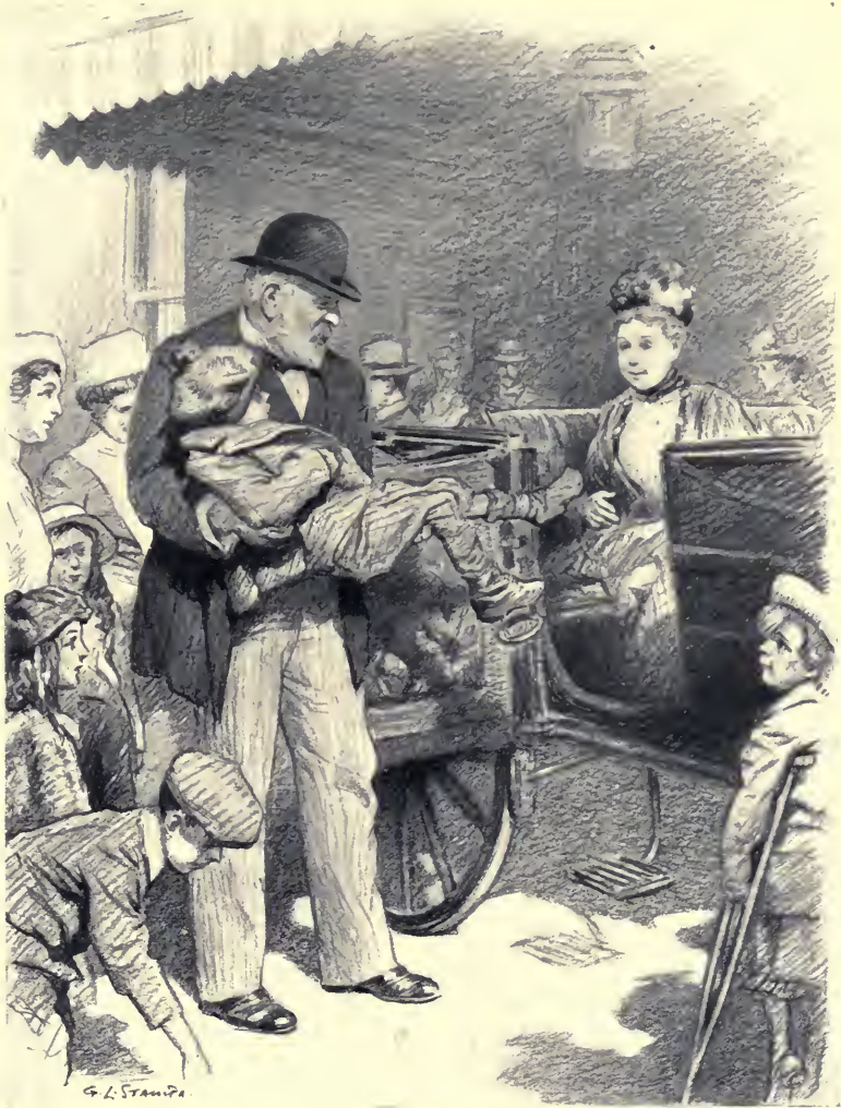
SIR WILLIAM AND LADY TRELOAR RECEIVING THE FIRST LITTLE PATIENTS AT THE RAILWAY-STATION, ALTON, SEPTEMBER 8, 1903.