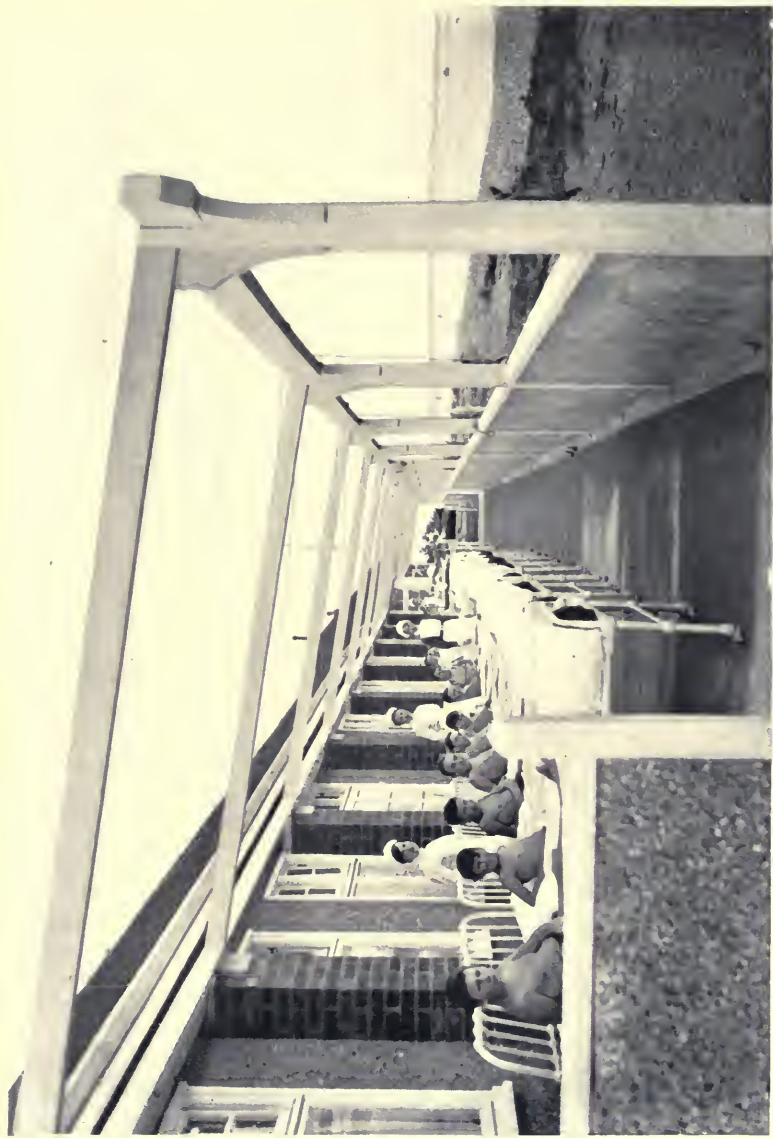
THE FIRST LITTLE PATIENTS, SEPTEMBER, 1919, AT THE PAVILION AT SANDY POINT, HAYLING ISLAND.