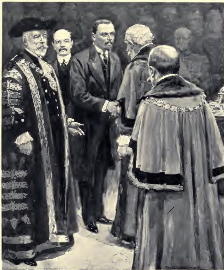
COLONIAL PREMIERS AT GUILDHALL, APRIL 16, 1907: GENERAL BOTHA AND DR. JAMESON INTRODUCED TO THE ALDERMEN.