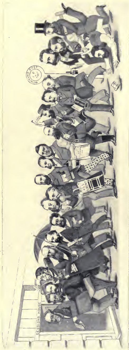
ST. THOMAS'S DAY ELECTION, DECEMBER 21, 1881, FARRINGTON WITHOUT WARD: "THE FARRINGTON DERBY."