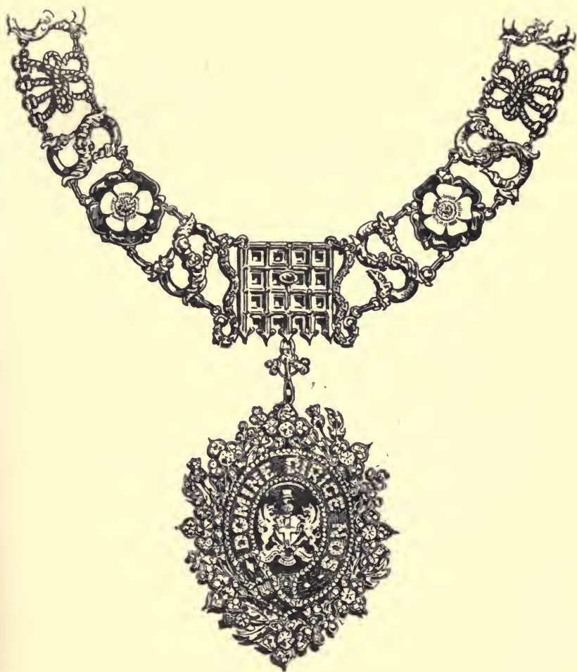
THE JEWEL AND CHAIN OF OFFICE.