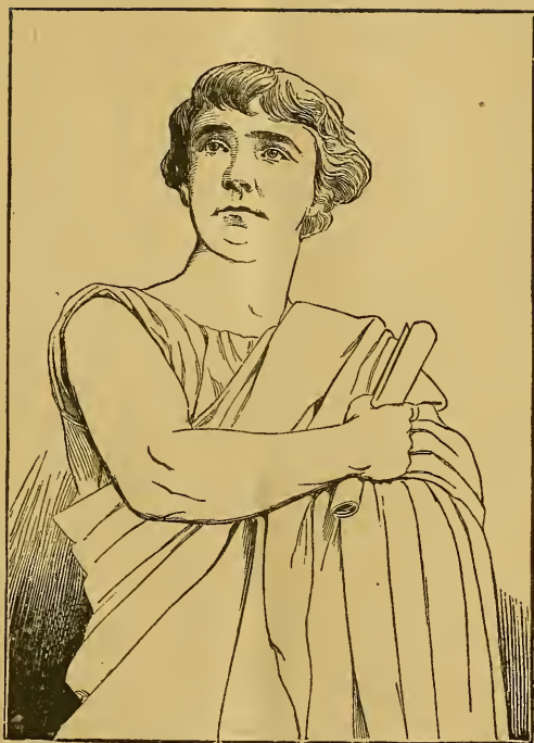
Mr. Kyrle Bellew as "Marc Antony."