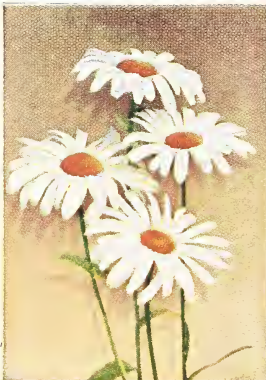
Shasta Daisy, Alaska.

These 59 Fall Plants—Postpaid, only ..... $3.98