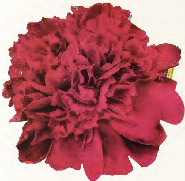
Peony, Karl Rosenfield.