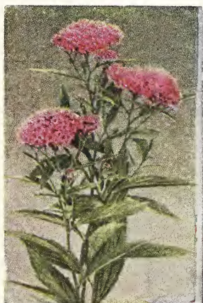
Spirea Anthony Waterer.

Exactly like the pink variety, except that the flowers are bright red. 2-yr., field-grown plants, 40c each; 10 for $3.50.