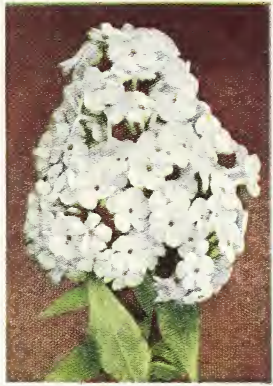
Phlox, Mrs. Jenkins.