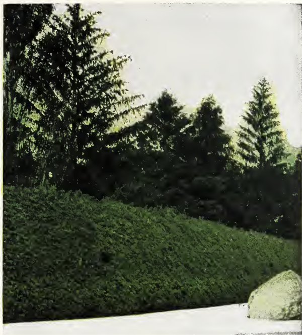
NORWAY SPRUCE HEDGE.

The above cut was made from a photograph taken on the Campus of University of Ohio, showing Norway Spruce hedge trimmed to 6 feet high, and 40-foot Norway Spruce in the background, all the same age. The Norway Spruce is a wonderful tree wherever planted.