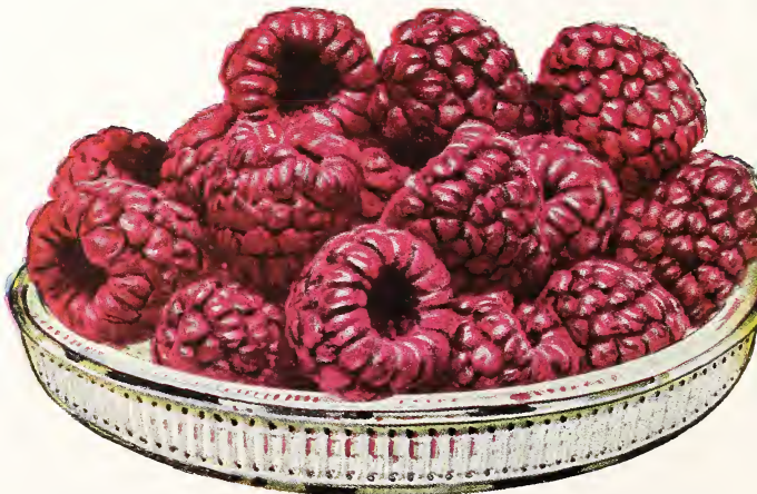
Early King Raspberries.