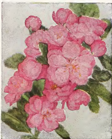
Bechtel's Flowering Crab.

DEUTZIA, PRIDE OF ROCHESTER. Medium in height, and has lovely double white flowers in June. Semi-hardy. 2-yr., transplanted, 50c each; 10 for $4.00.