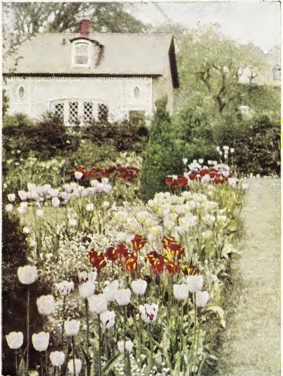
Darwin Tulips and Lily-of-the-Valley in Border Planting.