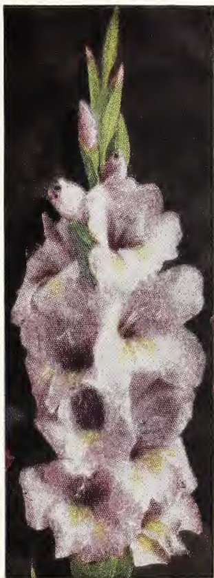
Gladiolus, Le Marechal Foch.

ORANGE AND YELLOW. Choice of Schwaben, Alice Tiplady, and Butterboy. 15c each; 10 for $1.00; 25 for $2.00.