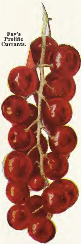
Fay's Prolific Currants.