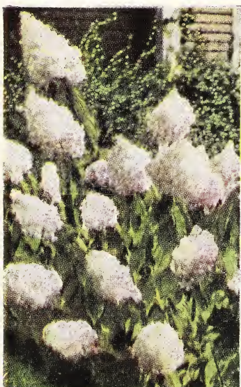
Hydrangea Paniculata Grandiflora.