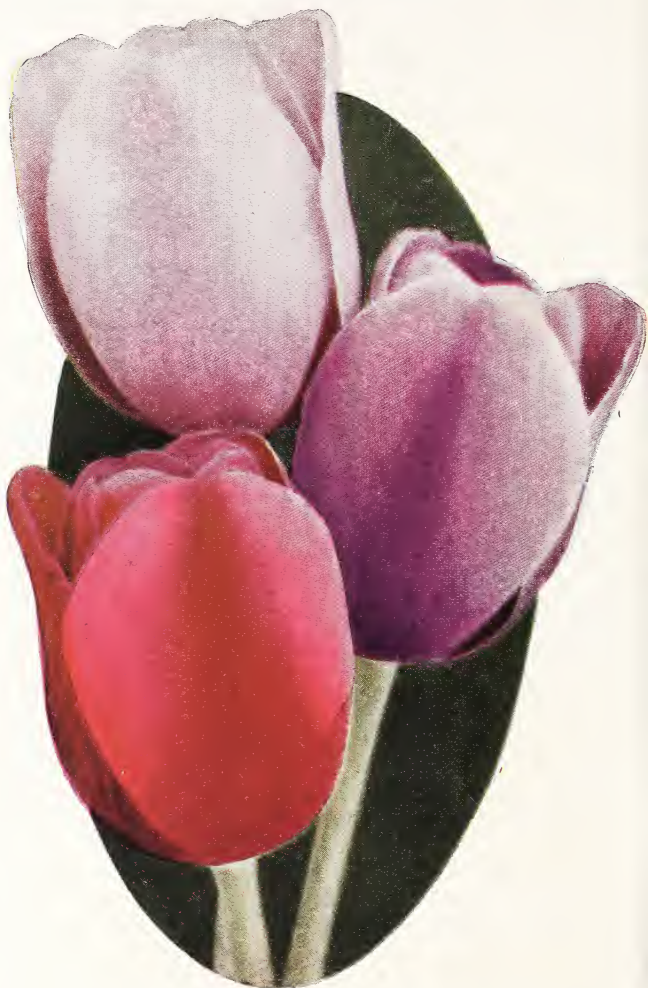
Upper Tulip, White Queen. Center, Clara Butt. Lower, Pride of Haarlem.