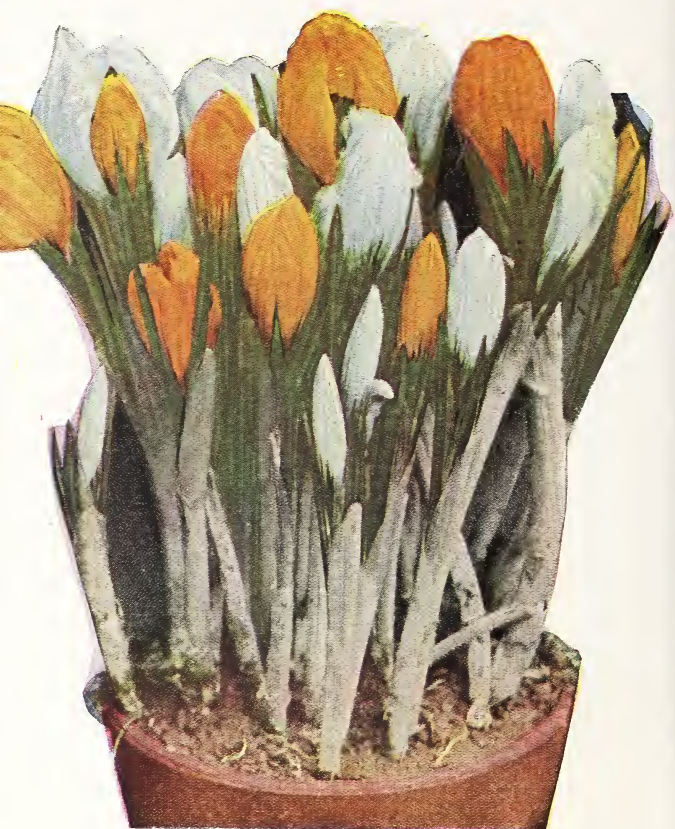
Crocus as Grown in Pot.