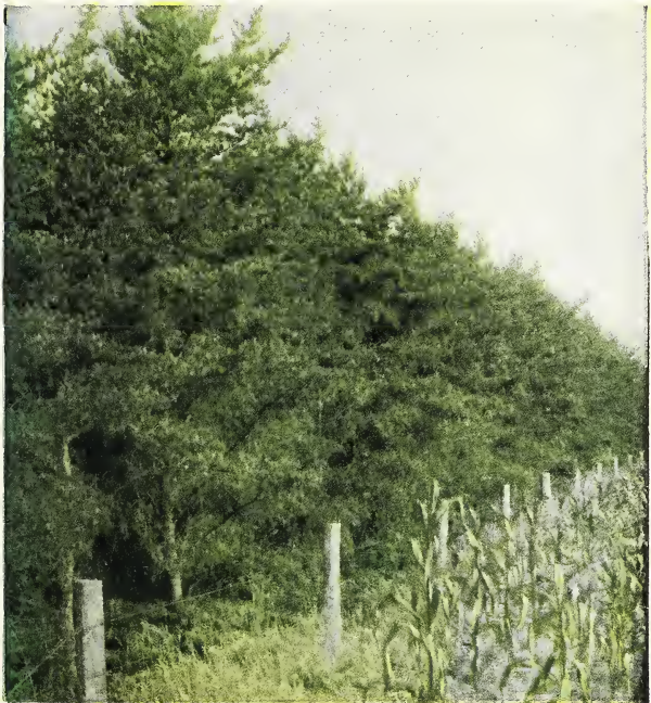
The above Jack Pine windbreak is one of the best in the United States, growing on the Shafer farm, one-fourth mile west of the Franklin County Fair Grounds.