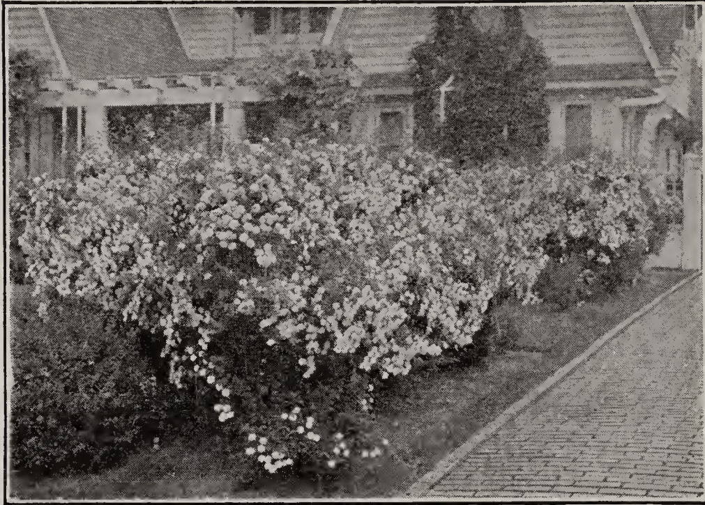
SPIREA VAN HOUTTEI