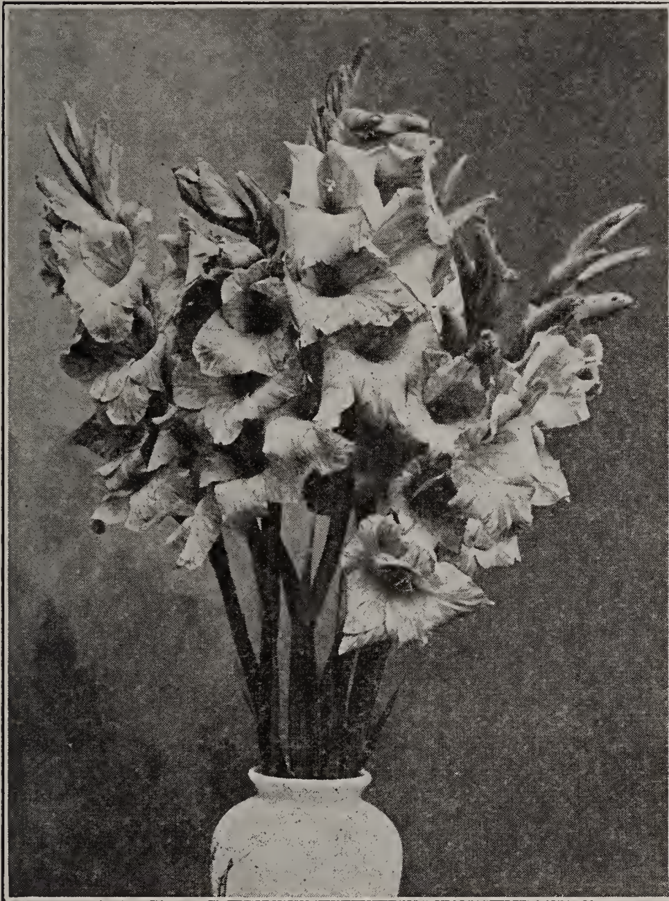
A prize winning bouquet of W. H. Phipps' gladiolus shown at DeKalb County Fair held at Auburn, Ind., October, 1934.

We are presenting for your consideration twelve of the most valuable gladiolus. We raise many varieties and can supply you with most any variety, but these twelve are outstanding for beauty and cut flowers. The bulbs we send you are not small sized, but range from 1¼" to 2". They are also free from thrips.