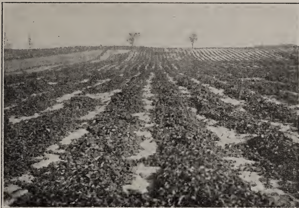
A Field of Our Premier Plants