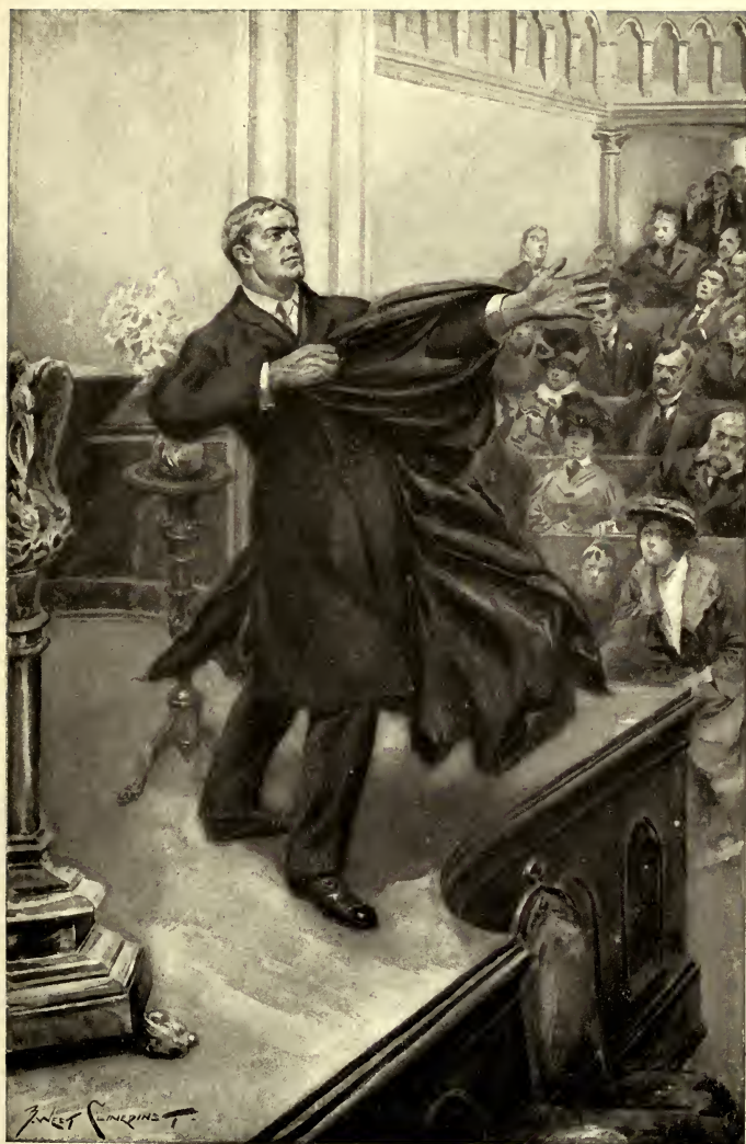
“Ripped it open, tore it from his arms, and threw it on the floor.”