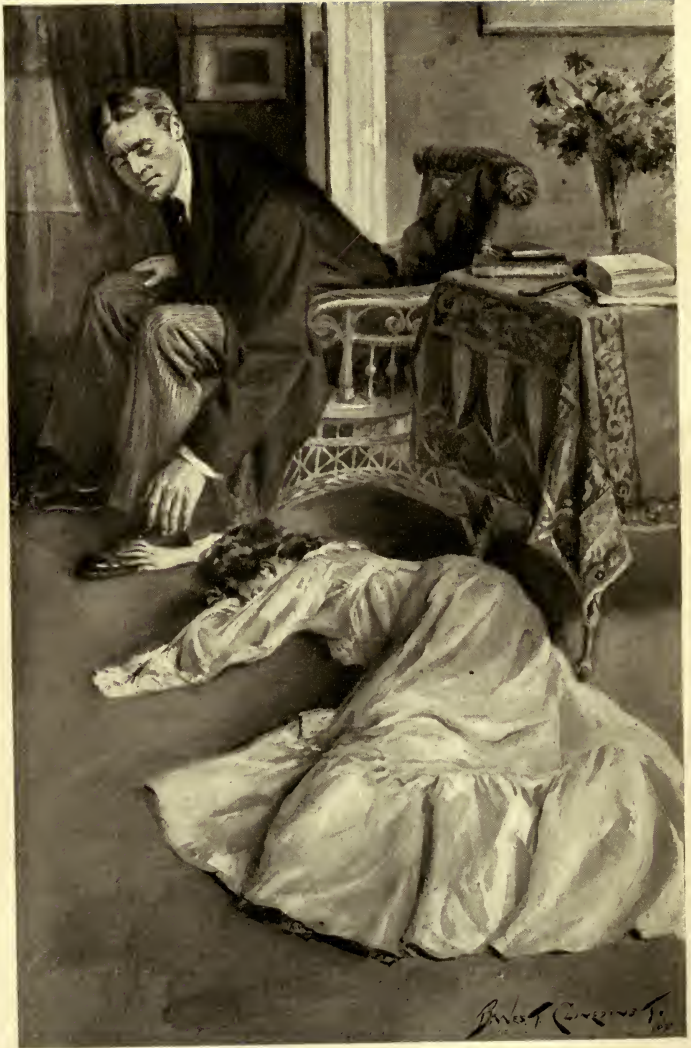
"Her tapering fingers rested on his broad foot."