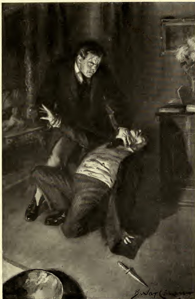
“Driving his great fingers into his throat.”