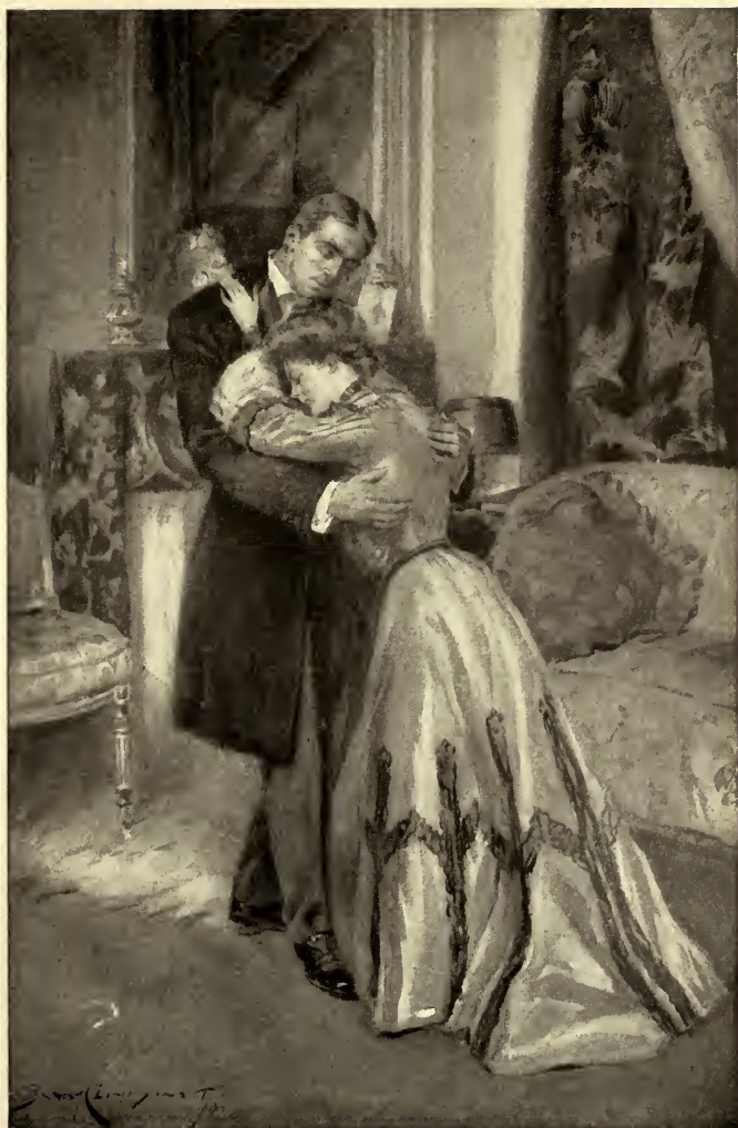
"Her arms stole around his neck."