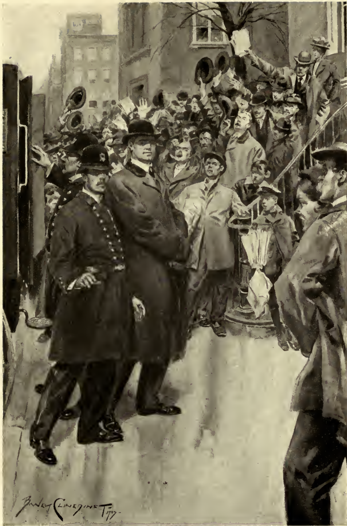
"A cheer suddenly burst from the crowd and echoed through the court-room."