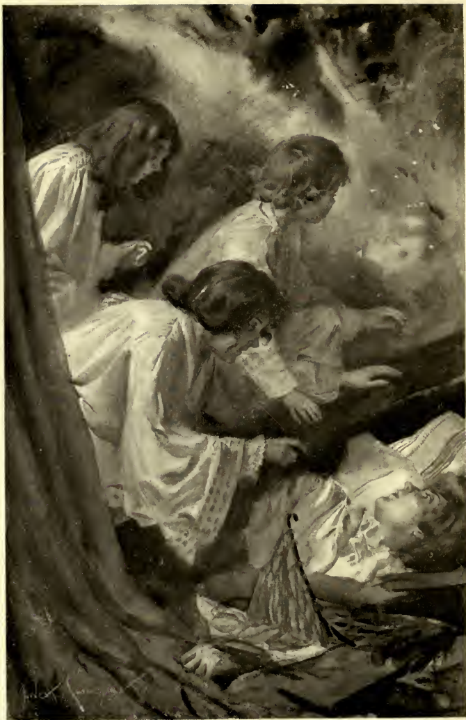
"A faint cry came from the full lips."