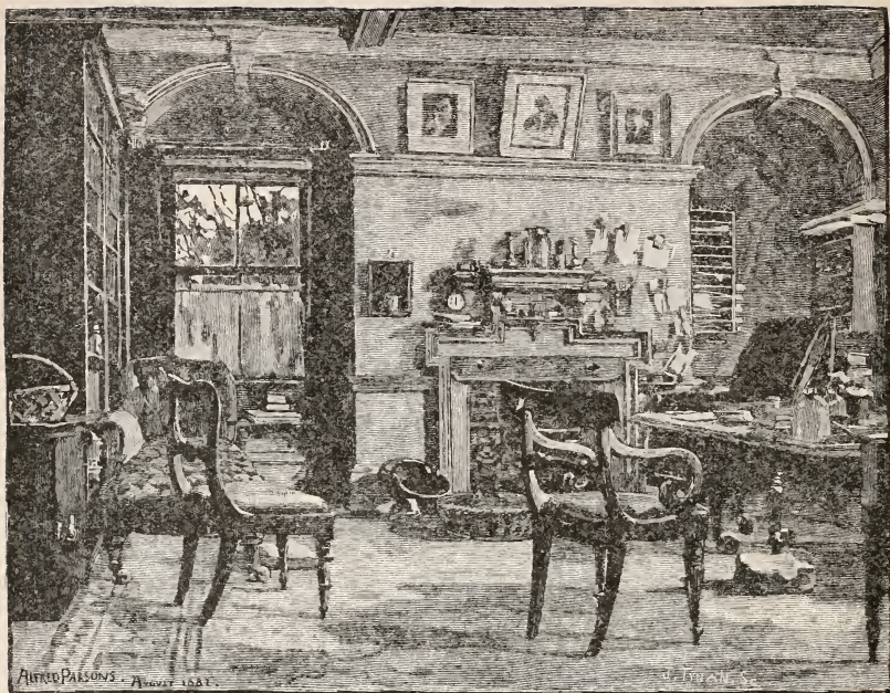
THE STUDY AT DOWN.*