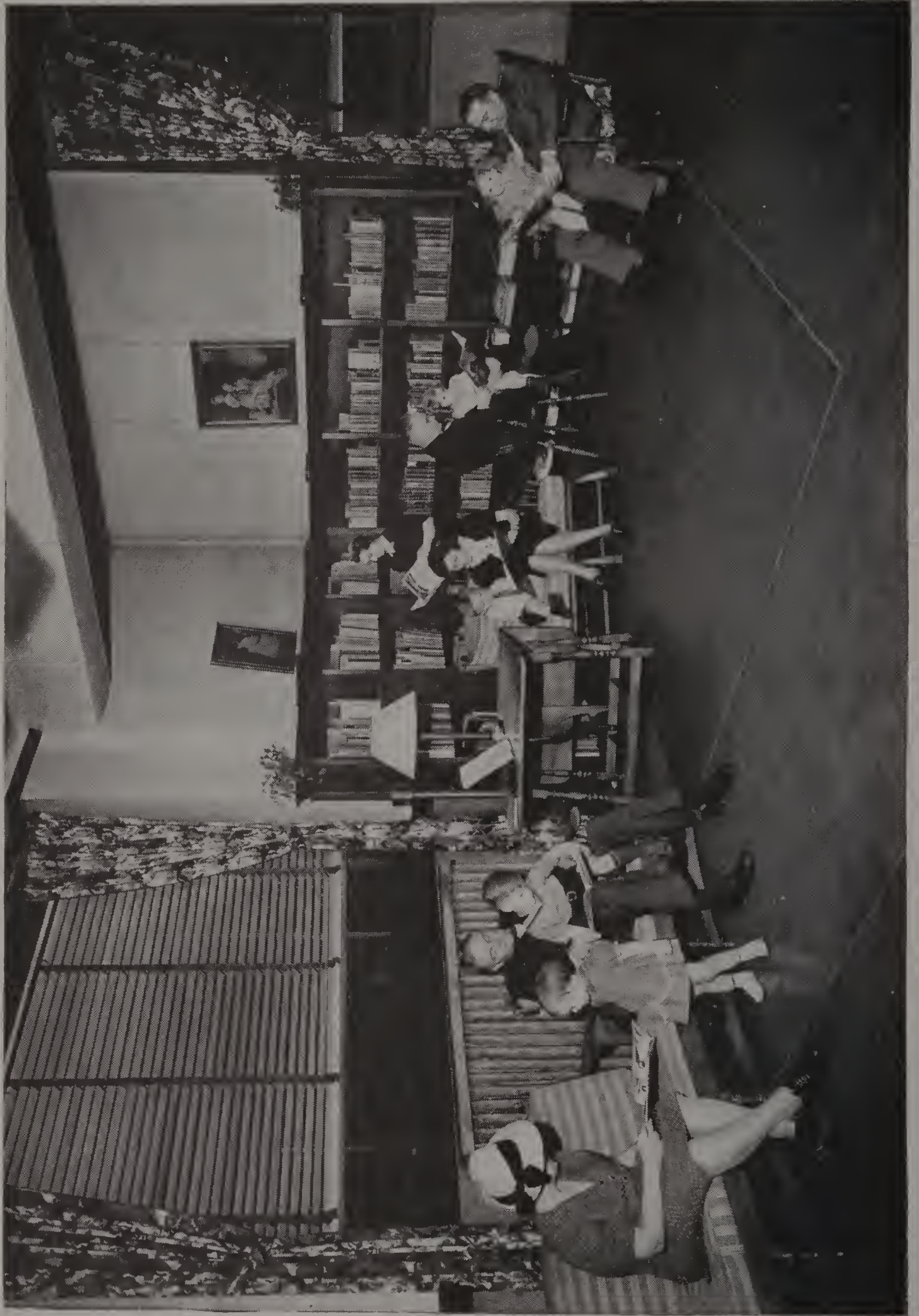
A TYPICAL SCENE IN THE MOTHERS' ROOM OF THE YOUNGSTOWN PUBLIC LIBRARY