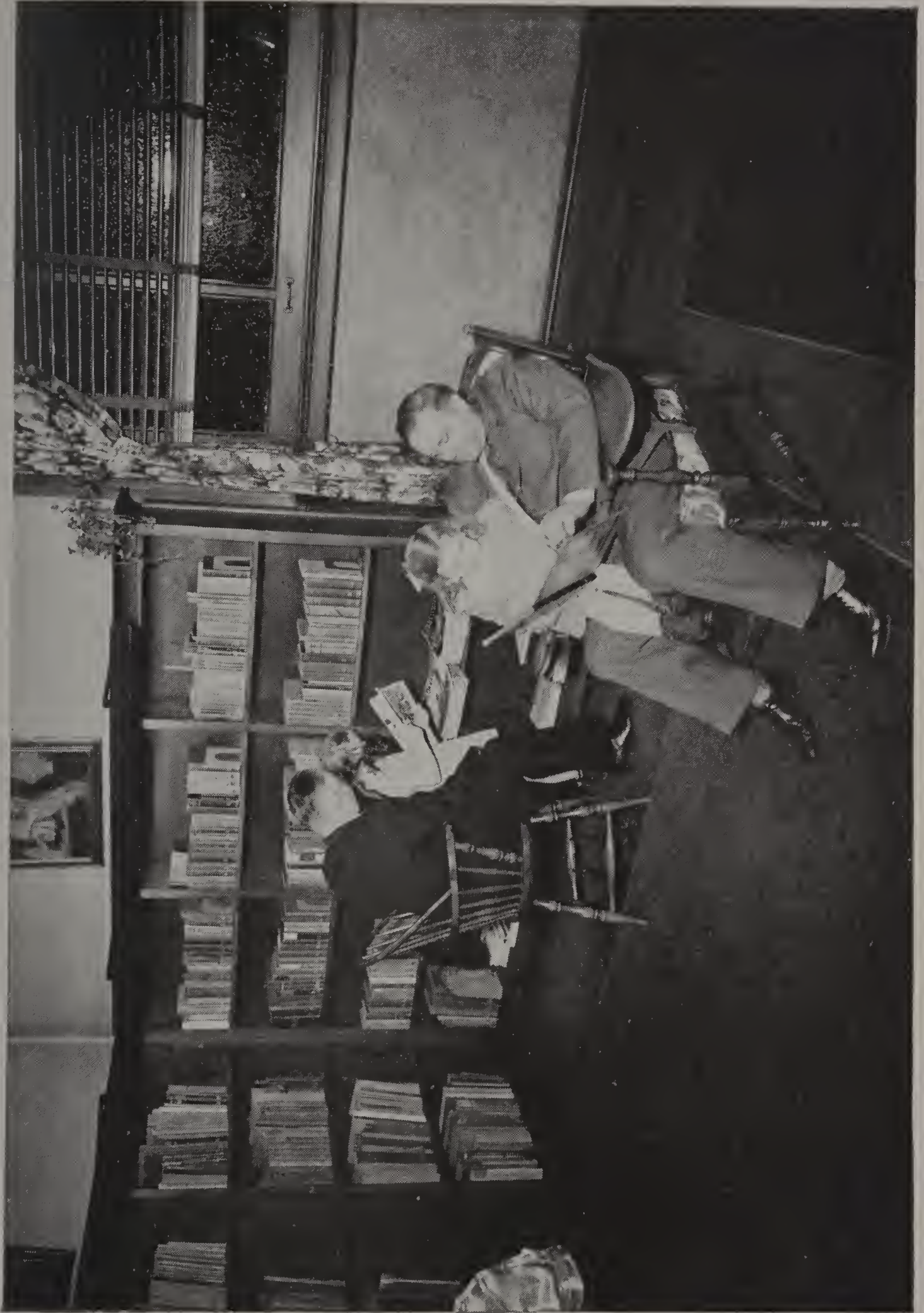
FATHERS AS WELL AS MOTHERS FIND TIME TO USE THE MOTHERS' ROOM