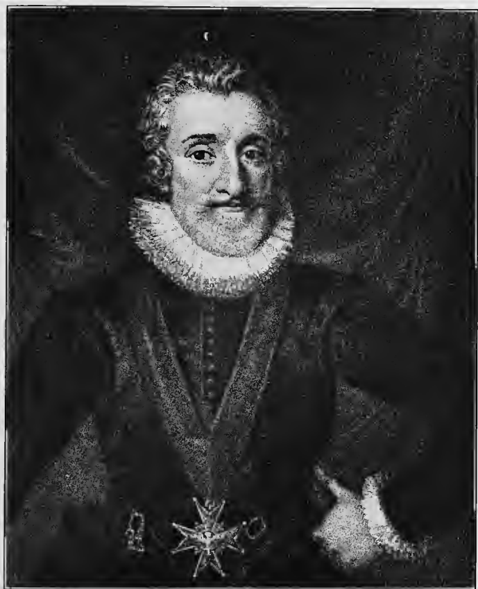
HENRY IV OF FRANCE