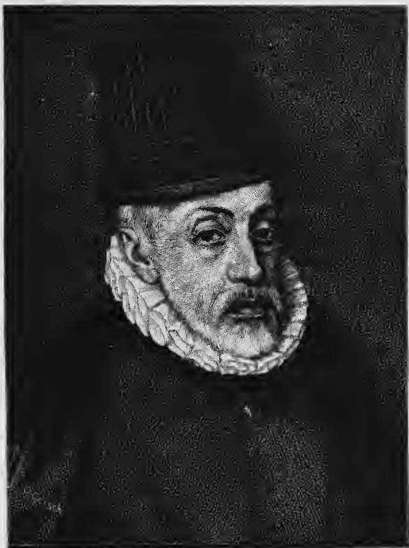
PHILIP II. IN HIS OLD AGE Painting by Antonio Moro, Museum del Prado, Madrid.