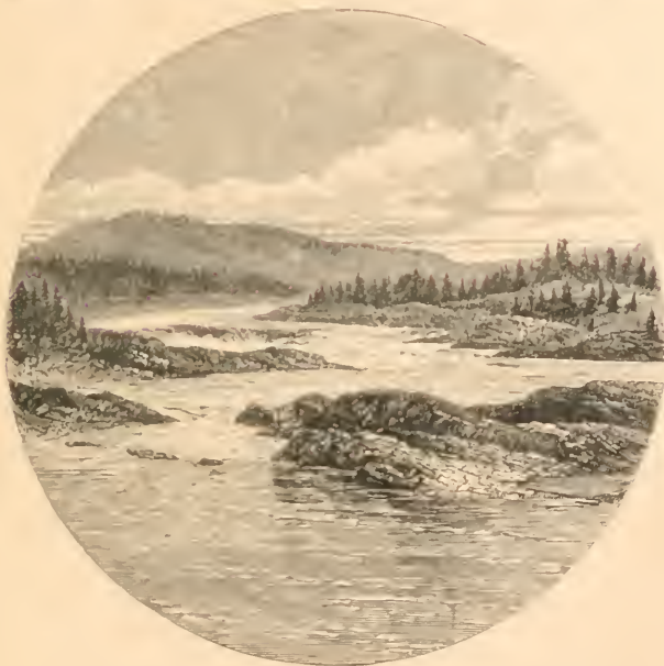
THE 'KETTLE' FALLS: A SALMON LEAP ON THE UPPER COLUMBIA.

NATURALIST TO THE BRITISH NORTH AMERICAN BOUNDARY COMMISSION.