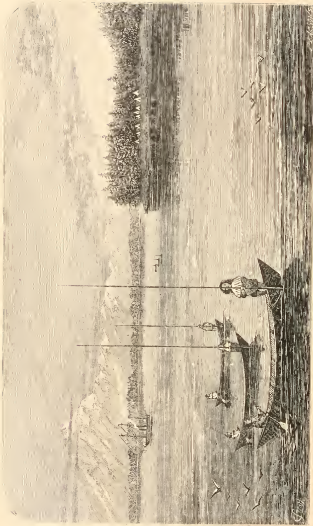
STURGEON-SPEARING ON THE FRASER.