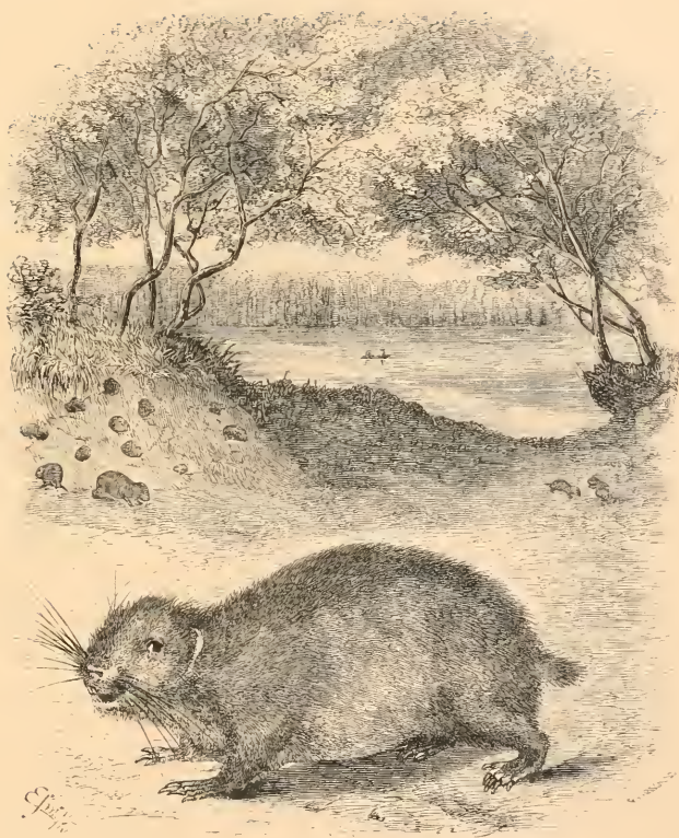
OU-KA-LA ( Aplodontia leporina ).