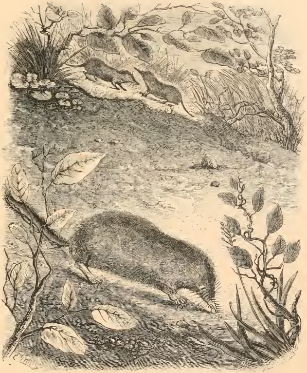
THE UROTRICHUS ( Urotrichus Gibsii ).