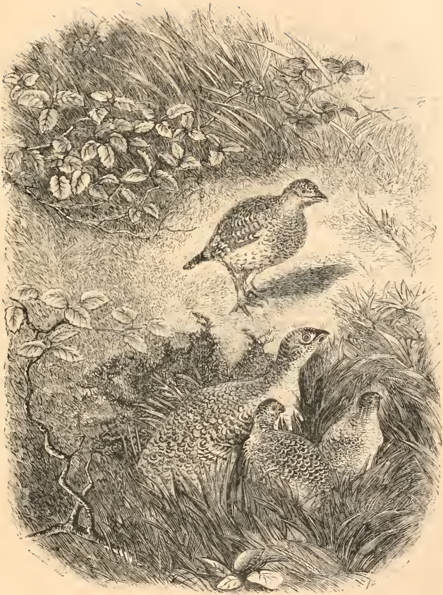
THE SHARP-TAILED GROUSE