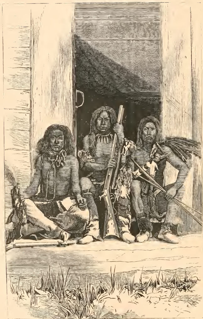
A GROUP OF SPOKAN INDIANS