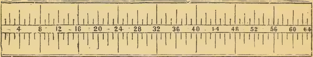
SCALE OF ONE-SIXTEENTH OF AN INCH.