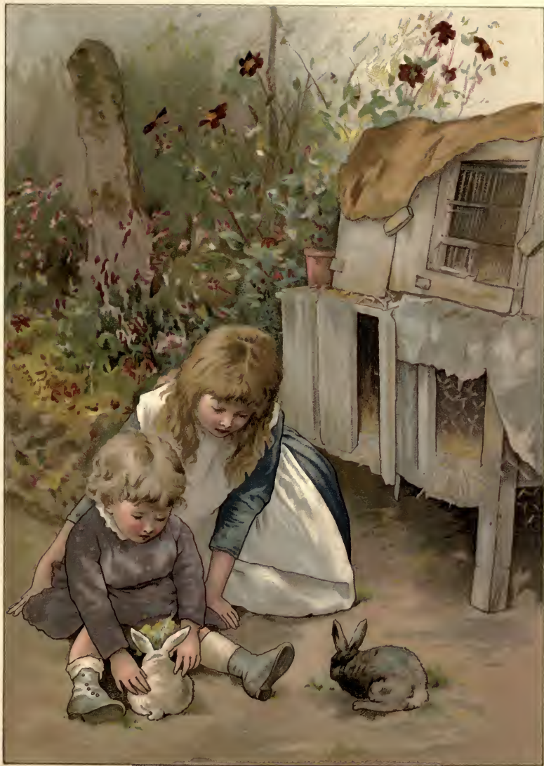
THE PET RABBIT.