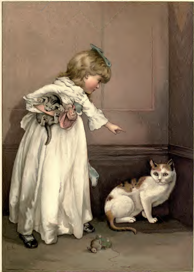
PUSS IN THE CORNER.