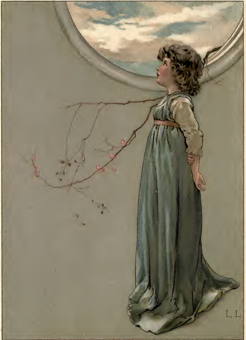
HOPES AND FEARS.