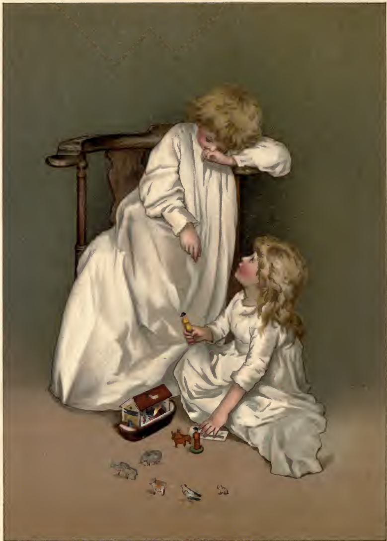
PUTTING AWAY THE TOYS.