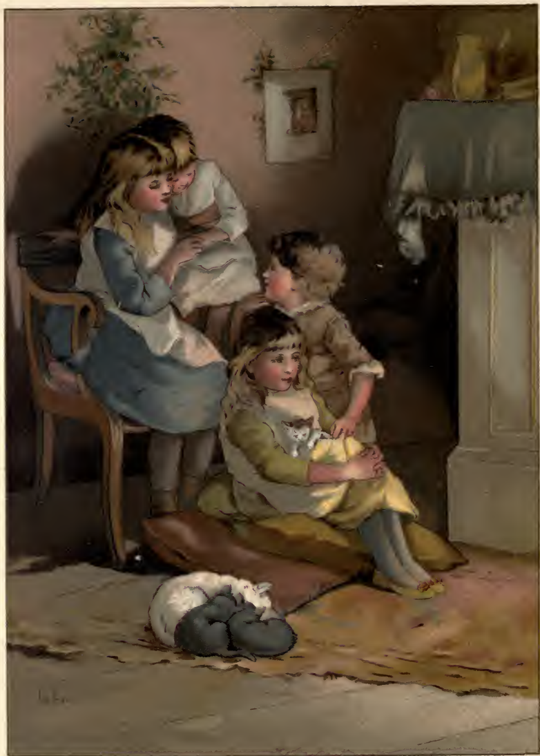
THE EVENING HOUR