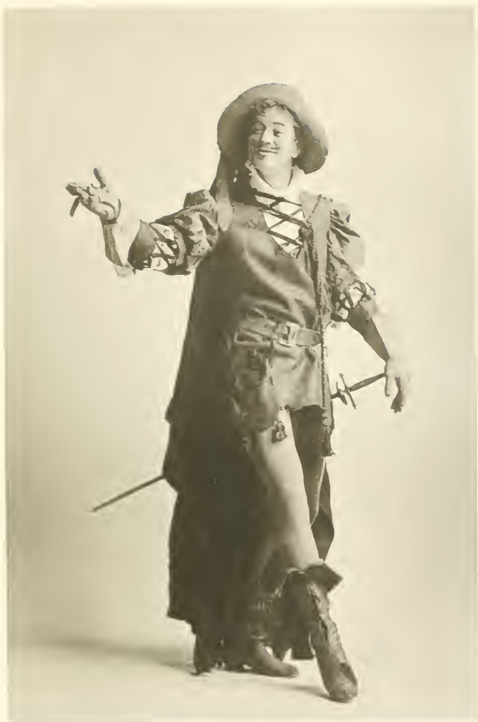
JAMES K. HACKETT, As Don Cæsar, in Don Cæsar's Return.