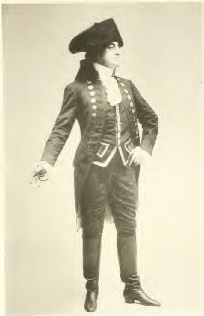
JOHN DREW. As Richard Carvel.