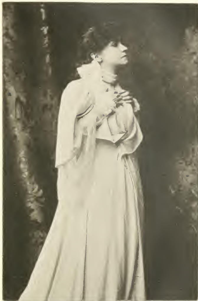
MRS. FISKE. As Tess.