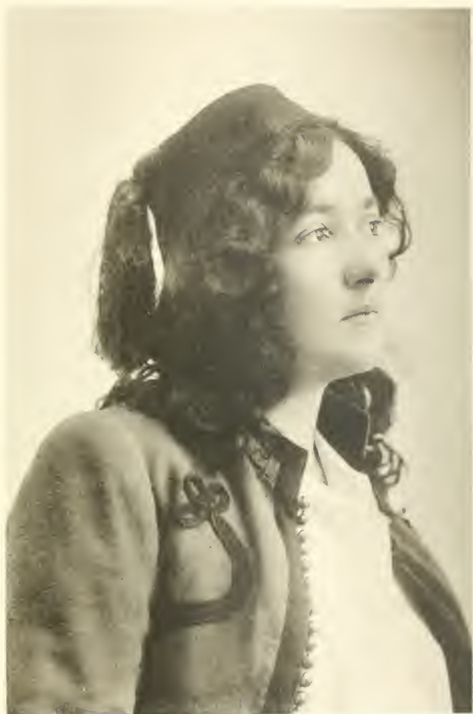
BLANCHE BATES. As Cigarette, in Under Two Flags.