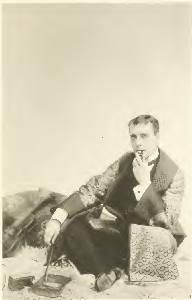
WILLIAM GILLETTE. As Sherlock Holmes.