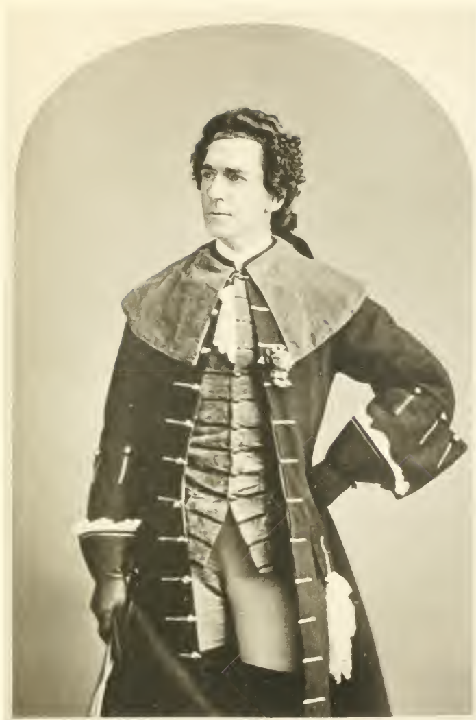
EDWARD A. SOTHERN, As David Garrick.