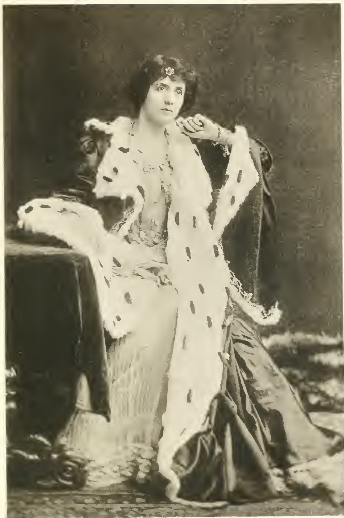
MRS. PATRICK CAMPBELL, As Magda.