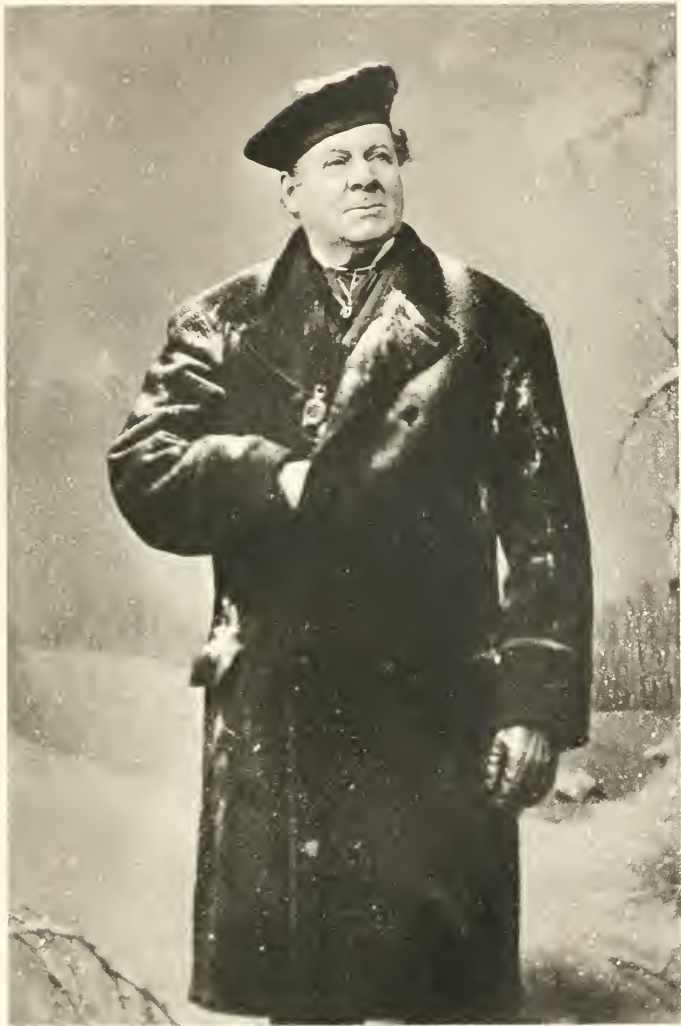
JOHN GILBERT, As Col. Sir Alex. Shendryn, in Ours