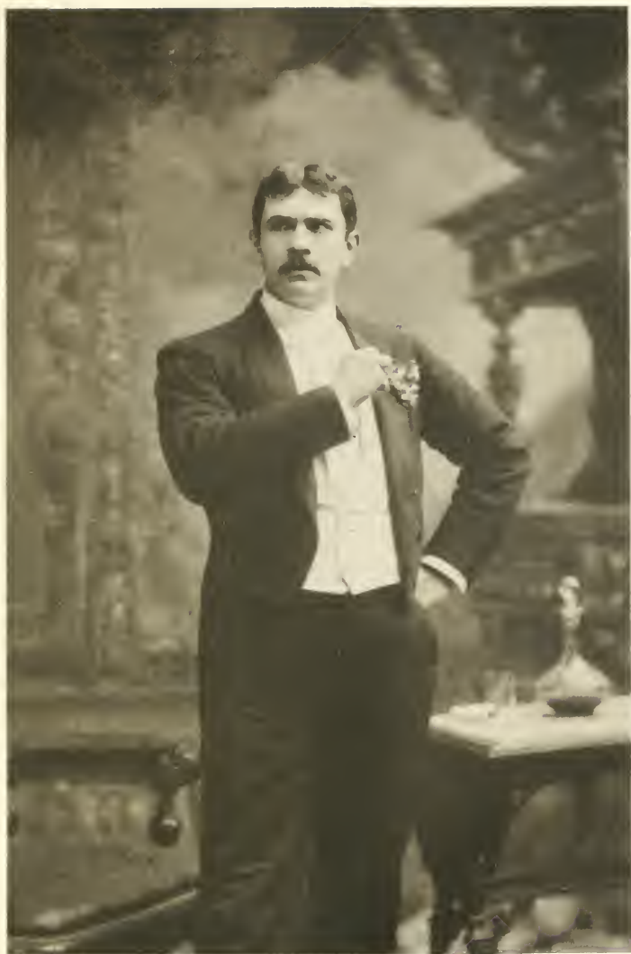
MAURICE BARRYMORE, As Mr. Wilding, in Captain Swift .