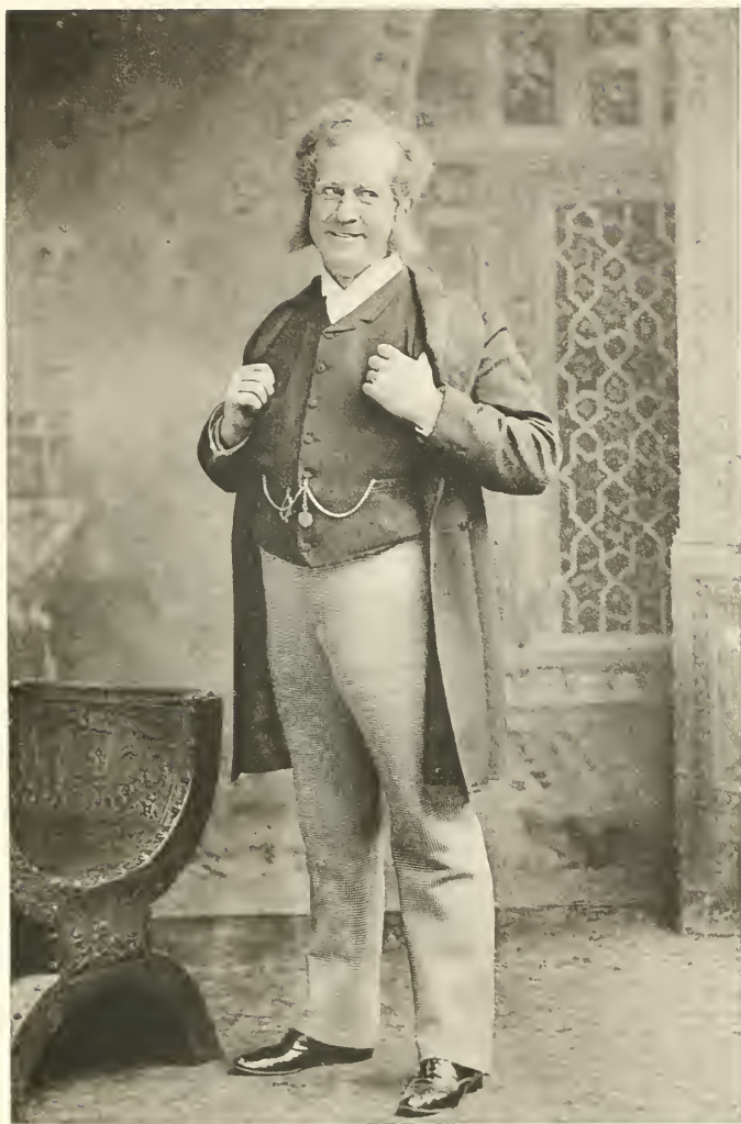
WILLIAM H. CRANE. As Senator Hannibal Rivers, in The Senator .