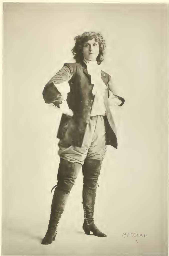
HENRIETTA CROSMAN, As Nell Gwynn, in Mistress Nell .