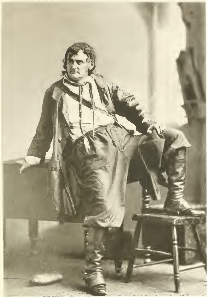
JOSEPH JEFFERSON, AS Rip Van Winkle