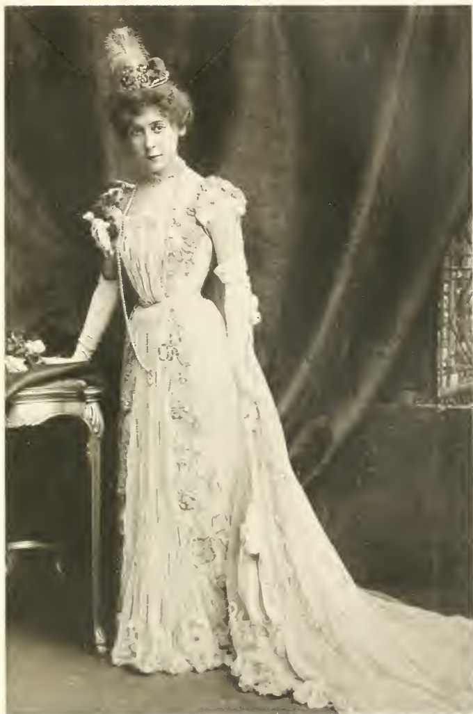
ANNIE RUSSELL, As the Princess Angela, in A Royal Family.