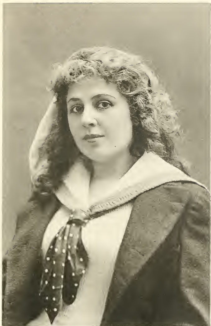
VIOLA ALLEN, As Glory Quayle, in the Christian.