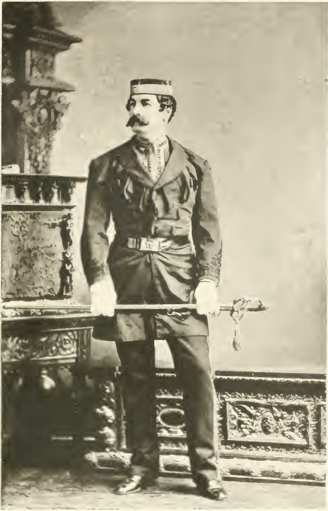
LESTER WALLACK. As Eliot Grey, in Rosedale