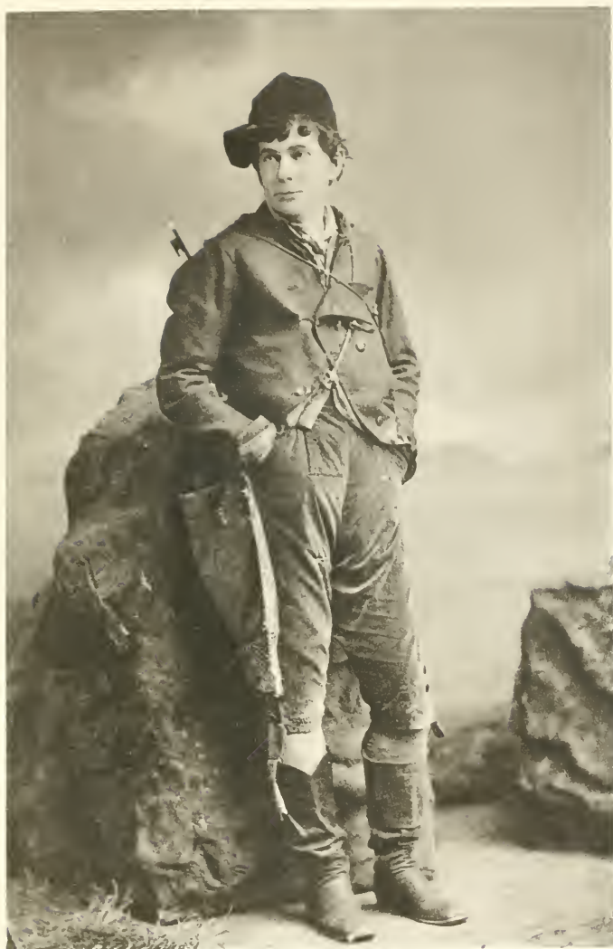
DION BOUCICAULT, As Conn, in The Shaughraun .