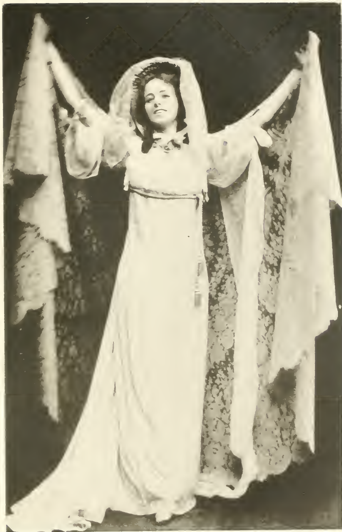
MAUDE ADAMS. As Phoebe Throssell, in Quality Street