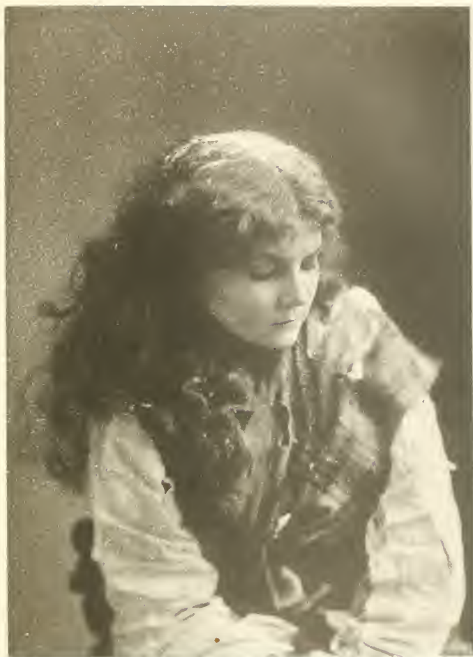
KATE CLAXTON, As Louise, in the Two Orphans.