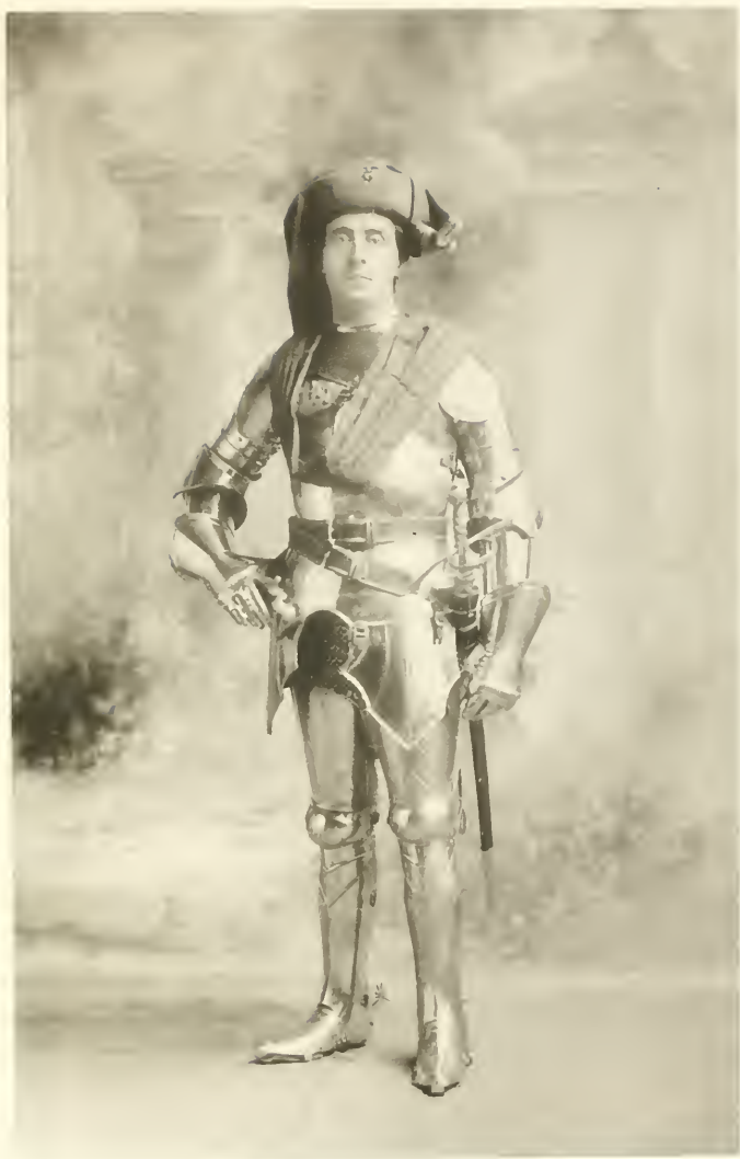
EDWARD H. SOTHERN. AS Francois Villon, in If I Were King .