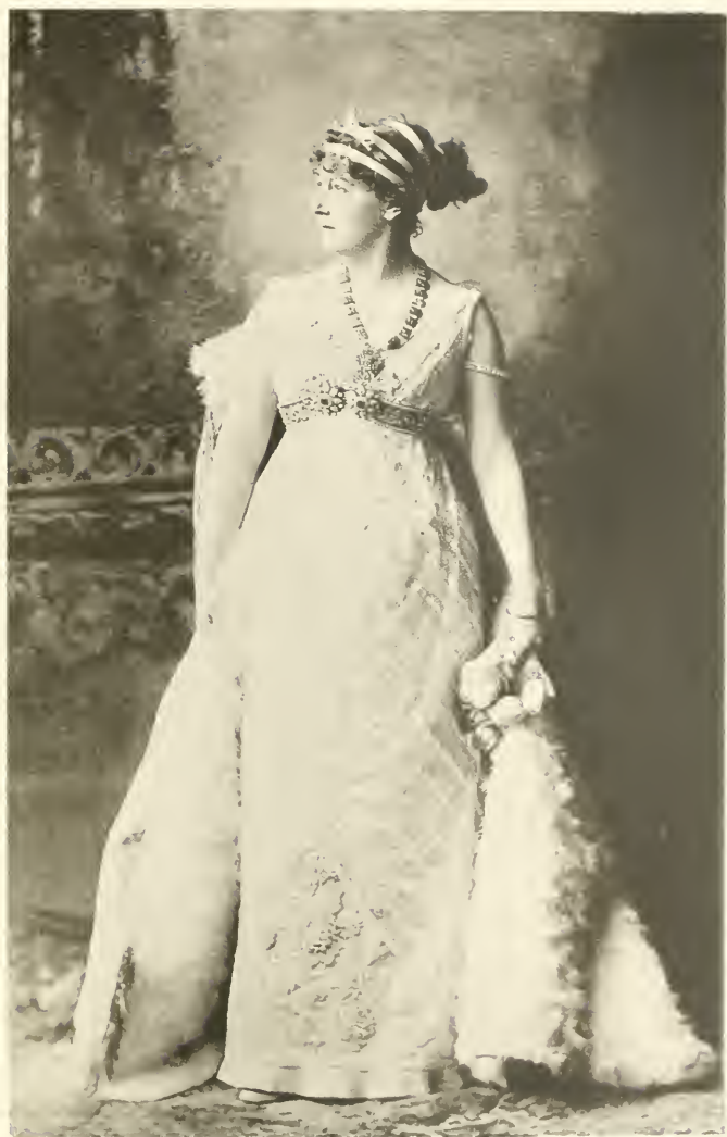
FANNY DAVENPORT, AS Floria Tosca, in La Tosca .