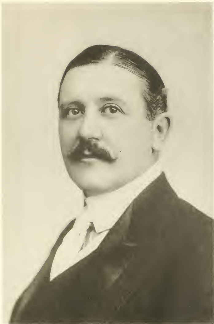
CHARLES HAWTRY. As Horace Parker, in Message from Mars .