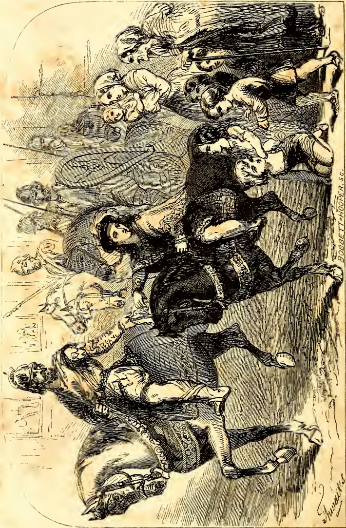
The Largesse. Page 31.