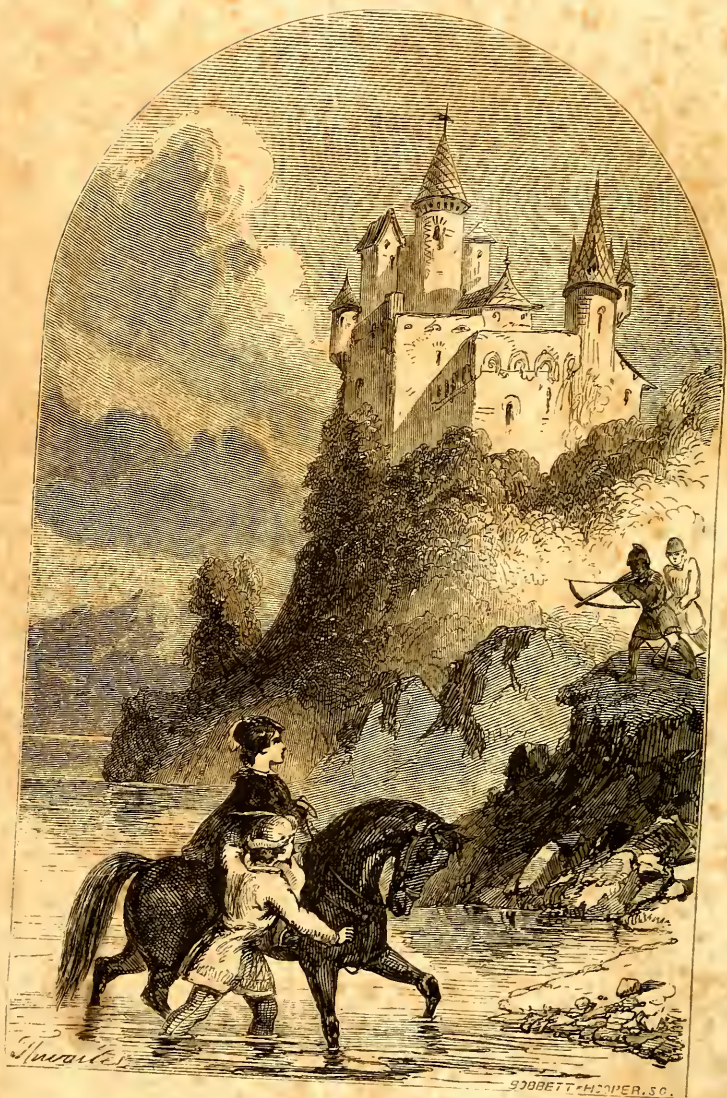
The Ford of Montemar. Page 149.