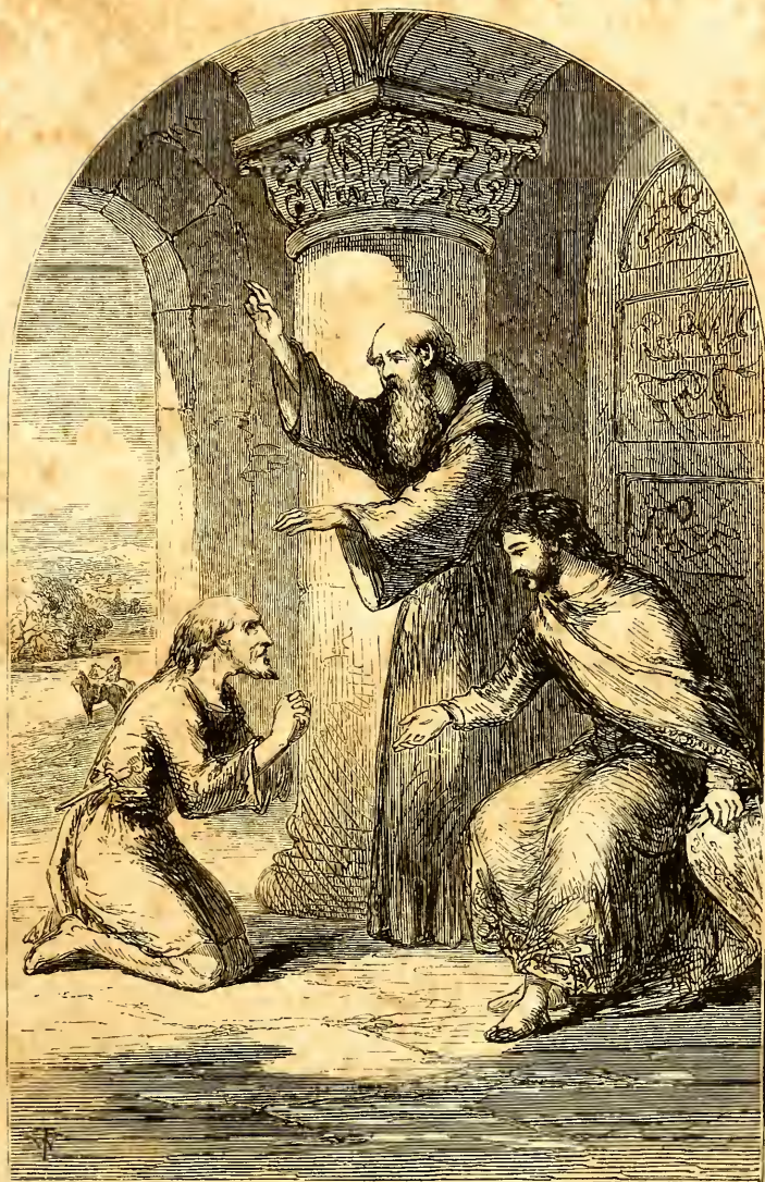
The Revenge. Page 202.