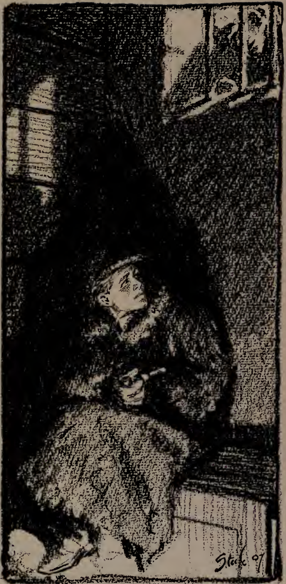
The moonlight was eclipsed by a head and shoulders