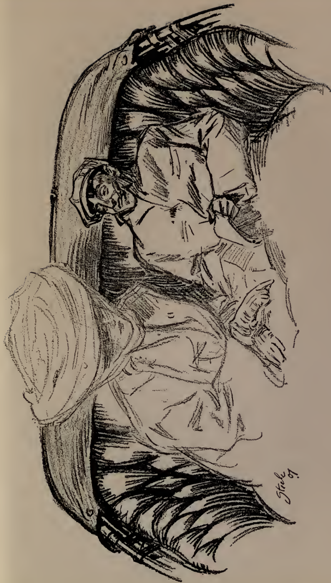
She placed her finger on a twisting red line that trickled through a page of type