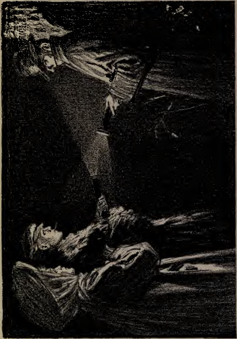
In the two circles of light the men surveyed each other