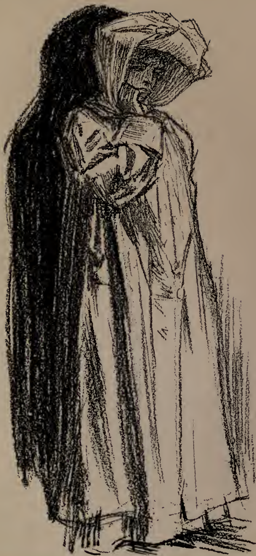
The girl shrinking against the wall