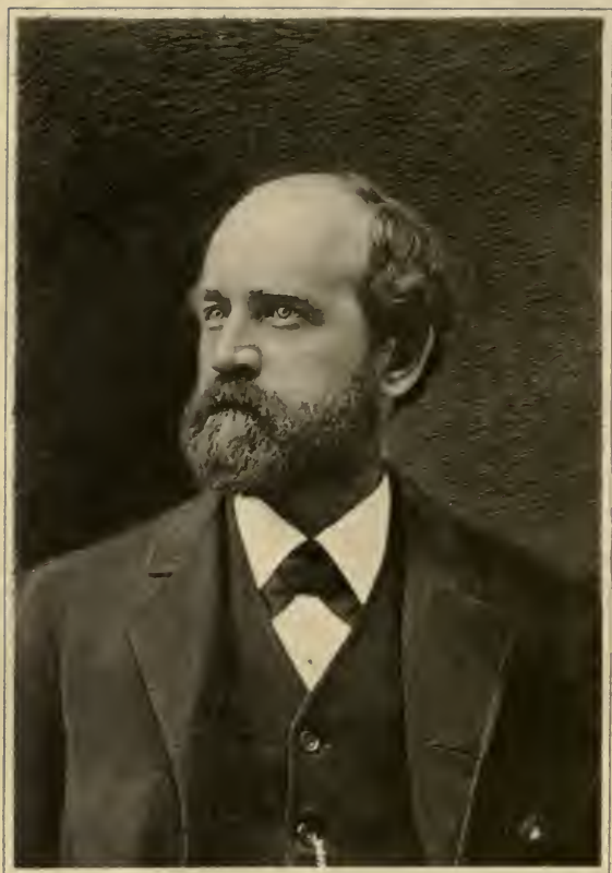
Henry George when writing "Progress and Poverty" San Francisco, 1879