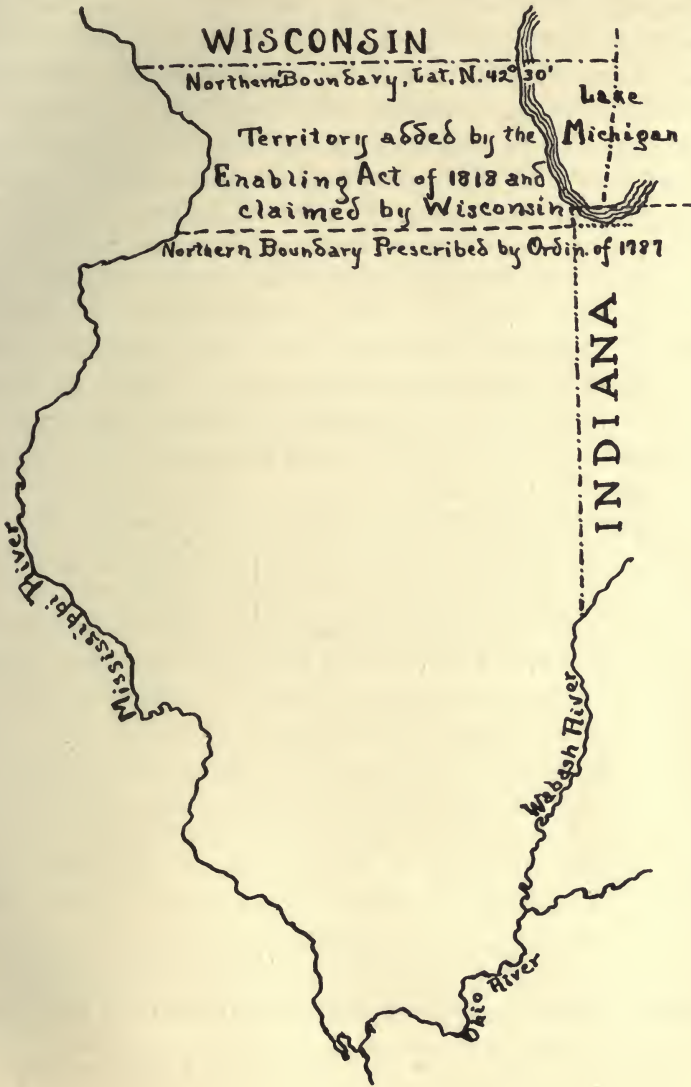
MAP SHOWING NORTHERN BOUNDARY OF ILLINOIS AS PRESCRIBED BY THE ORDINANCE OF 1787 AND ALTERED BY THE ENABLING ACT OF 1818