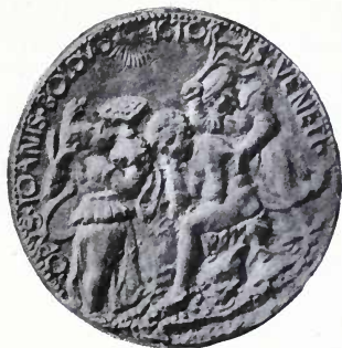
FIG. 56.—Reverse (reduced) of a medal by Giovanni Bolzu of Venice. (After Heiss.)