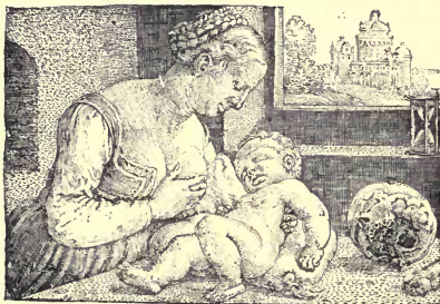
FIG. 4.—Mother and child, with skull and hour-glass. Engraving by Barthel Beham, in the British Museum.

from which the hand of a skeleton holds out a winged hour-glass. 31 In an anonymous Dutch engraving of the