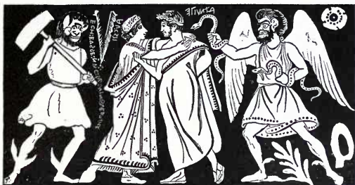
FIG. 45.—An Etruscan "parting scene," with the Etruscan "Charun" holding hammer and a winged demon holding snakes. From a painted vase (after Dennis).

In Etruscan death-scenes the Etruscan Charun is occasionally represented (see Fig. 45) accompanied by various Gorgon-like or Fury-like demons, sometimes holding snakes in their hands, including "Vanth," probably the Greek Thanatos (Θάνατος). 96 A somewhat