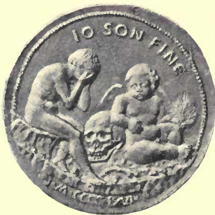
FIG. 14 (reduced).

A third medal, made by Boldu in 1446, represents the bust of the Roman Emperor Caracalla on the obverse,