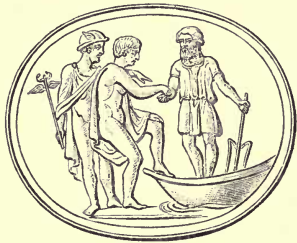
FIG. 35.—Charon in his boat, receiving a soul from Mercury.

is to say, the Greek Hermes, in his character of "psychopompos," see later on) (Fig. 35). Several Roman gems (intagli) are engraved with figures of skeletons ("larvae" or "shades"). Some at least of these designs seem to suggest the popular conception of Epicurean advice, namely, to seek pleasure, to eat, drink, and enjoy life to-day, since death may come to-morrow. 76 Thus, an