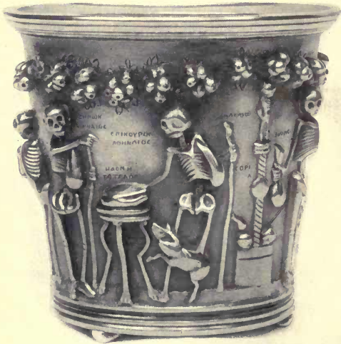
FIG. 1.—Silver cup forming part of the so-called Boscocreale treasure in the Louvre Museum at Paris, supposed to date from the first century of the Christian era. Photograph from the facsimile in the Victoria and Albert Museum, showing the skeletons, or "shades," of the philosophers Epicurus and Zeno.

They are adorned with figures of skeletons ("shades" 17 ) and garlands of roses, and bear various inscriptions, some of which urge the enjoyment of pleasure whilst yet life lasts, and whilst enjoyment of anything is possible: Eat,