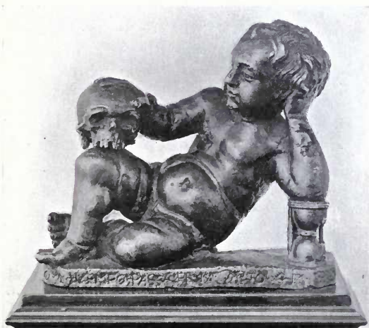
FIG. 57.—Italian bronze statuette (fifteenth century ?), representing an allegory of life.