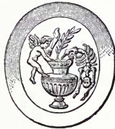
FIG. 38.—Cupid dislodging a skeleton. (After King.)

Another gem 80 represents Cupid throwing the light of a torch into a large vessel (crater), from which issue a