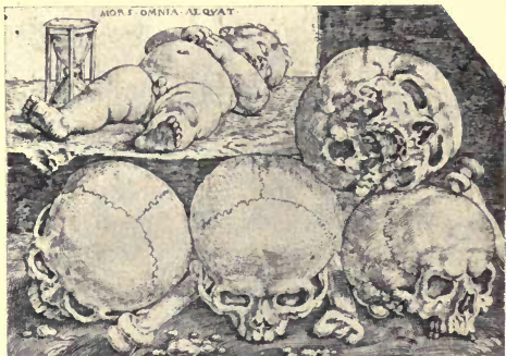
FIG. 3.—Baby with the four skulls. Engraving by Barthel Beham, in the British Museum.

an aged woman with bent back, leaning on a staff and carrying a basket of sticks, approaches an open grave, and