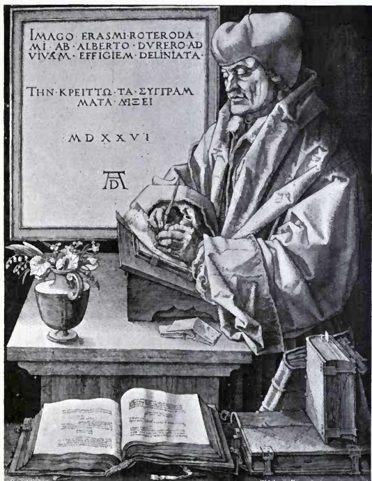
FIG. 16.—Engraving of Erasmus by Dürer. Reduced from an example in the British Museum.

writings of Erasmus, as some have supposed, but to death, the common goal of all, i.e. , as the medal itself