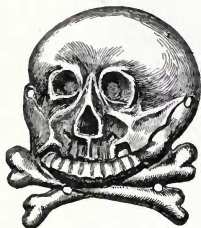
FIG. 6.—Bronze death's-head badge (actual size), worn on the shakos of the Prussian Black Hussars in 1815.

Brunswick-Oels, were likewise given a black uniform with a Death's head as their badge, partly, it is said, as a token of mourning for the previous duke, who was mortally wounded at the battle of Auerstadt (October 14, 1806), in the war against Napoleon. 50 A little bronze Death's head, worn by the Black Hussars on their shakos during the war of 1815 against Napoleon, is illustrated (see Fig. 6). In France a skull and crossed bones constituted the badge of the 9th Regiment of Hussars, which was formed in March, 1793, out of the second corps of "hussards noirs du nord." The device was apparently copied from that of the Prussian Black