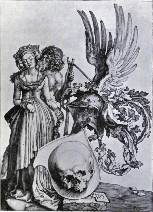
FIG. 2.—Dürer's so-called “Wappen des Todes” (engraving in the British Museum).

“Wappen des Todes” (Fig. 2), it seems to me that the engraving in question (1503) has a different meaning 24