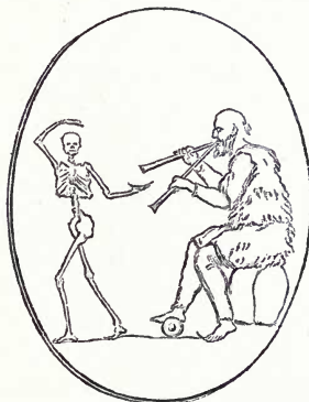
FIG. 52.—Skeleton in dancing attitude before a man seated piping. (After Gori.)

A. F. Gori 110 figures an antique gem (see Fig. 52), on which is engraved a man (countryman, peasant?) seated on a stone, with his right foot resting on a globe; he is piping on a double flute, and before him a skeleton dances grotesquely. Is this device meant to signify that the