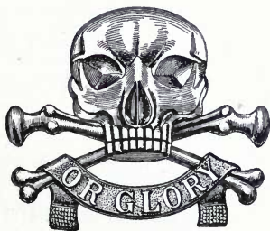
FIG. 7.—"Death or Glory" brass badge (actual size), worn on the head-dress of the English 17th Lancers.

Hussars. The English 17th Lancers wear as a badge on their head-dress and collar a skull and crossed bones, with the words "or glory" below (see Fig. 7). The object of this device ("Death or Glory"), which was introduced at the suggestion of Lieutenant-Colonel John Hale in 1759 (who was Lieutenant-Colonel Commandant