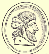
FIG. 39.—So-called head of Plato. (After King.)

possibility of the survival of the soul (Psyche) after death. Certain terminal Hellenistic bearded heads (in the style of a so-called "Hermes" or "Terminus") engraved in profile with butterfly wings above the ear have often been described as portraits of Plato 81 (Fig. 39). This explanation was apparently due to Winckelmann, 82 who