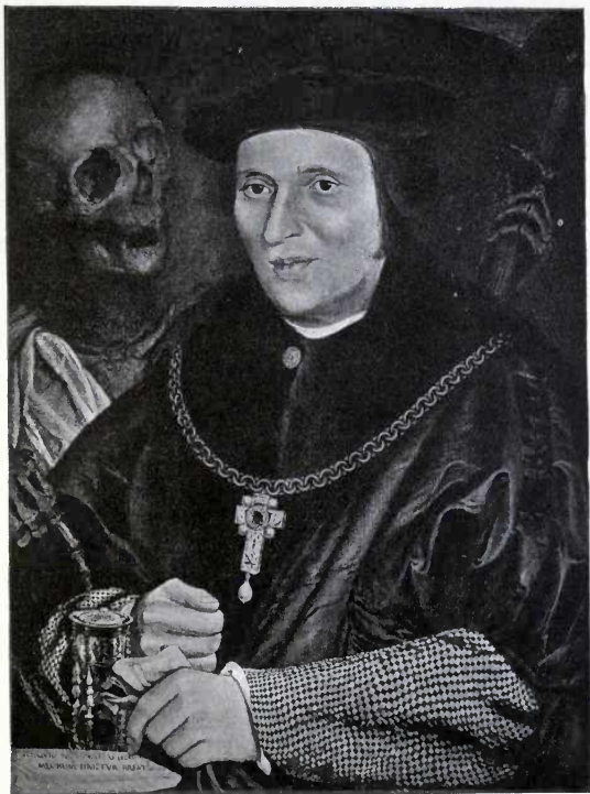
FIG. 5.—Holbein's painting of Sir Brian Tuke, in the Munich Pinakothek.

A similar train of thought is suggested by Holbein's portrait (in the Munich Pinakothek) of Sir Brian Tuke,