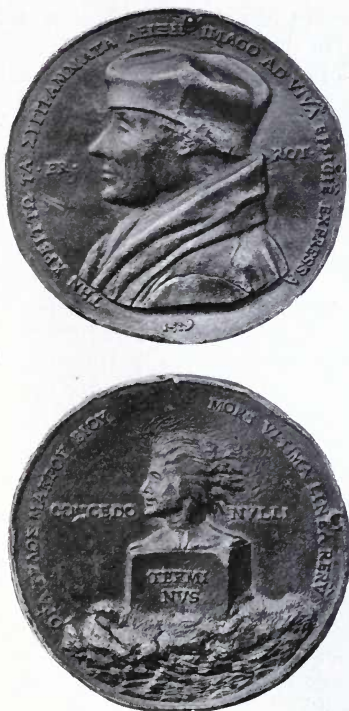
FIG. 15 (reduced).—From a specimen formerly in the author's collection.

LINEA RERVM ("Keep in view the end of a long life. Death is the final goal of all"). (Fig. 15.)