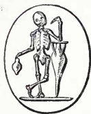
FIG. 36.—The skeleton and wine-jar type. (After King.)

occasional subject (Fig. 36) is a skeleton with a large wine-jar (amphora) 77 or two skeletons with a wine-jar between them.