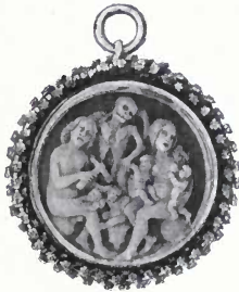
FIG. 55.—German shell-cameo of the sixteenth century.

Here one may mention certain jewels, small bronzes, &c., bearing devices referring in one way or another to the subject of death. Mr. W. T. Ready has kindly given me an illustration (Fig. 55) of an early sixteenth-century