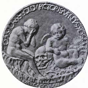
FIG. 13 (reduced).

(I. and XVII.) Memento mori medals by Giovanni Boldu, of Venice, 1458-1466.