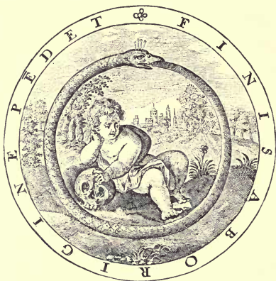
FIG. 32.—Design from Wither's Emblems , 1635.

I think these pieces may have been produced to be