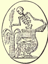
FIG. 37.—Allegory of posthumous fame. (After King.)

a branch from a palm-tree (Fig. 37). C. W. King 78 alludes to this device as "a speaking allegory of the reaping of posthumous fame." It may, perhaps, be held to express the emptiness of posthumous fame, and to illustrate the lines of Persius ( Sat. 5, line 229, Dryden's