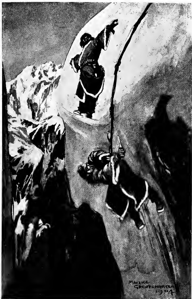
“The tough hide was half cut through.”