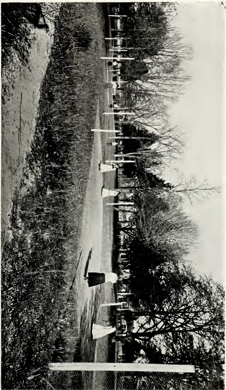
TENNIS COURTS ON CAMPUS