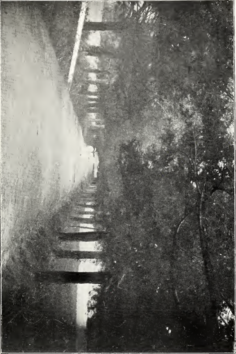
SCENE ON MAIN WALK IN FRONT OF COLLEGE