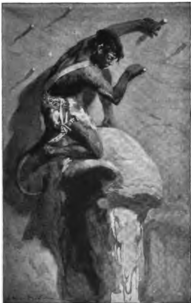
Like a gigantic rat the shaggy, black figure moved across the face of the perpendicular cliff