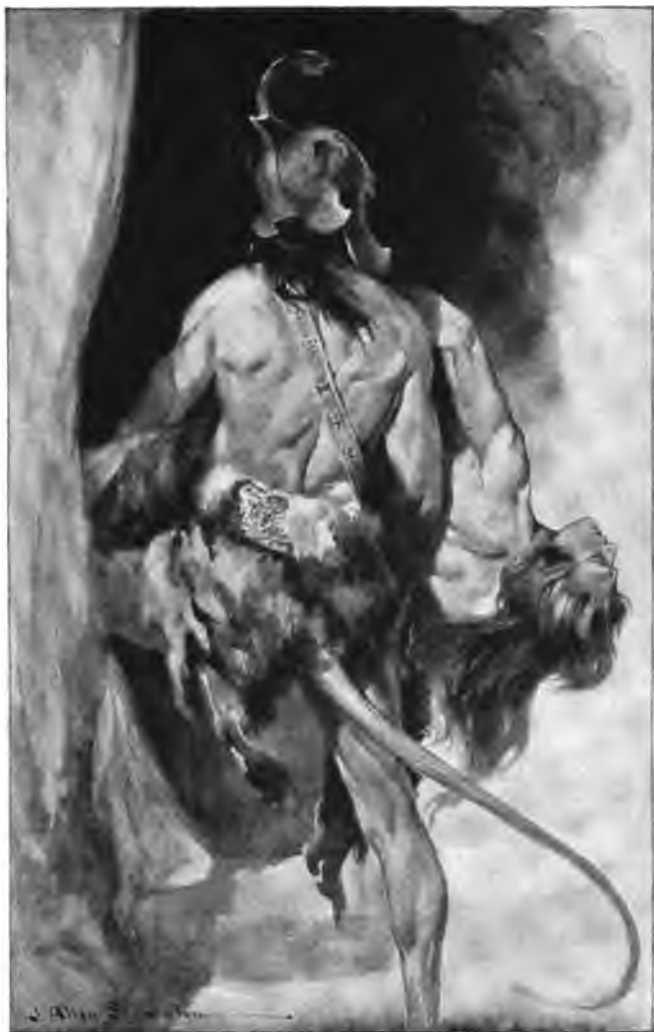
Ko-tan sprang forward, and seizing Jane about the waist, carried her off struggling and fighting fiercely