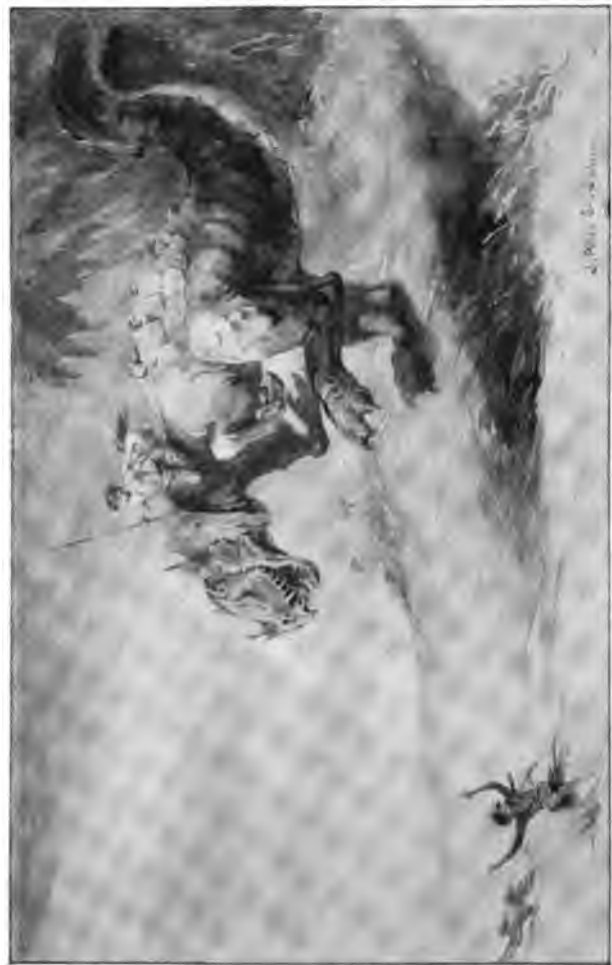
The gryf issued his hideous challenging bellow and charged the warriors