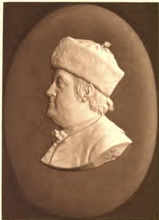
WEDGWOOD COME O MEDALLION OF BENJAMIN FRANKLIN PRESENTED TO THE AMERICAN PHILOSOPHICAL SOCIETY BY SIR GEORGE HOWARD DARWIN K. C. B. APRIL 18 1906