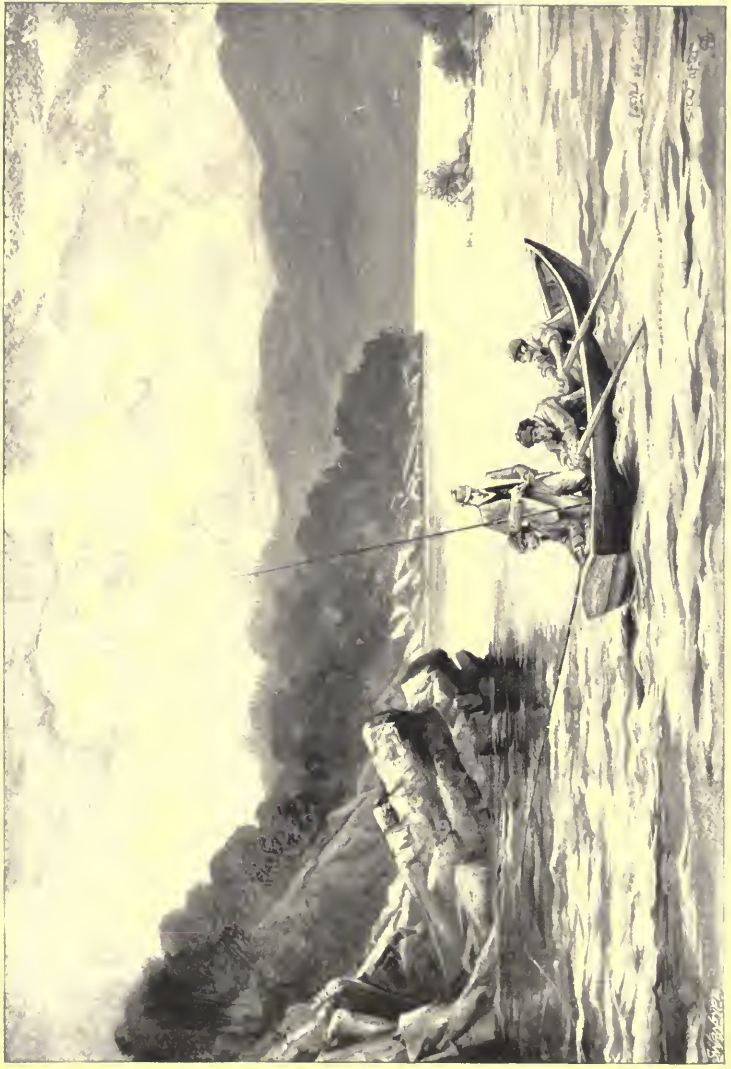
HARLING ON THE LAY