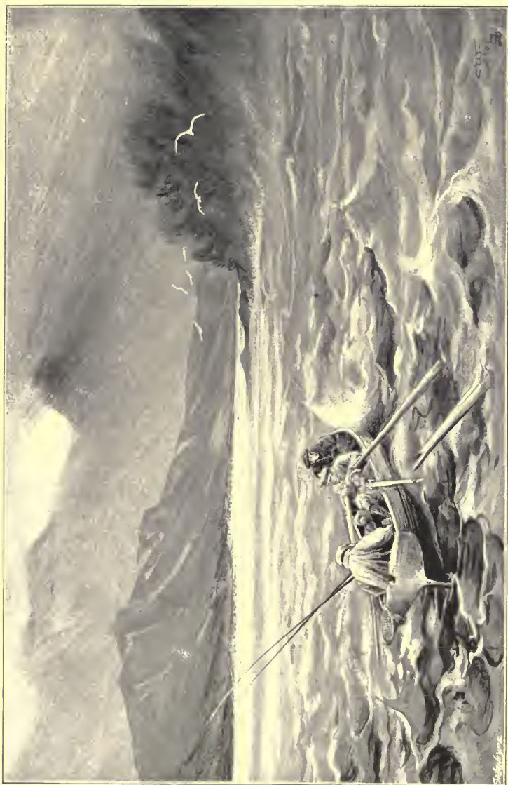
• GALE ON THE LOCH—THE CRAZY OAR AND OARSMAN.