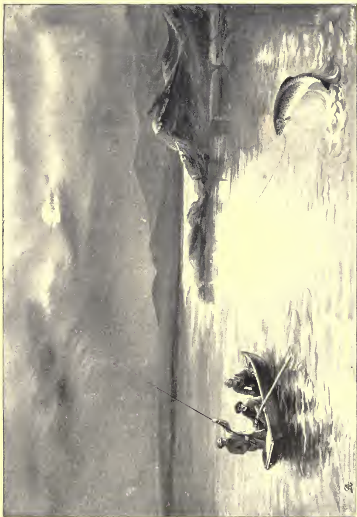
A FISH, WITH CATCHERS.