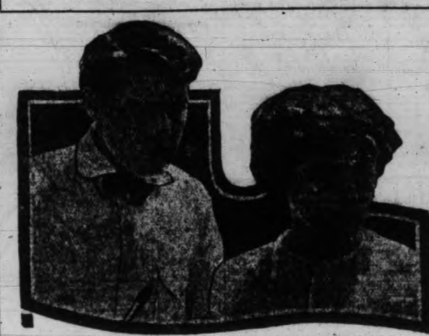
Marion Davies and Forrest Stanley in the Paramount Picture Beauty's Worth Directed by Cosmopolitan Productions