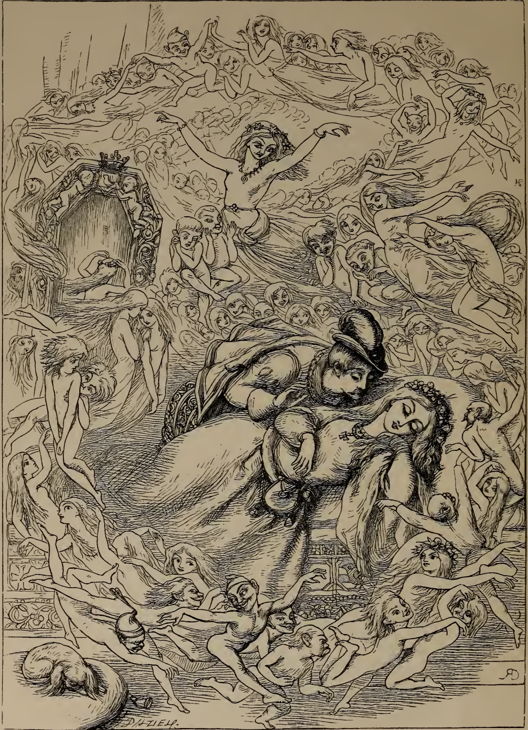
“And o’er his head, and round the bed, By the protecting Fairy led.”